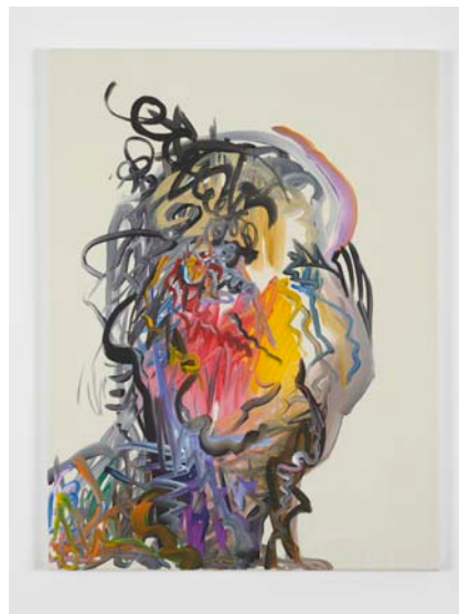
Ida Ekblad PAPA 2015 Watercolour on paper 76 x 56 cm / 29.9 x 22 in 89.9 x 74.4 cm / 35.3 x 29.2 in (framed)