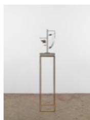
Carol Bove Mussel Shell , 2014 Peacock feather, seashell, found steel object, concrete, and brass 67 1/4 x 12 1/2 x 12 inches 170.8 x 31.8 x 30.5 cm BOVCA0581