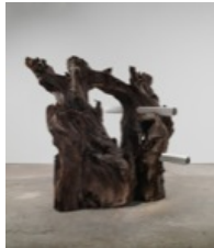
Carol Bove Circles , 2015 Redwood, stainless steel and urethane paint 79 x 86 x 36 inches 200.7 x 218.4 x 91.4 cm BOVCA0616