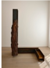
Carol Bove Lingam , 2015 Petrified wood and steel 120 x 60 x 38 inches 305 x 152.5 x 96.5 cm BOVCA0579