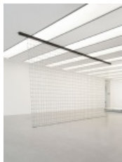
Carol Bove Second Cartesian Sculpture , 2015 Steel and zinc-plated steel 144 x 336 inches 365.8 x 853.4 cm BOVCA0594