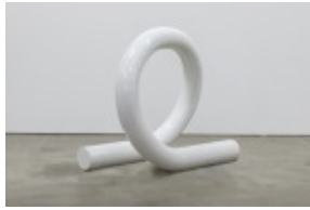
Carol Bove Temperance , 2015 Stainless steel and urethane paint 55 x 33 x 58 1/4 inches 139.7 x 83.8 x 148 cm BOVCA0573