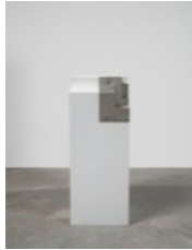
Carol Bove M.D.O. , 2015 Concrete and painted medium-density overlay 59 3/4 x 23 1/2 x 23 1/2 inches 151.8 x 59.7 x 59.7 cm BOVCA0624