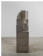
Carol Bove I, quartz pyx, who fling muck beds. , 2015 Concrete and brass 83 1/4 x 23 5/8 x 24 7/8 inches 211.4 x 60 x 63 cm BOVCA0575