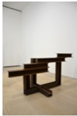
Carol Bove Cow Watched By Argus , 2013 Steel 32 1/2 x 72 1/2 x 26 1/2 inches 82.6 x 184.2 x 67.3 cm BOVCA0479