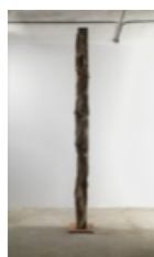
Carol Bove Blindsight , 2014 Driftwood and steel 134 x 16 x 22 inches 340.4 x 40.6 x 55.9 cm BOVCA0559