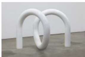
Carol Bove Noodle , 2015 Stainless steel and urethane paint 57 1/16 x 65 3/4 x 57 1/2 inches 145 x 167 x 146 cm BOVCA0574