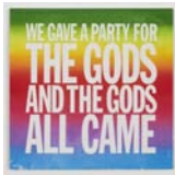
WE GAVE A PARTY FOR THE GODS AND THE GODS ALL CAME, 2015 Acrylic on canvas 40 x 40 inches 101.6 x 101.6 cm