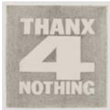
THANX 4 NOTHING, 2013 Graphite on paper 14 x 14 inches 35.6 x 35.6 cm