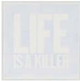
LIFE IS A KILLER, 2015 Cobalt blue watercolor on paper 41 x 41 1/8 inches 104 x 104.5 cm