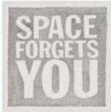
SPACE FORGETS YOU, 2015 Graphite on paper 22 1/4 x 22 1/4 inches 56.5 x 56.5 cm