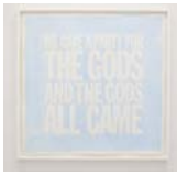
WE GAVE A PARTY FOR THE GODS AND THE GODS ALL CAME, 2015 Cyan Blue watercolor on paper 41 x 41 1/8 inches 104 x 104.5 cm