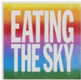
EATING THE SKY, 2015 Acrylic on canvas 40 x 40 inches 101.6 x 101.6 cm