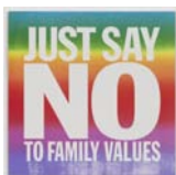
JUST SAY NO TO FAMILY VALUES, 2015 Acrylic on canvas 40 x 40 inches 101.6 x 101.6 cm