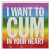
I WANT TO CUM IN YOUR HEART, 2015 Acrylic on canvas 40 x 40 inches 101.6 x 101.6 cm