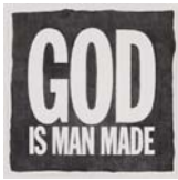
GOD IS MAN MADE, 2015 Watercolor on paper 22 x 22 inches 55.9 x 55.9 cm