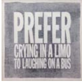
PREFER CRYING IN A LIMO TO LAUGHING ON A BUS, 2015 Graphite on paper 19 x 19 inches 48.3 x 48.3 cm