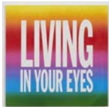
LIVING IN YOUR EYES, 2015