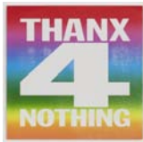
THANX 4 NOTHING, 2015 Acrylic on canvas 40 x 40 inches 101.6 x 101.6 cm