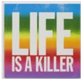
LIFE IS A KILLER, 2015