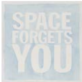
SPACE FORGETS YOU, 2015 Cobalt blue turquoise watercolor on paper 41 x 41 1/8 inches 104 x 104.5 cm