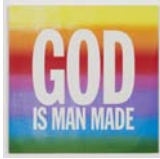
GOD IS MAN MADE, 2015 Acrylic on canvas 40 x 40 inches 101.6 x 101.6 cm