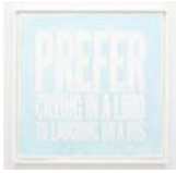
PREFER CRYING IN A LIMO TO LAUGHING ON A BUS, 2015 Turquoise watercolor on paper 41 x 41 1/8 inches 104 x 104.5 cm