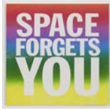
SPACE FORGETS YOU, 2015 Acrylic on canvas 40 x 40 inches 101.6 x 101.6 cm