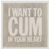
I WANT TO CUM IN YOUR HEART, 2013 Graphite on paper 12 1/4 x 12 1/4 inches 31.1 x 31.1 cm