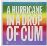
HURRICANE IN A DROP OF CUM, 2015