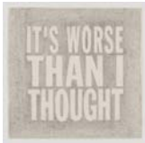
IT'S WORSE THAN I THOUGHT, 2012 Graphite on paper 14 x 14 inches 35.6 x 35.6 cm