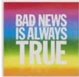
BAD NEWS IS ALWAYS TRUE, 2015