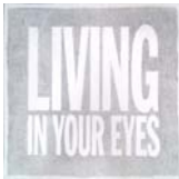
LIVING IN YOUR EYES, 2015 Graphite on paper 19 x 19 inches 48.3 x 48.3 cm