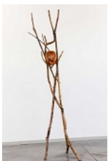
GIUSEPPE PENONE Terra su terra - Volto (Earth on Earth - Face) , 2014 Bronze, terracotta 94 7/16 x 39 5/16 x 23 9/16 in. (240 x 100 x 60 cm) No. 16658