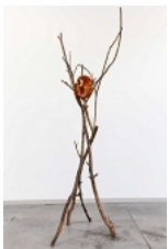
GIUSEPPE PENONE Terra su terra - Volto (Earth on Earth - Face) , 2014 Bronze, terracotta 93 11/16 x 35 3/8 x 27 1/2 in. (238 x 90 x 70 cm) No. 16659