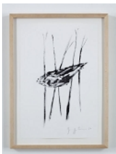
GIUSEPPE PENONE Project for "Breath of Leaves" , 1980 Drawing, Chinese ink on paper 22 1/4 x 16 1/4 x 1 1/2 in. (56.52 x 41.28 x 3.81 cm) No. 3292