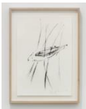
GIUSEPPE PENONE Untitled , 1979 Graphite, ink 18 3/4 x 13 in. (47.63 x 33.02 cm) No. 3356