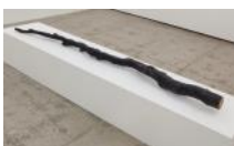
GIUSEPPE PENONE Gli anni dell'albero più uno (The Years of the Tree plus One) , 1969-2013 Boxwood, black wax Length: 98 7/16 in. (250 cm) Diameter: 4 in. (10 cm) No. 16655