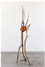
GIUSEPPE PENONE Terra su terra - Volto (Earth on Earth - Face) , 2014 Bronze, terracotta 88 3/16 x 29 1/2 x 19 5/8 in. (224 x 75 x 50 cm) No. 16657