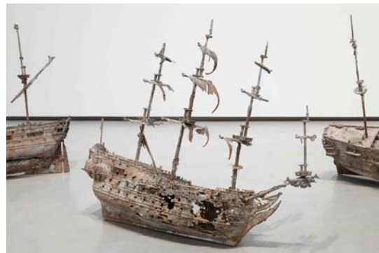
The Mineral World III