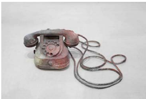
Tendence of Frost 2014 Patinated bronze 5 1/2 x 17 1/2 x 16 in. 14 x 44.5 x 40.6 cm Edition 1 of 3 JCG7755.1