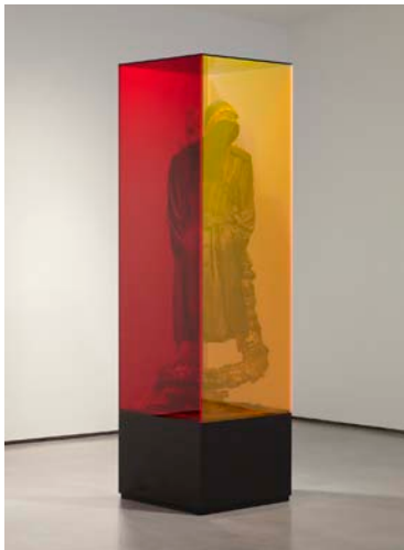
The Knights Move