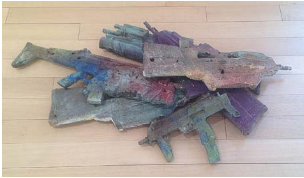
Nervous System III 2014 Patinated bronze 9 13/16 x 25 3/16 x 2 3/4 in. 24.9 x 64 x 7 cm Edition 1 of 6 JCG7565.1