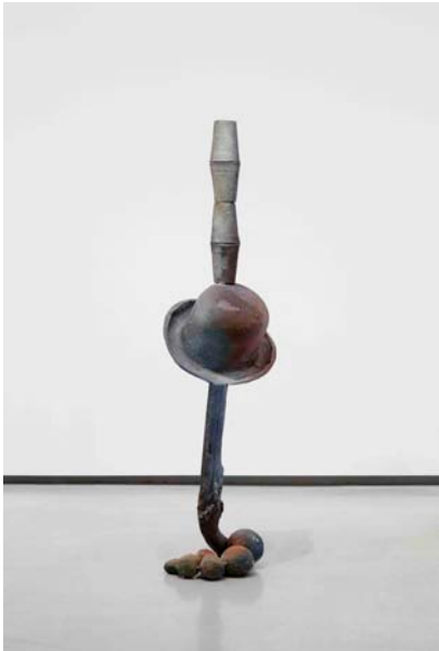
The Trumps Major I 2014 Patinated bronze 39 5/16 x 11 3/4 x 11 3/4 in. 100 x 30 x 30 cm Edition 1 of 3 JCG7552.1