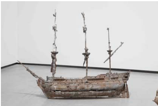
The Mineral World II