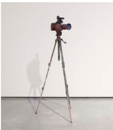
North Meets East, South Meets West