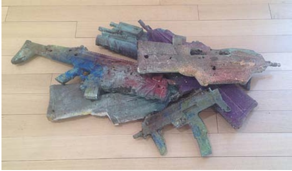
Nervous System VI 2014 Patinated bronze 9 7/16 x 30 11/16 x 2 3/4 in. 24 x 78 x 7 cm Edition 1 of 6 JCG7568.1