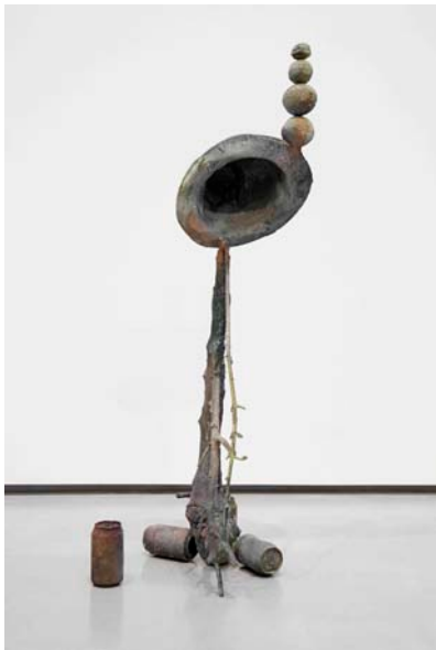
The Trumps Major II 2014 Patinated bronze 43 1/4 x 15 11/16 x 11 3/4 in. 110 x 40 x 30 cm Edition 1 of 3 JCG7553.1