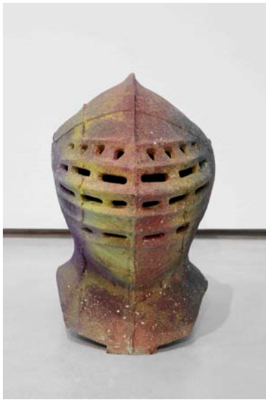
King's Ransom 2014 Patinated bronze 14 1/2 x 10 1/2 x 12 1/2 in. 36.8 x 26.7 x 31.8 cm Edition 1 of 3 JCG7756.1