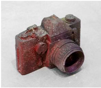
New DNA 2014 Patinated bronze 3 7/8 x 5 7/8 x 2 3/4 in. 10 x 15 x 7 cm Edition 1 of 3 JCG7549.1