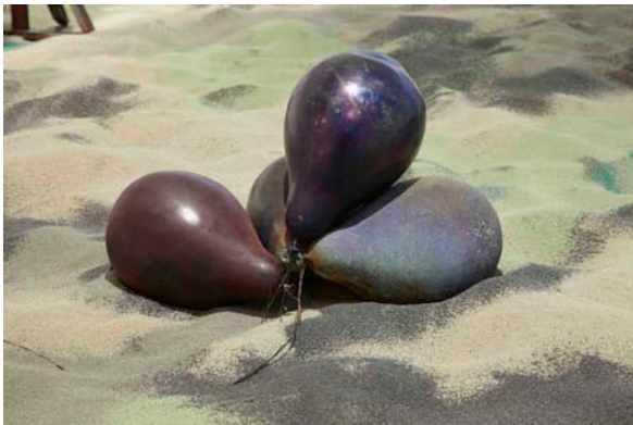
Tears of Mars 2014 Patinated bronze 9 x 12 9/16 x 9 in. 23 x 32 x 23 cm Edition 1 of 3 JCG7551.1