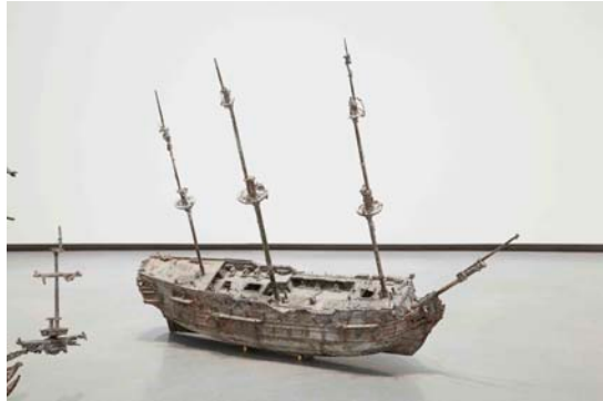
The Mineral World IV