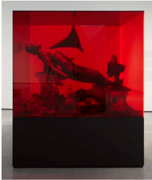
The Eye of Jupiter