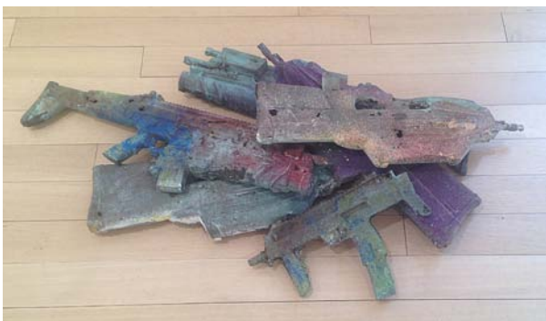
Nervous System V 2014 Patinated bronze 9 13/16 x 25 3/16 x 2 3/4 in. 24.9 x 64 x 7 cm Edition 1 of 6 JCG7567.1