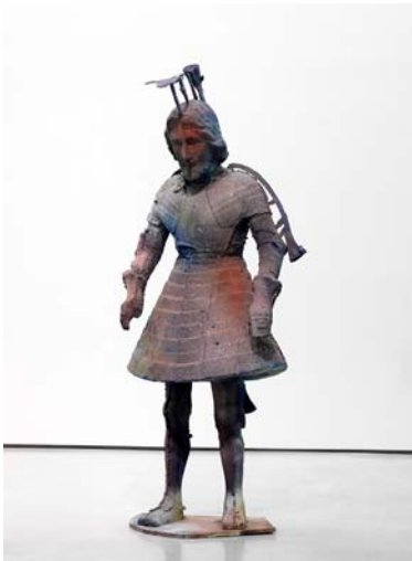
From Stately Throne