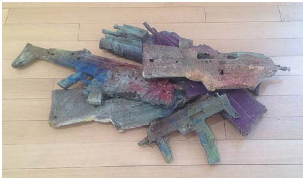
Nervous System IV 2014 Patinated bronze 9 13/16 x 25 3/16 x 2 3/4 in. 24.9 x 64 x 7 cm Edition 1 of 6 JCG7566.1