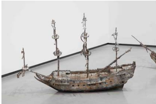
The Mineral World I