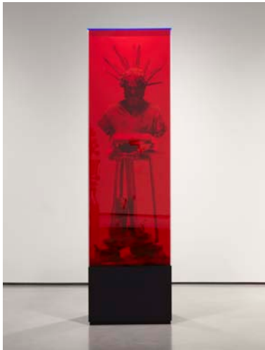
The Last Nation