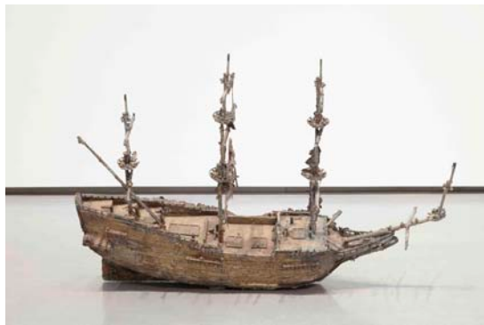
The Mineral World V