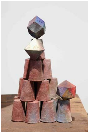
Act of Supremacy 2014 Patinated bronze 15 11/16 x 11 3/4 x 7 13/16 in. 40 x 30 x 20 cm Edition 1 of 3 JCG7554.1