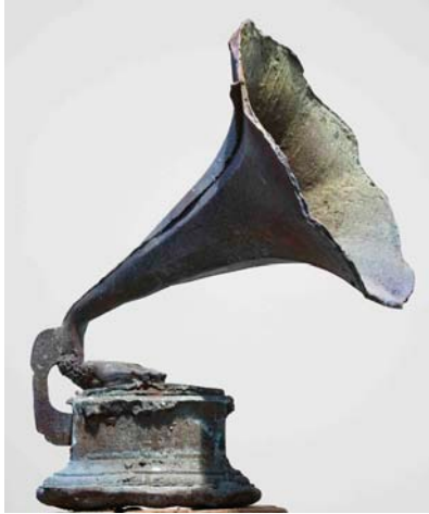
The Last Definition of Ideas 2014 Patinated bronze 30 1/2 x 27 x 25 1/2 in. 77.5 x 68.6 x 64.8 cm Edition 1 of 3 JCG7754.1