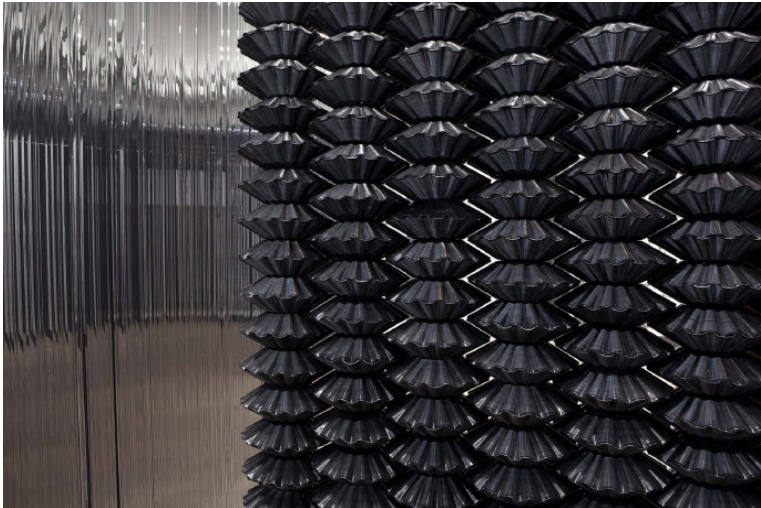
Views of the former exhibition "Die Geschichte läuft über uns" in 2014 at Galerie Perrotin, New York, USA.

希德布蘭特的作品在無聲中訴說感情, 既抒情又富詩意。《Coming by Hazard》以浪漫和家為主題, 透過集體回憶跨越時空, 面向不同世代的觀者, 不論是有意參觀或偶然而來, 預先計劃與否。