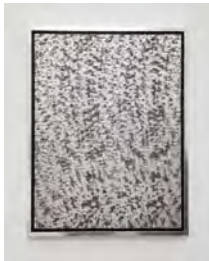
Julia Dault Sound of Silver , 2014 Leather on canvas in gold-leafed wood frame 24 x 18 inches 61 x 45.7 cm Framed: 26 x 20 inches 66 x 50.8 cm (JDA.10027) JD-P-233