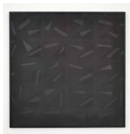
Julia Dault Midnight Cowboy , 2014 Acrylic and oil on canvas in painted wood frame 48 x 48 inches 121.9 x 121.9 cm Framed: 49 1/2 x 49 1/2 inches 121.9 x 121.9 cm (JDA.9579) JD-P-223