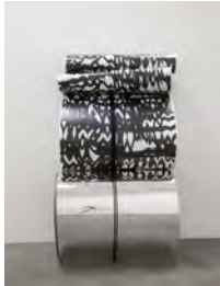
Julia Dault Untitled 38, 8:45 AM - 12:30PM, February 19, 2015 , 2015 Formica, Plexiglas, Everlast boxing wraps, string (JDA.10283)