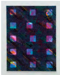
Julia Dault Music Factory , 2014 Oil and acrylic on canvas, leather 24 x 18 inches 61 x 45.7 cm Signed and dated (verso) (JDA.10028) JD-P-228