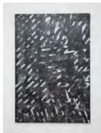
Julia Dault Popular Mechanics , 2014 Acrylic on pleather 61 1/2 x 42 1/2 inches 156.2 x 108 cm (JDA.10254) JD-P-249