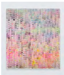
Julia Dault Hero Champ , 2014 Acrylic on canvas 120 x 108 inches 304.8 x 274.3 cm (JDA.10039) JD-P-244