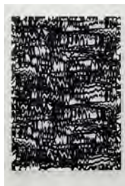
Julia Dault The Wilds , 2013-14 Acrylic and oil on canvas, foiled mesh, and printed spandex in painted wood frame Framed: 64 1/2 x 45 1/2 inches 163.8 x 115.6 cm (JDA.9433)