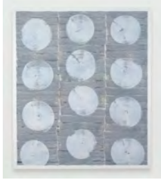
Julia Dault Cosmic Journey , 2014 Acrylic and oil on canvas 84 x 72 inches 213.4 x 182.9 cm (JDA.10038) JD-P-246