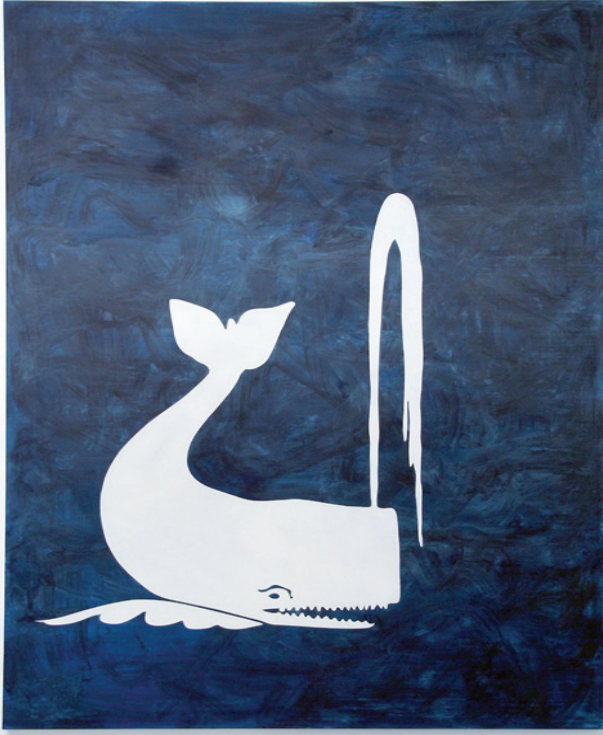
Untitled (White Whale) , 2015. Acrylic on canvas. 118 1/8 x 82 5/8 x 1 5/8 in.

Claire Fontaine Stop Seeking Approval February 26 - April 4, 2015