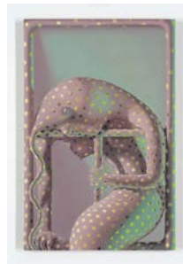
HILT 2015 Oil on linen over panel 32 x 21 in. (81.28 x 53.34 cm.)