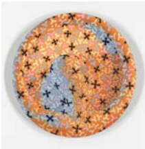
REEF 2015 Oil on linen over panel 12 in. diameter (30.48 cm. diameter)