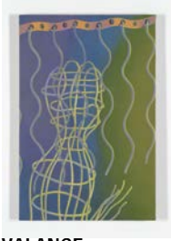
VALANCE 2014/2015 Oil on linen over panel 30 x 20 in. (76.20 x 50.80 cm.)