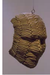
CHUR 2014/2015 Bronze 9 x 6 x 4 1/2 in. (22.86 x 15.24 x 11.43 cm.)