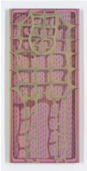
HIDE 2015 Oil on linen over panel 42 3/4 in x 19 in. (108.59 x 48.26 cm.)