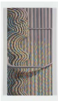
FEEDER 2014 Oil on linen over panel 31 x 16 in. (78.74 x 40.64 cm.)