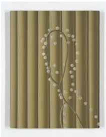
MARKER 2015 Oil on canvas over panel 25 x 19 in. (63.5 x 48.26 cm.)