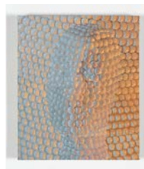
SACCADES 2014 Oil on linen over panel 17 1/2 x 15 in. (44.45 x 38.10 cm.)