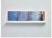
JUAN ARAUJO Casa Baeta Serie 2014 Oil on wood on aluminium, 3 parts 28 x 40.2cm each (11 x 15 7/8in) ARAU 27