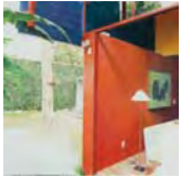
JUAN ARAUJO Casa Baeta XI 2014 Oil on canvas on MDF 56.8 x 56.8cm (22 3/8 x 22 3/8in) ARAU 21