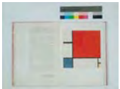
JUAN ARAUJO Color Control 2014 Oil on wood 40 x 52.3cm (15 3/4 x 20 5/8in) ARAU 22