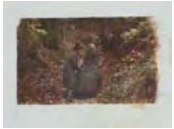
JUAN ARAUJO The World Order/ Faust 2014 Oil on canvas paper 22.7 x 30cm (9 x 11 7/8in) ARAU 33