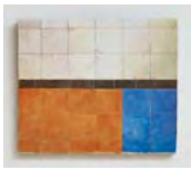
JUAN ARAUJO Mondrianesciam Floor II 2014 Oil on wood 21 x 25cm (8 1/4 x 9 7/8in) ARAU 35