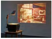
JUAN ARAUJO Hall Baeta 2014 Glass paint on glass, 3 parts Dimensions variable Overall: 143 x 179 x 257cm (56 3/8 x 70 1/2 x 101 1/4in) ARAU 25