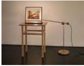
JUAN ARAUJO Casa do Arquiteto Back Light 2014 Glass paint on glass, 4 parts Dimensions variable Overall: 107 x 116 x 64cm (42 1/8 x 45 5/8 x 25 1/4in) ARAU 24