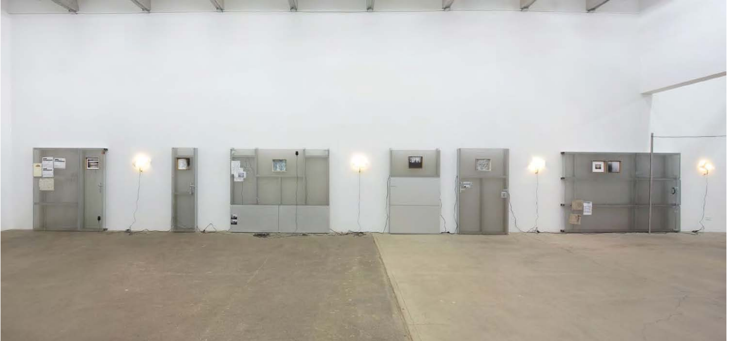
BEN SCHUMACHER New York City Farm Tower 22 January – 21 February, 2015 Installation view