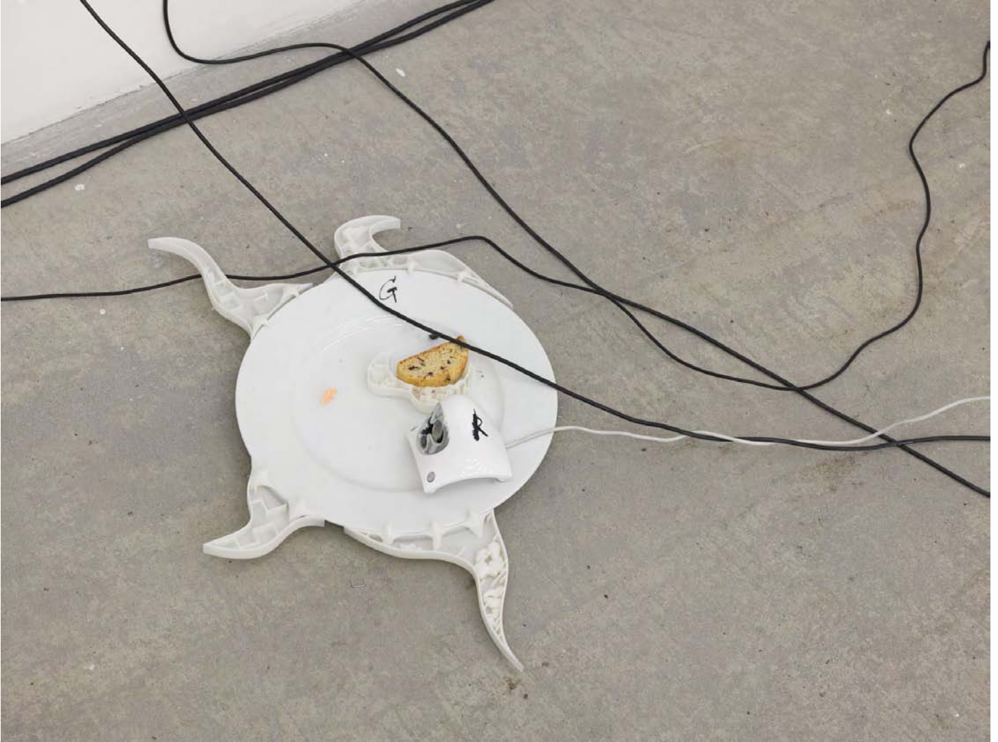
BEN SCHUMACHER New York City Farm Tower 22 January – 21 February, 2015 Detail