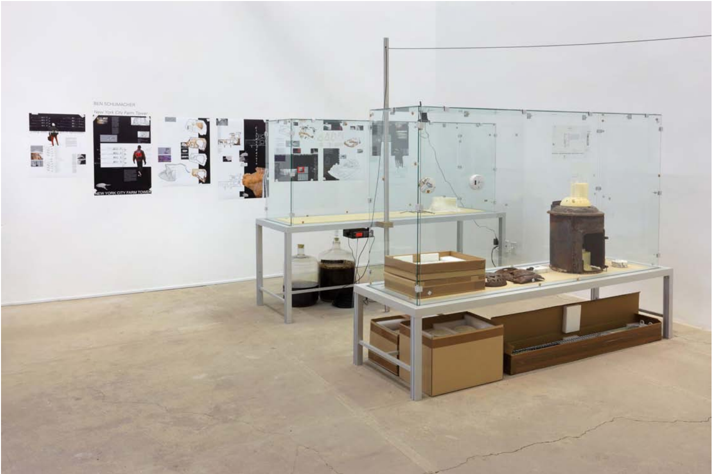
BEN SCHUMACHER New York City Farm Tower 22 January – 21 February, 2015 Installation view