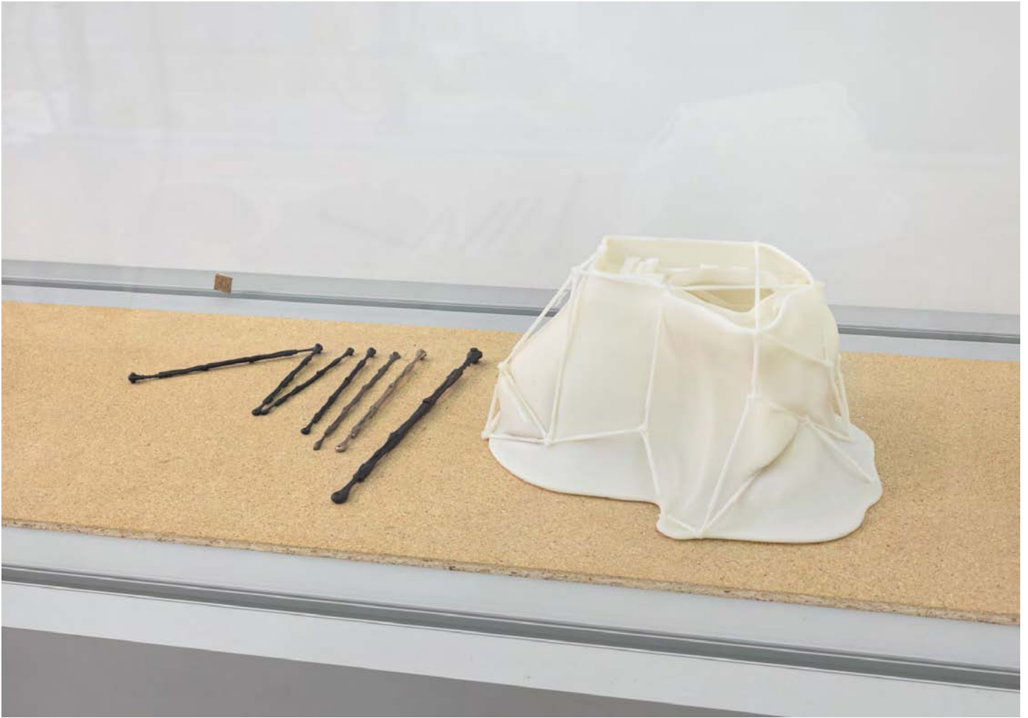
Ben Schumacher New York City Farm Tower, 2015

Detail: 3D architectural model for New York City Farm Tower competition