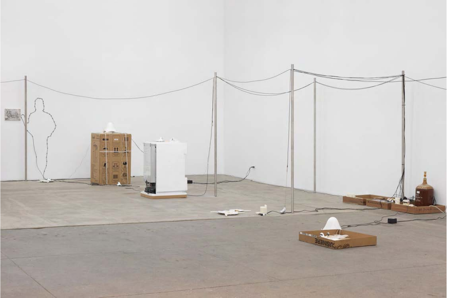
BEN SCHUMACHER New York City Farm Tower 22 January – 21 February, 2015 Installation view