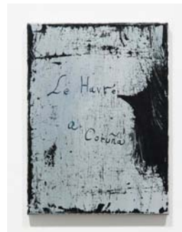
Everyone Has Two Places: Le Havre, a Coruna, 2014 acrylic on canvas 16 x 12 inches; 43 x 31 cm