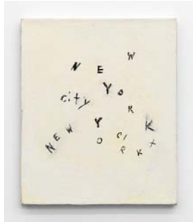
Everyone Has Two Places: New York, New York (there are many examples), 2014 oil on canvas 17 x 14 inches; 43 x 36 cm