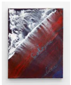
Everyone Has Two Places: Cologne, Ibiza (Nico), 2014 acrylic on canvas 14 x 11 inches; 36 x 28 cm