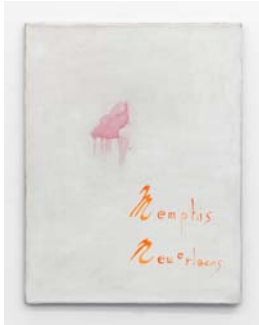
Everyone Has Two Places: Memphis, New Orleans (Alex Chilton), 2014 acrylic and gesso on linen 26 x 20 inches; 66 x 51 cm