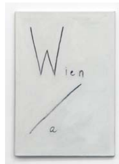
Everyone Has Two Places: Wien, Los Angeles (Fritz Lang), 2014 oil on canvas 31 x 21 inches; 83 x 53 cm