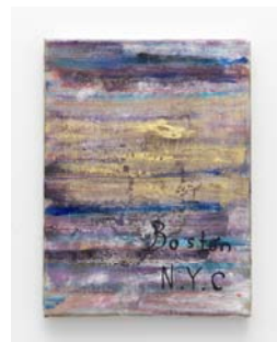
Everyone Has Two Places: Boston, New York (Rene Ricard), 2015 oil on canvas 15 x 11 inches; 38 x 28 cm