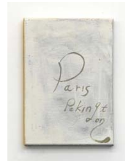
Everyone Has Two Places: Paris, Parkington (Humber Humbert), 2014 oil on canvas 13 x 9 inches; 33 x 23 cm