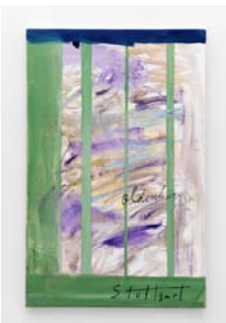
Everyone Has Two Places: Oldenburg, Stuttgart (Ulrike Meinhoff), 2014 oil on canvas 33 x 21 inches; 84 x 53 cm