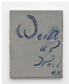
Everyone Has Two Places: Weimar, Dresden, 2014 oil on canvas 13 x 10 inches; 33 x 25 cm