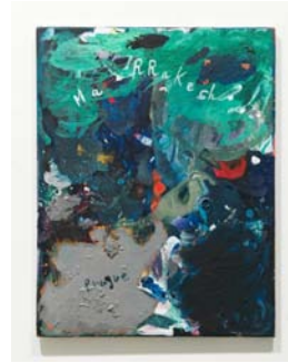
Everyone Has Two Places: Marrakesh, Prague, 2014 acrylic on canvas 22 x 17 inches; 56 x 43 cm