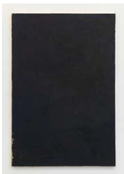
Everyone Has Two Places: Thornton, Hawthorne (Emily Bronte), 2014 oil on canvas 31 x 21 inches; 83 x 53 cm