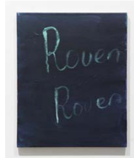
Everyone Has Two Places: Rouen, Rouen (Gustav Flaubert), 2014 acrylic on canvas 22 x 18 inches; 56 x 46 cm