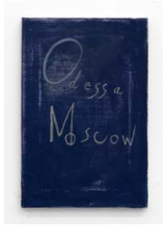
Everyone Has Two Places: Odessa, Moscow (Anna Akhmatova), 2014 oil on canvas 15 x 10 inches; 38 x 25 cm