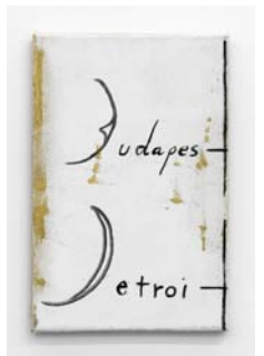
Everyone Has Two Places: Budapest, Detroit (Harry Houdini), 2014 oil and gesso on canvas 15 x 10 inches; 38 x 25 cm