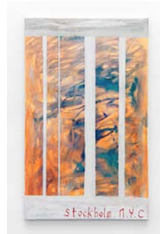
Everyone Has Two Places: Stockholm, New York (Greta Garbo), 2014 oil on canvas 34 x 21 inches (86 x 53 cm)