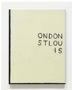
Everyone Has Two Places: London, St. Louis (TS Eliot), 2014 acrylic on canvas 16 x 12 inches; 41 x 31 cm