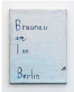
Everyone Has Two Places: Braunau am Inn, Berlin (Adolph Hitler), 2014 oil on canvas 13 x 10 inches; 33 x 25 cm