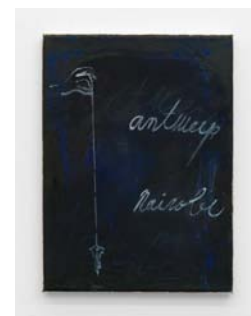
Everyone Has Two Places: Antwerp, Nairobi, 2014 oil on canvas 15 x 11 inches; 38 x 28 cm