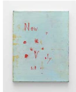
Everyone Has Two Places: Newark, Beverly Hills (Whitney Houston), 2015 oil on canvas 18 x 14 inches; 46 x 36 cm