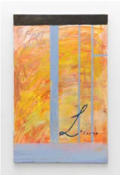
Everyone Has Two Places: Fort Worth, Locarno (Patricia Highsmith), 2014 oil on canvas 33 x 21 inches; 84 x 53 cm