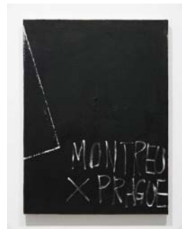
Everyone Has Two Places: Montreux, Prague (Rainer Maria Rilke), 2014 acrylic on canvas 24 x 18 inches; 61 x 46 cm