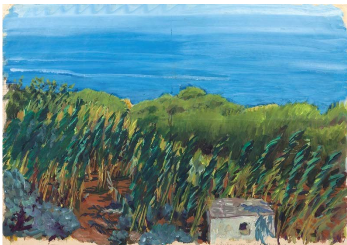
Chicken Coop and Distant Island, 1975

Paul Thek: Ponza and Roma is the first exhibition to examine the paintings and drawings Thek made in Italy during the 1970s. Following three sensational exhibitions of his wax meat pieces and the lost legendary installation The Tomb at New York's Stable and Pace Galleries in the 1960s, Thek spent a significant part of the 1970s in Europe. While there he created a series of large scale collaborative installations constructed from transitory materials such as sand, newspaper and trees. These installations were exhibited at the Stedelijk Museum, Amsterdam; the Moderna Museet, Stockholm; "Documenta V," Kassel; the Kunstmuseum Lucerne and Wilhelm-Lehmbruck-Museum der Stadt Duisburg. Concurrently, Thek worked on the Mediterranean island of Ponza and in a flat in Trastevere, having first visited Ponza in 1968.