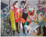
TRB/M 2/00 Tanja Ritterbex "klubbing with taka", 2014 rabbit glue and oil on canvas 140 x 180 cm / 55 x 70 3/4 in