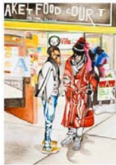
HB/Z 1/00 Helen Bannert "Die Achse des Bösen - Superman und die Burgerarmee werden es richten", 2014 water colour on paper 72 x 100 cm / 28 1/3 x 39 1/3 in