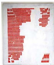
JUK/M 3/00 Judith Kisner "Dots", acrylic, oil on canvas 165 x 135 cm / 65 x 53 1/4 in