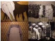
GD/V 1/00 Galina Dimitrova "Circle", 2014