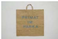
JG/C 1/00 Jochen Goerlach "PRIMAT", 2013 collage 51 x 44 cm / 20 x 17 1/3 in