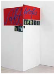
AA-JG/INS 1/00 Ali Altin & Jochen Goerlach "Aktfotofix" (Pop-up-Studio), 2015 mixed media 100 x 200 x 208 cm / 39 1/3 x 78 3/4 x 82 in