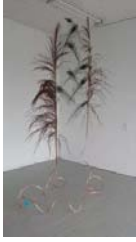
EKK/S 1/00 Eun Kyung Kim "Lady", 2014 mixed media 262 x 152 x 142 cm / 103 1/4 x 59 3/4 x 56 in