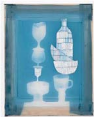
NN/M 10/00 Natasza Niedziolka "Still Life. Photo Exposure", 2012 light-sensitive emulsion, embroidery on polyester, cotton, metal yarn 56 x 44 cm / 22 x 17 1/3 in