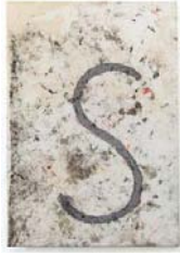
JE/M 1/00 Jens Einhorn Ohne Titel / Untitled, 2014 bleach, organza, distemper oil, oil crayon, fabric on canvas 200 x 140 cm / 78 3/4 x 55 in