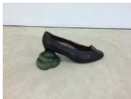
TRB/S 6/00 Tanja Ritterbex "shit happens", 2013 patinated bronze 30 x 28 x 12 cm / 11 3/4 x 11 x 4 3/4 in