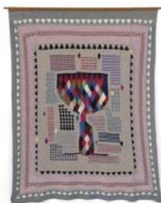
NN/M 3/00 Natasza Niedziolka "Still Life. Yarn", 2012 wool from : cashmere, acrylic, merino, alpaca, linen, hand- knitted and lacquered wood 175 x 125 cm / 69 x 49 1/4 in