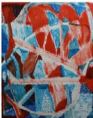
CJW/M 1/00 Carl Johan Wirsell Ohne Titel / Untitled, oil on canvas 59 x 47 cm / 23 1/4 x 18 1/2 in