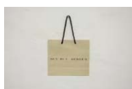
JG/C 7 Jochen Goerlach "Buy Buy", 2013 collage 24 x 23 cm / 9 1/2 x 9 in