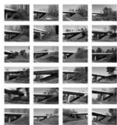
ALK/P 2/00 Alexandre Karaivanov "Poitiers Bordeaux 3-2-1 Go", 2013 Inkjet 70 x 64 cm / 27 1/2 x 25 1/4 in