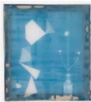
NN/M 11/00 Natasza Niedziolka "Still Life. Photo Exposure", 2012 light-sensitive emulsion on polyester 45 x 40 cm / 17 3/4 x 15 3/4 in