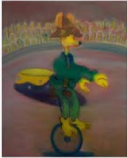
VH/M 2/00 Viktor Henderson "Ohne Titel (cirkus)", 2014 oil on canvas 125 x 100 cm / 49 1/4 x 39 1/3 in