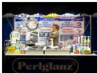
RU/P 3/00 Raphael Unger

digital print, foamcore 42.33 x 31.75 cm / 16 2/3 x 12 1/2 in