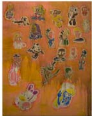
VH/M 3/00 Viktor Henderson "Ohne Titel (comic collage)", 2014 oil on canvas 180 x 140 cm / 70 3/4 x 55 in