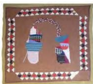
NN/M 13/00 Natasza Niedziolka "Still Life. Yarn", 2012 wool from : linen, bamboo, silk, cashmere, hand-knitted and lacquered wood 170 x 130 cm / 67 x 51 1/4 in