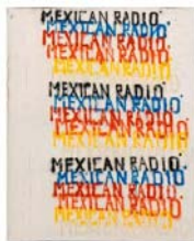
FH/M 3/00 Fabian Herkenhöner "Mexican Radio", 2014 spraypaint, dust on canvas 160 x 130 cm / 63 x 51 1/4 in