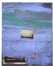
OD/M 1/00 Ørjan Einarsson Døsen "Welcome", 2014 newspaper and gouache on canvas 50 x 40 cm / 19 2/3 x 15 3/4 in