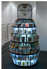
TAK/S 1/00 Taka Kagitomi "Das Waisenhaus", 2010 104 cups, 4 trophies, wood, cage, fluorescent bulbs, acrylic glass, mixed media 176 x 92 x 92 cm / 69 1/3 x 36 1/4 x 36 1/4 in