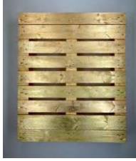
NBT/S 2/00 Nils Bleibtreu "Epal Euro 2", 2014 composition leaf, wood, nails 120 x 100 x 17 cm / 47 1/4 x 39 1/3 x 6 2/3 in