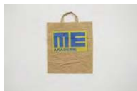
JG/C 4 Jochen Goerlach "Me Akademie", 2013 collage 41 x 31 cm / 16 1/4 x 12 1/4 in