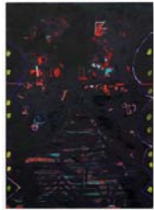
ALH/M 1/00 Alex Heilbron Ohne Titel/Untitled, 2014 oil on canvas 130 x 90 cm / 51 1/4 x 35 1/2 in