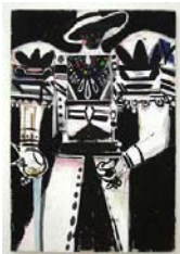
IA/M 2/00 Israel Aten "Cadillac Dreams and Velvet Suits", 2013 acrylic on cardboard on canvas 71 x 110 cm / 28 x 43 1/3 in