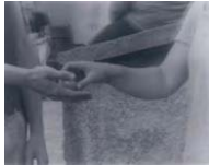
HGB/V 1/00 Hannah Gebauer "The first pancake is always bound to fail", 2014 16mm film digitised