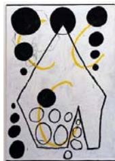
TKR/M 3/00 Tom Krol "Fatima Yamaha", 2014 oil and acrylic and charcoal on canvas 190 x 130 cm / 74 3/4 x 51 1/4 in