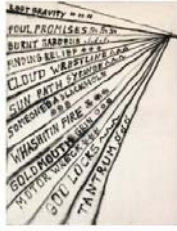
FH/M 4/00 Fabian Herkenhöner "Master Cyclops", 2014 spraypaint on canvas 200 x 150 cm / 78 3/4 x 59 in