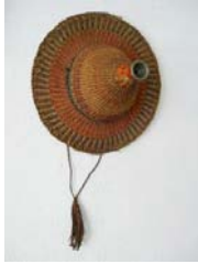
TAK/S 3/00 Taka Kagitomi Ohne Titel / Untitled, 2013 straw hat, Mun, Japanese Kimono fabric 36 x 36 x 23 cm / 14 1/4 x 14 1/4 x 9 in