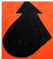
TKR/M 2/00 Tom Krol "Museo", 2014 oil on canvas 190 x 170 cm / 74 3/4 x 67 in