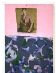
OD/M 2/00 Ørjan Einarsson Døsen "Modern Man", 2014 newspaper, gouache and acrylic on canvas 50 x 35 cm / 19 2/3 x 13 3/4 in