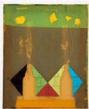
NN/M 12/00 Natasza Niedziolka "Still Life. Photo Exposure", 2012 light-sensitive emulsion, embroidery on polyester, cotton yarn 55 x 45 cm / 21 2/3 x 17 3/4 in