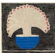
NN/M 5/00 Natasza Niedziolka "Still Life. Embroidery", 2012 embroidery on cotton, acrylic, cotton, metal yarn 75 x 80 cm / 29 1/2 x 31 1/2 in