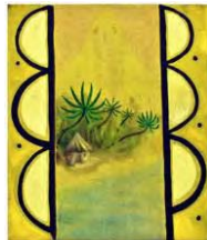
NKS/M 1/00 Nikita Schmitz "Aduney Island", oil on canvas 68 x 78 cm / 26 3/4 x 30 2/3 in