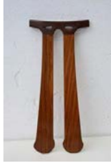
TAK/S 2/00 Taka Kagitomi Ohne Titel / Untitled, 2014 wood 57 x 25 cm / 22 1/2 x 9 3/4 in