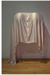
EKK/S 2/00 Eun Kyung Kim "Goddess", 2014 mixed media 180 x 110 x 57 cm / 70 3/4 x 43 1/3 x 22 1/2 in