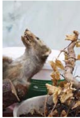
CK/P 1/00 Christoph Kipp Ohne Titel / Untitled, 2014 45 x 30 cm / 17 3/4 x 11 3/4 in