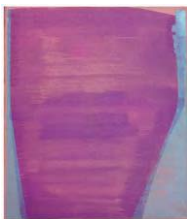
TA/M 4/00 Tamina Amadyar "Bench", 2014 pigment and rabbit glue on linen 70 x 60 cm / 27 1/2 x 23 2/3 in