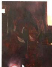
EG/M 1/00 Emily Maria Gernild Ohne Titel / Untitled, 2014 oil on canvas 75 x 95 cm / 29 1/2 x 37 1/2 in