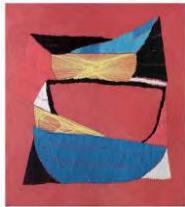
NN/M 9/00 Natasza Niedziolka "Still Life. Embroidery", 2010 embroidery on cotton table cloth, cotton yarn 45 x 41 cm / 17 3/4 x 16 1/4 in