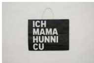
JG/C 2/00 Jochen Goerlach "Ich Mama", 2013 collage 43 x 40 cm / 17 x 15 3/4 in