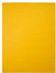
NBT/M 1/00 Nils Bleibtreu "Used Yellow Bambuscarpet- the Hope", 2014 lacquer, wood, metal, fabric 230 x 170 x 4 cm / 90 1/2 x 67 x 1 1/2 in