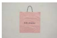
JG/C 6 Jochen Goerlach "Höllenhumor", 2013 collage 44 x 34 cm / 17 1/3 x 13 1/2 in