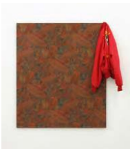
FK/M 4/00 Fabian Kuntzsch "Scotland", 2013 oil, jacket on cotton 140 x 140 cm / 55 x 55 in