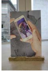
TS/S 1/00 Tomasz Skibicki "Multi-Touch Reproductory Piece", 2014 Inkjet, Perspex and plaster 130 x 90 x 20 cm / 51 1/4 x 35 1/2 x 7 3/4 in