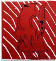
TKR/M 1/00 Tom Krol Ohne Titel / Untitled, 2013 acrylic on canvas 190 x 170 cm / 74 3/4 x 67 in