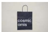
JG/C 5 Jochen Goerlach "Cosmic Omis", 2013 collage 37 x 23 cm / 14 1/2 x 9 in