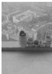
MM/P 2/00 Meike Männel "niewieder 2", 2014 print 59.4 x 84.1 cm / 23 1/2 x 33 in