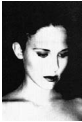
MU/P 2/00 Michael Ullrich "Here & Now", 2014 print 80 x 60 cm / 31 1/2 x 23 2/3 in