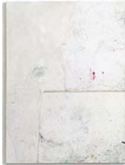
JE/M 3/00 Jens Einhorn Ohne Titel / Untitled, 2013 gesso, dirt, oil, spraypaint, net, canvas on canvas 190 x 140 cm / 74 3/4 x 55 in