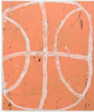
FK/M 1/00 Fabian Kuntzsch Untitled (Ball 1), 2014 oil, acrylic on cotton 150 x 125 cm / 59 x 49 1/4 in