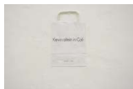
JG/C 3 Jochen Goerlach "Kevin", 2013 collage 30 x 19 cm / 11 3/4 x 7 1/2 in