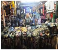
RU/P 1/00 Raphael Unger

charcoal, öl, pastel, pencil on paper and linen 102 x 200 x 47 cm / 40 1/4 x 78 3/4 x 18 1/2 in