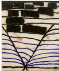
FK/M 3/00 Fabian Kuntzsch "EHEC", 2011 oil, acrylic, lacquer on cotton 160 x 130 cm / 63 x 51 1/4 in