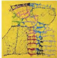
NN/M 8/00 Natasza Niedziolka "Still Life. Embroidery", 2010 embroidery on cotton table cloth, cotton yarn 52 x 49 cm / 20 1/2 x 19 1/3 in