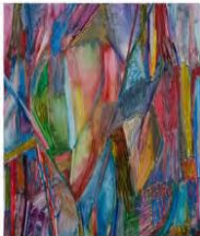
JPL/M 2/00 Jan Pleitner Ohne Titel / Untitled, 2013 oil on canvas 100 x 70 cm / 39 1/3 x 27 1/2 in