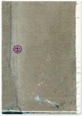
JE/M 2/00 Jens Einhorn "Monster Magnet", 2014 canvas, gesso, distemper, oil, patch on canvas 66 x 46 cm / 26 x 18 in