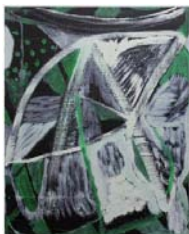
CJW/M 2/00 Carl Johan Wirsell Ohne Titel / Untitled, oil on canvas 51 x 41 cm / 20 x 16 1/4 in