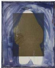
AA/M 3/00 Ali Altin "kleines Mädchen", 2014 mixed media 61 x 51 cm / 24 x 20 in