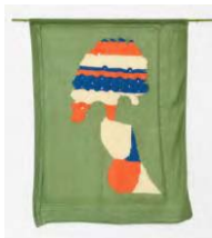
NN/M 1/00 Natasza Niedziolka "Still Life. Yarn", 2012 wool from : silk, cashmere, merino, bamboo, hand-knitted and lacquered wood 77 x 59 cm / 30 1/3 x 23 1/4 in