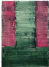
TA/M 3/00 Tamina Amadyar "Dorm", 2014 pigment and rabbit glue on canvas 140 x 100 cm / 55 x 39 1/3 in