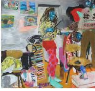
TRB/M 1/00 Tanja Ritterbex "eat my cheese, bitch!", 2014 acrylic on canvas 150 x 140 cm / 59 x 55 in