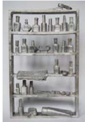
TRB/S 1/00 Tanja Ritterbex "look at me", 2013 aluminium 50 x 70 x 15 cm / 19 2/3 x 27 1/2 x 6 in