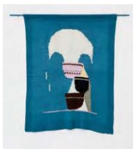
NN/M 2/00 Natasza Niedziolka "Still Life. Yarn", 2012 wool from : bamboo, linen, cashmere, acrylic, hand-knitted and lacquered wood 72 x 56 cm / 28 1/3 x 22 in