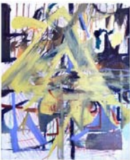
JUK/M 2/00 Judith Kisner "Untitled 16", oil on canvas 160 x 135 cm / 63 x 53 1/4 in