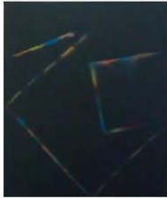
ST/M 3/00 Stefan Theissen "drydown lui", 2014 pigment on canvas 100 x 80 cm / 39 1/3 x 31 1/2 in