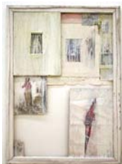
AA/M 4/00 Ali Altin "kleinemuseumtour", 2014 mixed media 99.5 x 72.5 cm / 39 1/4 x 28 1/2 in