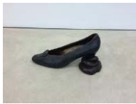
TRB/S 5/00 Tanja Ritterbex "shit happens", 2013 patinated bronze 30 x 28 x 12 cm / 11 3/4 x 11 x 4 3/4 in