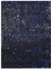
TA/M 1/00 Tamina Amadyar "Abu-Dhabi", 2014 monotype on paper on aluminum 140 x 100 cm / 55 x 39 1/3 in