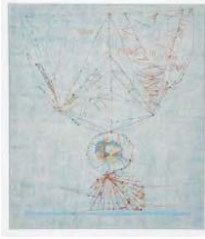
NN/M 7/00 Natasza Niedziolka "Colors, Blue", 2014 embroidery and pigment on cotton, cotton yarn 62 x 54 cm / 24 1/2 x 21 1/4 in