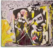
AA/M 5/00 Ali Altin "traumauge", 2014 mixed media 24 x 27 cm / 9 1/2 x 10 2/3 in