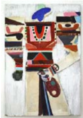
IA/M 1/00 Israel Aten "Cadillac Dreams and Velvet Suits", 2013 acrylic on cardboard on canvas 71 x 110 cm / 28 x 43 1/3 in