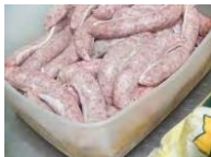
RU/P 4/00 Raphael Unger

digital print, foamcore 42.33 x 31.75 cm / 16 2/3 x 12 1/2 in