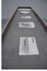
PSE/S 1/00 Phillip Seegets

"Array of thoughts struggling to comprehend themselves", 2014