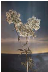
CK/P 2/00 Christoph Kipp Ohne Titel / Untitled, 2014 90 x 60 cm / 35 1/2 x 23 2/3 in