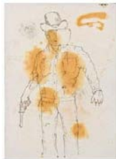
FH/M 2/00 Fabian Herkenhöner "Westworld", 2013 oil, linseed oil, dust, tea on canvas 140 x 100 cm / 55 x 39 1/3 in