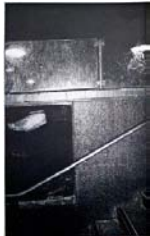
ALK/Z 3/00 Alexandre Karaivanov "Me And The Gang", 2014 crayon on Mylar film 66.5 x 41 cm / 26 1/4 x 16 1/4 in