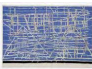
NN/M 6/00 Natasza Niedziolka "FBC Blue Embroidery (full covered background)", 2013 embroidery on cotton, acrylic, cotton yarn 43 x 61 cm / 17 x 24 in