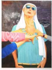
JV/M 1/00 Jan Vedder "Olli 6", oil on canvas 150 x 200 cm / 59 x 78 3/4 in