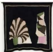
NN/M 4/00 Natasza Niedziolka "Still Life. Yarn", 2012 wool from : linen, hand-dyed merino, acrylic, silk, alpaca, cashmere, hand-knitted and lacquered wood 95 x 125 cm / 37 1/2 x 49 1/4 in