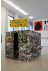
DW-SM/INS 1/00 David Wagner & Sara Müller "African Street Trash", 2014 mixed media dimensions variable / dimensions variable