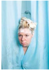
CH/P 2/00 Claudia Holzinger "I've got the look", 2014 photo Alu-Dibon 113 x 80 cm / 44 1/2 x 31 1/2 in