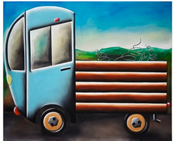
ANDREAS SCHULZE Untitled (Organic Mondial) , 2014 acrylic on nettle cloth 78 ¾ x 94 ½ inches; 200 x 240 cm unique