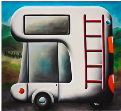
ANDREAS SCHULZE Untitled (New Jersey Sheep) , 2014 acrylic on nettle cloth 78 ¾ x 86 ¾ inches; 200 x 220 cm unique