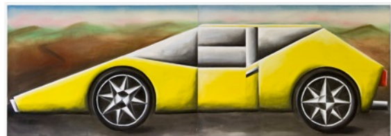
ANDREAS SCHULZE Rombo Duemila , 1998 acrylic on untreated cotton two parts, overall: 63 x 181 inches; 160 x 459 ¾ cm unique