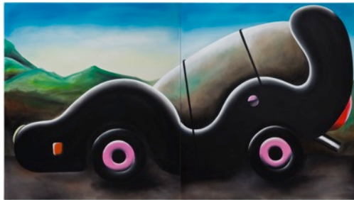
ANDREAS SCHULZE Untitled (Pinkster Parisienne) , 2014 acrylic on nettle cloth two parts: 71 x 126 inches; 180 x 320 cm unique