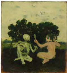
Albert York Woman and Skeleton c. 1967 Oil on canvas mounted on masonite 12 x 11 inches 31 x 28 cm