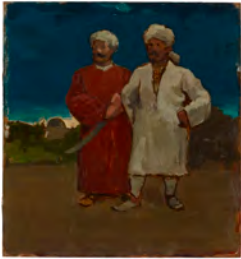
Albert York Oriental Figures in Landscape 1977 Oil on gessoed masonite 10 x 9 1/4 inches 25 x 24 cm