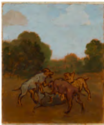
Albert York Four Dogs 1977 Oil on paper mounted on masonite 11 5/8 x 10 inches 30 x 25 cm