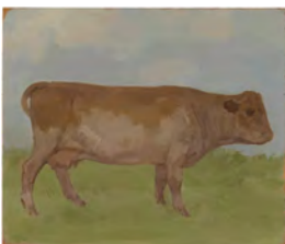
Albert York Brown Cow in a Landscape 1984 Oil on wood panel 9 3/8 x 13 inches 24 x 33 cm