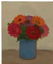
Albert York Zinnias and Pink Rose in Blue Pot 1983 Oil on wood 16 3/8 x 13 inches 42 x 33 cm