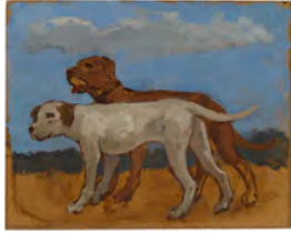
Albert York Brown Dog and Grey Dog 1977 Oil on masonite 9 3/4 x 12 1/4 inches 25 x 31 cm