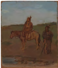
Albert York An Indian on Horseback and an Indian Standing by Water in a Landscape 1981 Oil on masonite 14 x 12 inches 36 x 31 cm