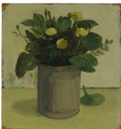
Albert York Buttercups and Green Leaves c. 1966 Oil on wood 12 1/2 x 11 7/8 inches 32 x 30 cm