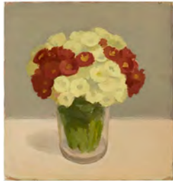
Albert York Yellow and Red Primroses in Glass Jar 1978 Oil on canvas on board 10 7/8 x 10 3/8 inches 27 x 26 cm