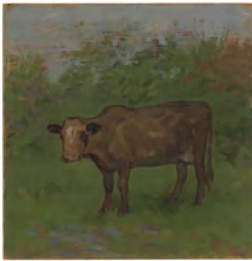
Albert York Brown Cow in Wooded Landscape 1984 Oil on wood panel 14 1/4 x 14 inches 36 x 36 cm