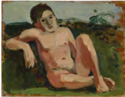
Albert York Seated Male Nude c. 1968 Oil on wood 9 3/4 x 12 5/8 inches 25 x 32 cm