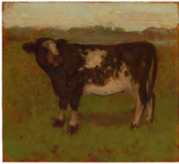
Albert York Cow c. 1972 Oil on board 9 x 10 1/4 inches 23 x 26 cm