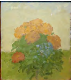
Albert York Flowers in a Landscape 1992 Oil on paper mounted on masonite 13 1/4 x 11 3/4 inches 34 x 30 cm