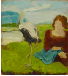
Albert York Seated Woman with a Stork by a Pond in a Landscape c. 1966 Oil on canvas mounted on masonite 10 1/2 x 9 1/2 inches 27 x 24 cm