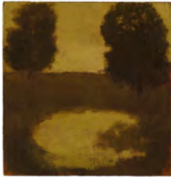
Albert York Twin Trees c. 1963 Oil on canvas mounted on masonite 10 7/8 x 10 1/2 inches 28 x 27 cm