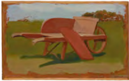
Albert York Wheelbarrow 1974 Oil on wood 7 x 11 1/4 inches 18 x 29 cm