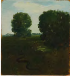
Albert York Landscape with Trees and Snake 1967 Oil on canvas mounted on masonite 12 x 11 inches 31 x 28 cm