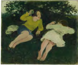
Albert York Two Reclining Women in a Landscape c. 1967 Oil on canvas 10 x 12 inches 25 x 31 cm