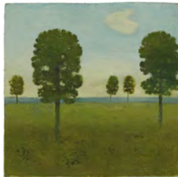
Albert York The Meadow, East Hampton c. 1964 Oil on wood 10 x 10 1/8 inches 25 x 26 cm