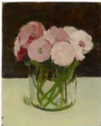
Albert York Pink and White Flowers in Glass Container 1965 Oil on wood 10 x 8 inches 25 x 20 cm