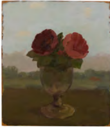
Albert York Two Pink Anemones in a Glass Vase in a Landscape 1982 Oil on masonite 14 x 12 1/8 inches 36 x 31 cm