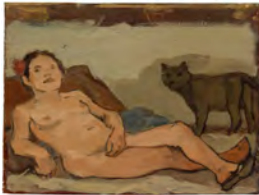
Albert York Reclining Female Nude with Cat 1978 Oil on wood 9 3/8 x 12 5/8 inches 24 x 32 cm