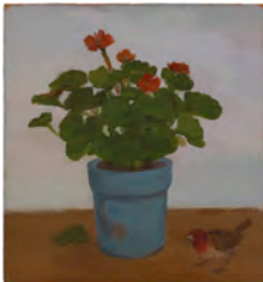
Albert York Geranium in Blue Pot with Fallen Leaf and Bird 1982 Oil on wood panel 18 x 17 inches 46 x 43 cm