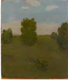
Albert York Landscape with Four Trees, Bush and Pond 1981 Oil on masonite 14 1/16 x 12 inches 36 x 31 cm