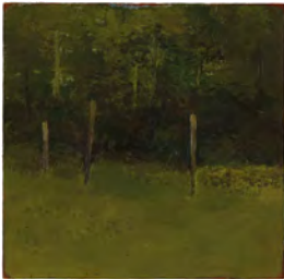
Albert York Edge of the Forest c. 1963 Oil on canvas mounted on masonite 10 1/2 x 10 3/4 inches 27 x 27 cm