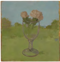
Albert York Landscape with Two Pink Carnations in a Glass Goblet 1983 Oil on wood panel 12 7/8 x 12 inches 33 x 31 cm