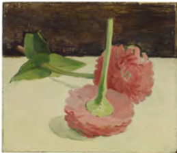
Albert York Two Zinnias c. 1965 Oil on canvas mounted on wood 9 x 10 1/2 inches 23 x 27 cm