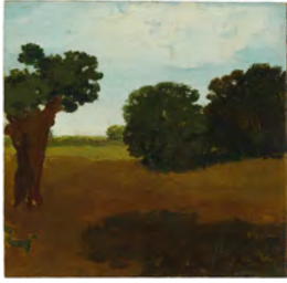
Albert York Field with Trees c. 1969 Oil on panel 11 1/4 x 11 3/4 inches 29 x 30 cm