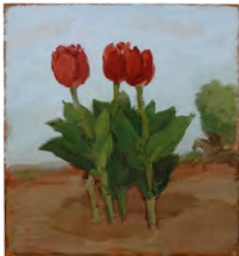
Albert York Three Red Tulips in a Landscape with Horse and Rider 1982 Oil on wood 15 3/8 x 14 1/4 inches 39 x 36 cm