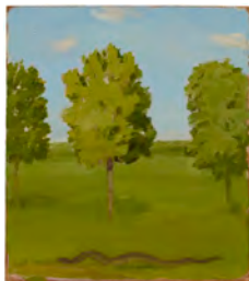
Albert York Landscape with Trees and Snake 1980 Oil on masonite 12 1/2 x 11 inches 32 x 28 cm