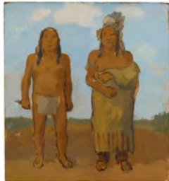
Albert York Indian Brave and Indian Chief 1978 Oil on masonite 10 3/4 x 10 inches 27 x 25 cm