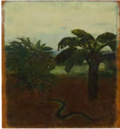
Albert York Tropical Landscape with Palm and Snake c. 1969 Oil on canvas mounted on board 12 x 10 1/2 inches 31 x 27 cm