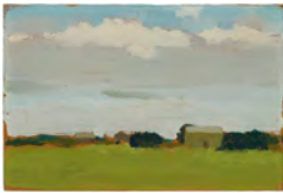
Albert York Farm Landscape c. 1970 Oil on board 7 x 10 1/8 inches 18 x 26 cm