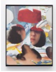
Richard Patterson 'Christina in Red Hat', 2014 Oil on canvas 22 1/2 x 17 1/16 in. / 56.5 x 43.5 cm T009894