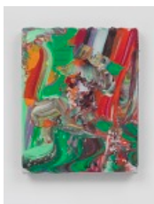
Richard Patterson 'Brave Uncle Ned', 2014 Oil on canvas 10 1/4 x 8 1/8 in. / 26 x 20.6 cm T009461