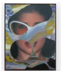
Richard Patterson 'Christina with Yellow Glasses', 2014 Oil on canvas 26.1 x 20 x 1.7 in. / 66.4 x 51.1 x 4.4 cm T009851