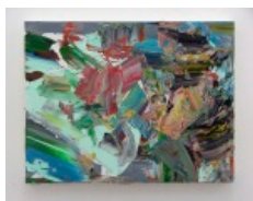
Richard Patterson 'Eve Posing with Guitar', 2013 Oil on linen 17 x 22 1/4 x 1 5/8 in. / 43.3 x 56.5 x 4.2 cm T009845