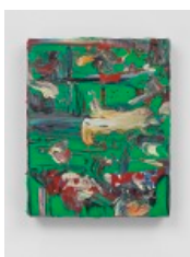
Richard Patterson 'The Cherry Toolshed Door', 2014 Oil on canvas 10 1/4 x 8 1/8 in. / 26 x 20.6 cm T009469