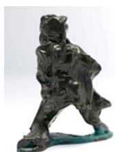
Richard Patterson 'Fair Park Pavilion Sculpture No. 4', 2014 Framed archival C-type print 84 x 64.2 in. / 213.4 x 136 cm ed.1 of 3+2 ap TE003791