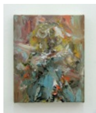
Richard Patterson 'Madame van Toojerstraap', 2014 Oil on canvas 10 1/4 x 8 x 1 in. / 26 x 20.6 x 2.5 cm T009843