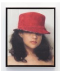
Richard Patterson 'Christina in Red Hat #2', 2014 Oil on canvas 12 x 10 in. / 30.5 x 25.4 cm T009562