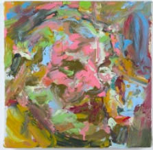
Richard Patterson 'Marianne Leflange', 2012 Oil on canvas 10 x 10 in. / 25.4 x 25.3 cm T008896