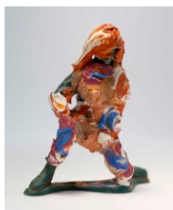
Richard Patterson 'Fair Park Pavilion Sculpture No. 3', 2014 Framed archival C-type print 84 x 67.9 in. / 213.4 x 172.5 cm ed.1 of 3+2 ap TE003790