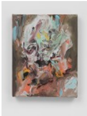
Richard Patterson 'Hester van Toojerstraap', 2014 Oil on canvas 10 1/4 x 8 1/8 in. / 26 x 20.6 cm T009455