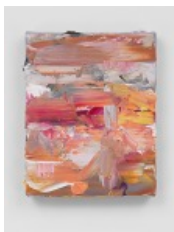
Richard Patterson 'The Wedding Party', 2005 Oil on canvas 10 1/4 x 8 1/8 in. / 26 x 20.6 cm T009460