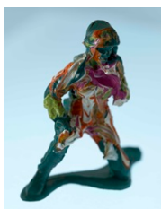
Richard Patterson 'Fair Park Pavilion Sculpture No. 5', 2014 Framed archival C-type print 84 x 64.9 in. / 213.4 x 164.9 cm ed.1 of 3+2 ap TE003792