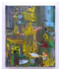
Richard Patterson 'Woman at Her Toilet (after Degas)', 2014 Oil on canvas 10 1/4 x 8 x 1 in. / 26 x 20.6 x 2.5 cm T009842