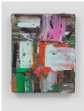
Richard Patterson 'Inner City Pressure', 2014 Oil on canvas 10 1/4 x 8 1/8 in. / 26 x 20.6 cm T009459