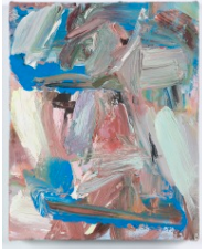
Richard Patterson 'Jan van Toojerstraap', 2005 Oil on canvas 10 x 8 in. / 25.4 x 20.3 cm T008895