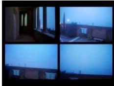
Fog , San Servolo, Venezia 2010 Stampa cromogenica 40 x 58 3/4 inches 101.6 x 149.2 cm