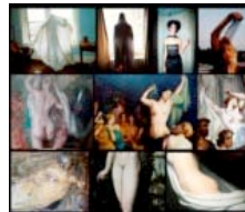
Veils , 2011 - 2014 Stampa cromogenica 45 x 53 inches 114.3 x 134.6 cm