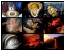
Crazy / Scary 2011 - 2014 Stampa cromogenica 43 1/8 x 55 7/8 inches 109.5 x 141.9 cm