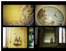
Mirrors and Walls of Palazzo Papadopoli , Venezia, 2010 Stampa cromogenica 40 x 58 3/4 inches 101.6 x 149.2 cm