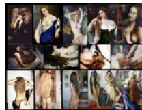
Hair , 2011 - 2014 Stampa cromogenica 45 x 59 inches 114.3 x 149.9 cm