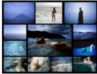
Island Seas , 2014 Stampa cromogenica 48 x 62 5/8 inches 121.9 x 159.1 cm