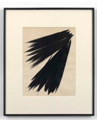
Hans Hartung, Untitled , 1956 Ink on paper 13 1/2 x 10 1/2 in. / 34.5 x 26.5 cm