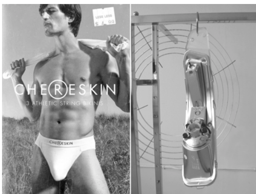
Josephine Meckseper, Less , 2011 Inkjet print on canvas 11 x 14 3/4 in. / 28 x 37.5 cm Edition of 10