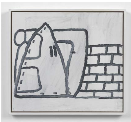
Philip Guston, Untitled , 1969 Acrylic on panel 18 x 20 in. / 45.7 x 50.8 cm

Perret's neon mandala, a work that emerges from the artist's interest in ancient civilisations and their 'new age' interpretations, sits opposite Kiki Smith's arrestingly elegant female figure borrowed from collective mythology. Finally Celmins' starry skies conclude the exhibition in the space of the primal and the infinite.