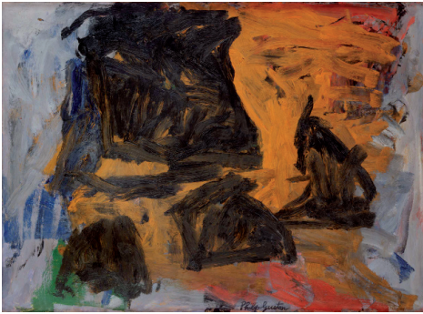
The Light , 1960, oil on Strathmore paperboard on masonite, 55,9 x 76,2 cm (22 x 30 in.)