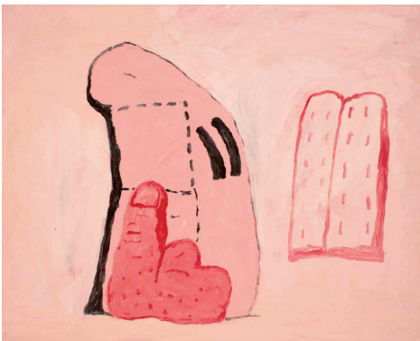
Untitled, 1971, oil on paper mounted on masonite, 72,5 x 89 cm (28 1/2 x 35 in.)