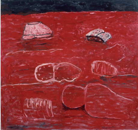
The Light, 1975, oil on canvas, 167,6 x 175,3cm (48 x 42 in.)