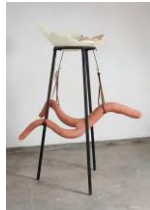
One Three II , 2014 Iron, steel, rubber, plaster, linen, and leather 82 5/8 x 39 3/8 x 59 inches (210 x 100 x 150 cm)