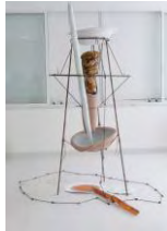
The Bather , 2014 Iron, steel, resin, ceramics, plaster, and cotton paper 86 5/8 x 59 x 59 inches (220 x 150 x 150 cm)