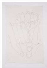
Untitled, 2013 Ink on diaphanous Himalayan handmade paper 30 x 22 inches (76.2 x 55.88 cm)