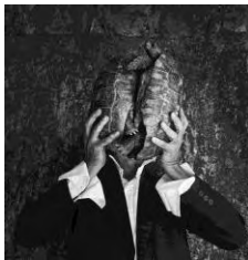
'Adão e Eva', 2014 Ink and cotton on paper Edition 1/10 From an edition of 10 and 2 artist's proofs 19 5/8 x 19 5/8 inches (50 x 50 cm)