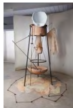
Eros, 2014 Iron, steel, bronze, plaster, quartz crystals, linen, glass pearls, glassine paper, and leather 106 1/4 x 78 3/4 x 78 3/4 inches (270 x 200 x 200 cm)