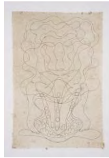
Untitled, 2013 Ink on Himalayan handmade paper 30 x 22 inches (76.2 x 55.88 cm)

531 West 24th Street New York NY 10011 tel 212 206 9100 fax 212 206 9055 www.luhringaugustine.com