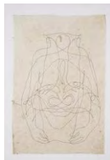
Untitled, 2013 Ink on Himalayan handmade paper 30 x 22 inches (76.2 x 55.88 cm)