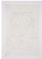
Untitled, 2013 Ink on diaphanous Himalayan handmade paper 30 x 22 inches (76.2 x 55.88 cm)