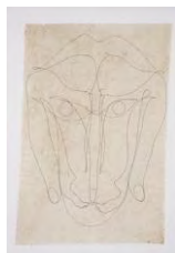
Untitled, 2013 Ink on Himalayan handmade paper 30 x 22 inches (76.2 x 55.88 cm)