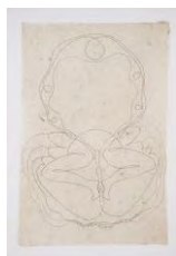
Untitled, 2013 Ink on Himalayan handmade paper 30 x 22 inches (76.2 x 55.88 cm)