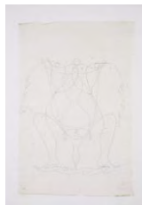
Untitled, 2013 Ink on diaphanous Himalayan handmade paper 30 x 22 inches (76.2 x 55.88 cm)