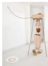
Elixer , 2014 Iron, steel, ceramics, glass pearls, gum arabic, sea sponges, and cotton paper 98 3/8 x 39 3/8 x 90 1/2 inches (250 x 100 x 230 cm)