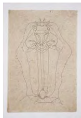
Untitled, 2013 Ink on Himalayan handmade paper 30 x 22 inches (76.2 x 55.88 cm)