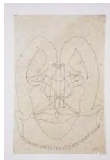
Untitled, 2013 Ink on Himalayan handmade paper 30 x 22 inches (76.2 x 55.88 cm)