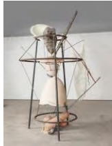
Element S , 2014 Iron, steel, bronze, quartz crystal, plaster, rubber, yellow quartz crystals, and linen 102 3/8 x 74 3/4 x 74 3/4 inches (260 x 190 x 190 cm)

531 West 24th Street New York NY 10011 tel 212 206 9100 fax 212 206 9055 www.luhringaugustine.com