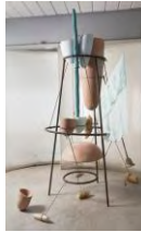
Aurora , 2014 Iron, steel, bronze, ceramics, plaster, linen, and quartz crystals 118 1/8 x 98 3/8 x 98 3/8 inches (300 x 250 x 250 cm)