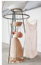
Ela , 2014 Iron, steel, bronze, rubber, resin, ceramics, linen, and leather 114 1/8 x 102 3/8 x 63 inches (290 x 260 x 160 cm)