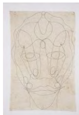
Untitled, 2013 Ink on Himalayan handmade paper 30 x 22 inches (76.2 x 55.88 cm)