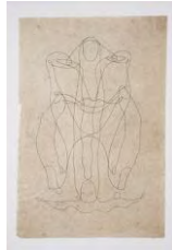
Untitled, 2013 Ink on Himalayan handmade paper 30 x 22 inches (76.2 x 55.88 cm)

531 West 24th Street New York NY 10011 tel 212 206 9100 fax 212 206 9055 www.luhringaugustine.com