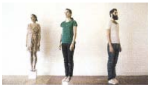
ELODIE PONG Sculptures , 2011 Video Ed. 1/5 + 2 AP HD video loop 21 min. 46 sec. PONG36229