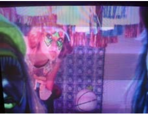
U5 PROBLEM NO #14, 2013 Video Unique 40.26 min. U536215