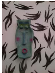
STEPHANE DEVIDAL Masque bleu vert : ouhhouuu , 2014 Plaster, acrylic 75 x 36 x 13,5 cm ( 29 1/2 x 14 1/8 x 5 3/8 inch ) DEVID36206