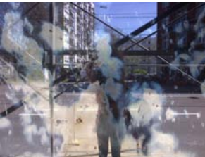
LIVIO BAUMGARTNER Traces III, 2011 Inkjet print on mirrored Dibond 160 x 115 cm ( 63 x 45 1/4 inch ) BAUMG36219