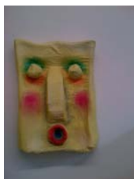
STEPHANE DEVIDAL Masque jaune : HUUUUU , 2014 Plaster, acrylic 71 x 52 x 11,5 cm ( 28 x 20 1/2 x 4 1/2 inch ) DEVID36208