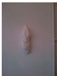
DAGMAR HEPNER Kreise II , 2014 Muslin 60 x 20 cm ( 23 5/8 x 7 7/8 inch ) HEPPN36230