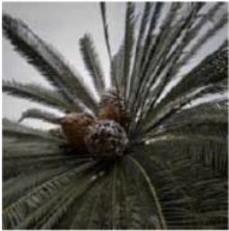
ANA ROLDAN Primeval forms , 2012 Pigment print, framed 27 x 27 cm ( 10 5/8 x 10 5/8 inch ) ROLDA36227