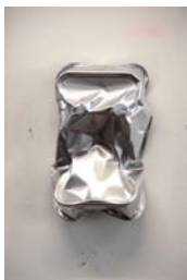
BENI BISCHOF The Grillman's Grillblech, 2014 Tin container 32 x 19 x 12 cm ( 12 5/8 x 7 1/2 x 4 3/4 inch ) BISCH36201