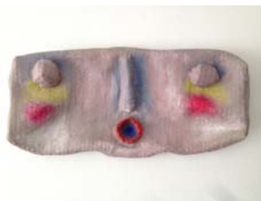
STEPHANE DEVIDAL Masque taupe : heuuuu, 2014 Plaster, acrylic 40 x 81 x 10 cm ( 15 3/4 x 31 7/8 x 3 7/8 inch ) DEVID36204