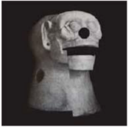
ANA ROLDAN Displacements , 2012 Pigment print, framed 27 x 27 cm ( 10 5/8 x 10 5/8 inch ) ROLDA36223