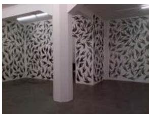
STEPHANE DEVIDAL Oiseaux , 2014 Charcoal Variable DEVID36209