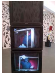
NICOLAS BERSET Trinitron , 2014 3 videos Ed. of 5 + 2 AP Each video between 15–18 min. BERSE36228