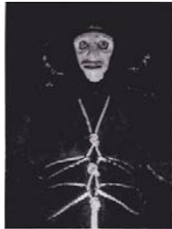
GUILLAUME PILET Learning to Love , 2013 Silver gelatin print Ed. 1/3 + 2 AP 24 x 18 cm ( 9 1/2 x 7 1/8 inch ) PILET36211