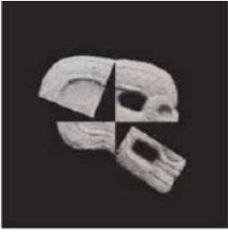
ANA ROLDAN Displacements , 2012 Pigment print, framed 27 x 27 cm ( 10 5/8 x 10 5/8 inch ) ROLDA36224