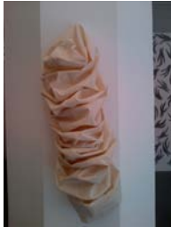
DAGMAR HEPPNER Kreise I, 2014 Canvas 60 x 20 cm ( 23 5/8 x 7 7/8 inch ) HEPPN36231