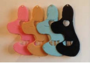
PEDRO WIRZ New York Masks (after Josephine Smith), 2014 Silicone Ed. 1/3 + AP 37 x 32 x 1 cm ( 14 5/8 x 12 5/8 x 3/8 inch ) WIRZ36202