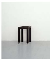
Tombeaux , 1988 black pigmented varnish on wood, 2 rubber & brass wheels 80 x 50 x 50 cm