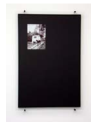
Stèles 2 , 2000 Black & white photograph on black matte board, glass, steel supports 136,5 x 92,7 x 5,1 cm