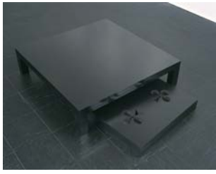
Places (II.1) , 2004 Black coated and painted steel 20 x 110 x 80 cm