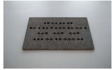
PLACES (III.8) - Venus , 2009 Neo Africa marble 2 x 93 x 64 cm