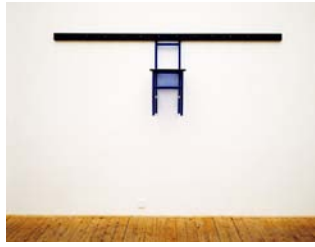
Tombeaux , (1988) 1991 # 4 iron coatrack, cobalt blue glass chair 260 x 37,5 x 207,5 cm