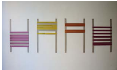
CHARLIE WAS A SAILOR , 2014 Digital print on cardboard 125 x 382 cm