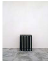
Tombeaux , 1989 Black pigmented varnish on wood 92 x 75 x 45 cm