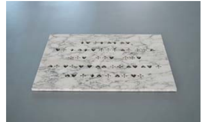
PLACES (III.8) - Rochetta Tanaro , 2009 Bianco arabescato venato marble 2 x 103 x 73 cm