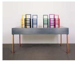
Les Paroles (XV) , 1996 Lead on cherry wood, colours on wood (yellow, blue, green, red, black, white, purple) 165 x 230 x 121 cm