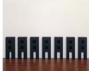
Tombeaux , 1991 Black pigmented varnish on wood 60 x 220 x 12 cm