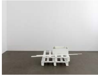
Places [Lost] - 9 , 2010 painted bronze (unique work) 44 x 153 x 67 cm