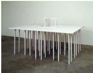
Les Paroles (I) , 1993 White colour on wood, iron, brass 138 x 250 x 170 cm