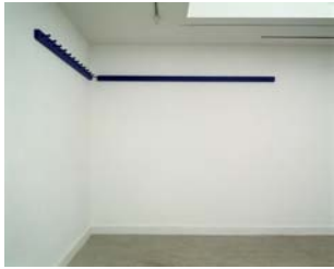
Tombeaux , 1989 Blue pigmented varnish on wood 227 x 547 x 11 cm