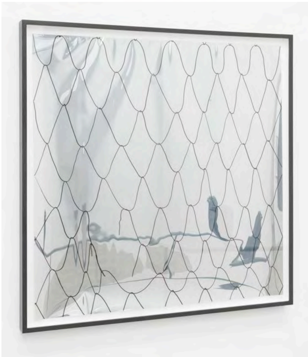
Judith Hopf No Title (Net on Mirror Foil 3) 2014 drawing on reflectiv paper cm 65 x 65 / in 25,2 x 25,2