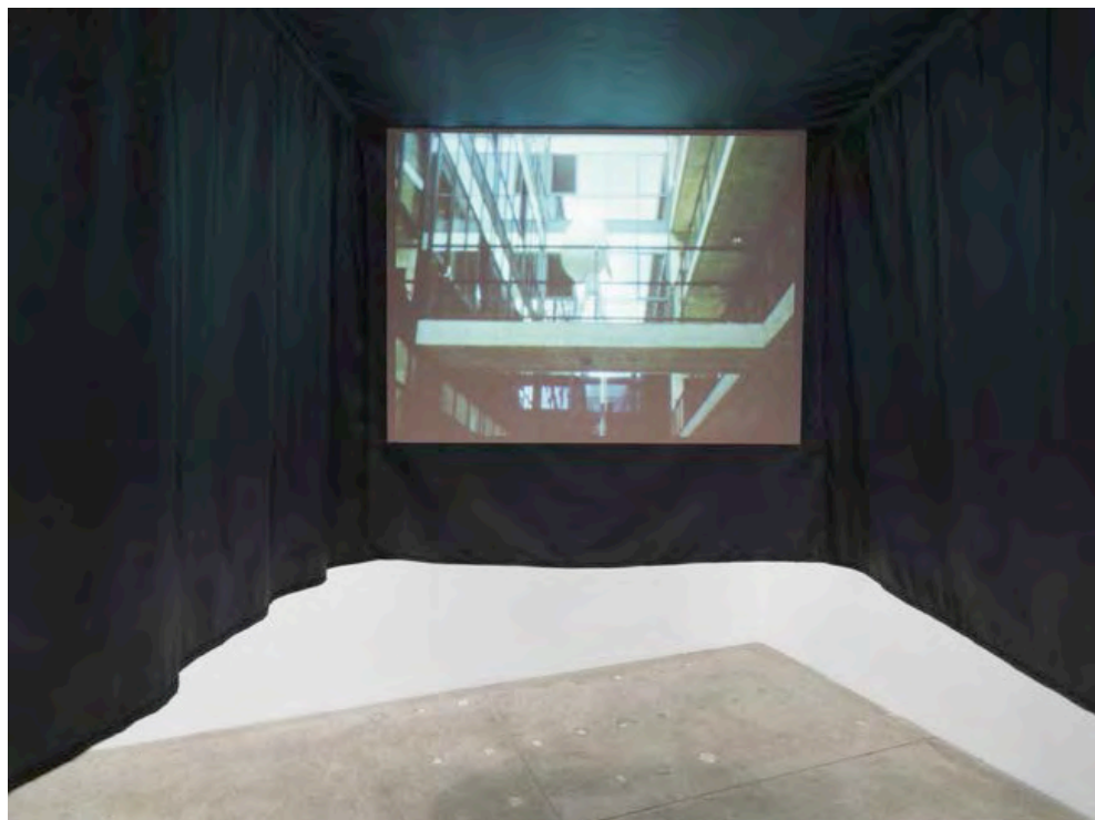
Judith Hopf Some End of Things: the Conception of Youth 2011 8 mm transferred to DVD 3'