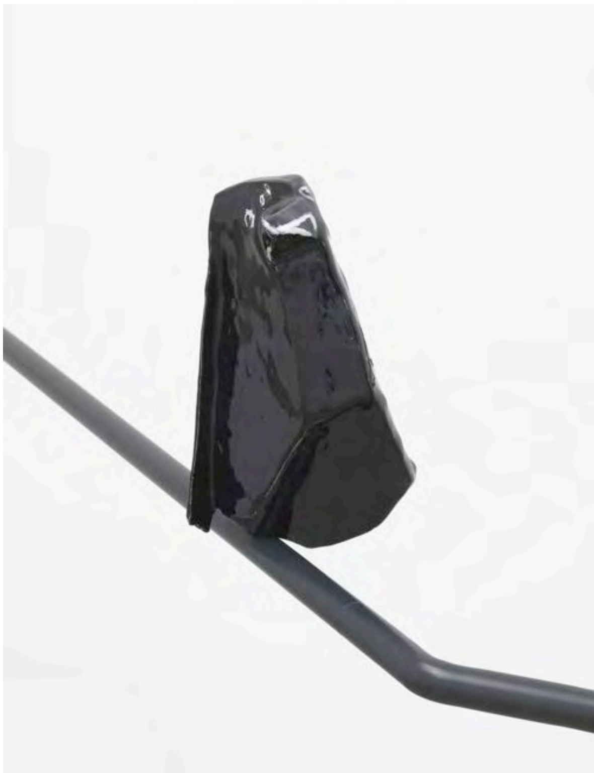
Judith Hopf Bird Looking Back (5) 2014 hand made porcelain, iron handrail cm 26 x 21 x 15 / in 10,1 x 8,1 x 5,3 handrail: site specific