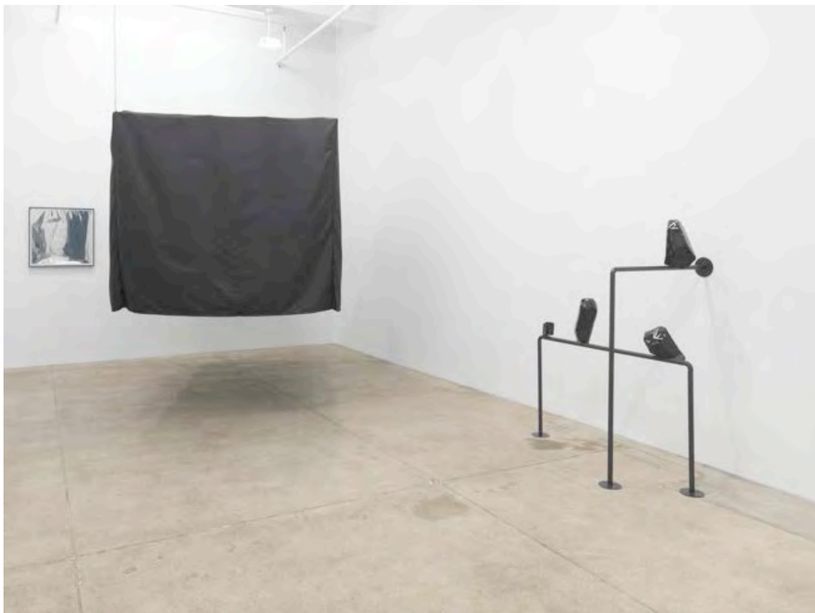
Judith Hopf, Cracking Nuts , installation views at kaufmann repetto, New York, 2014