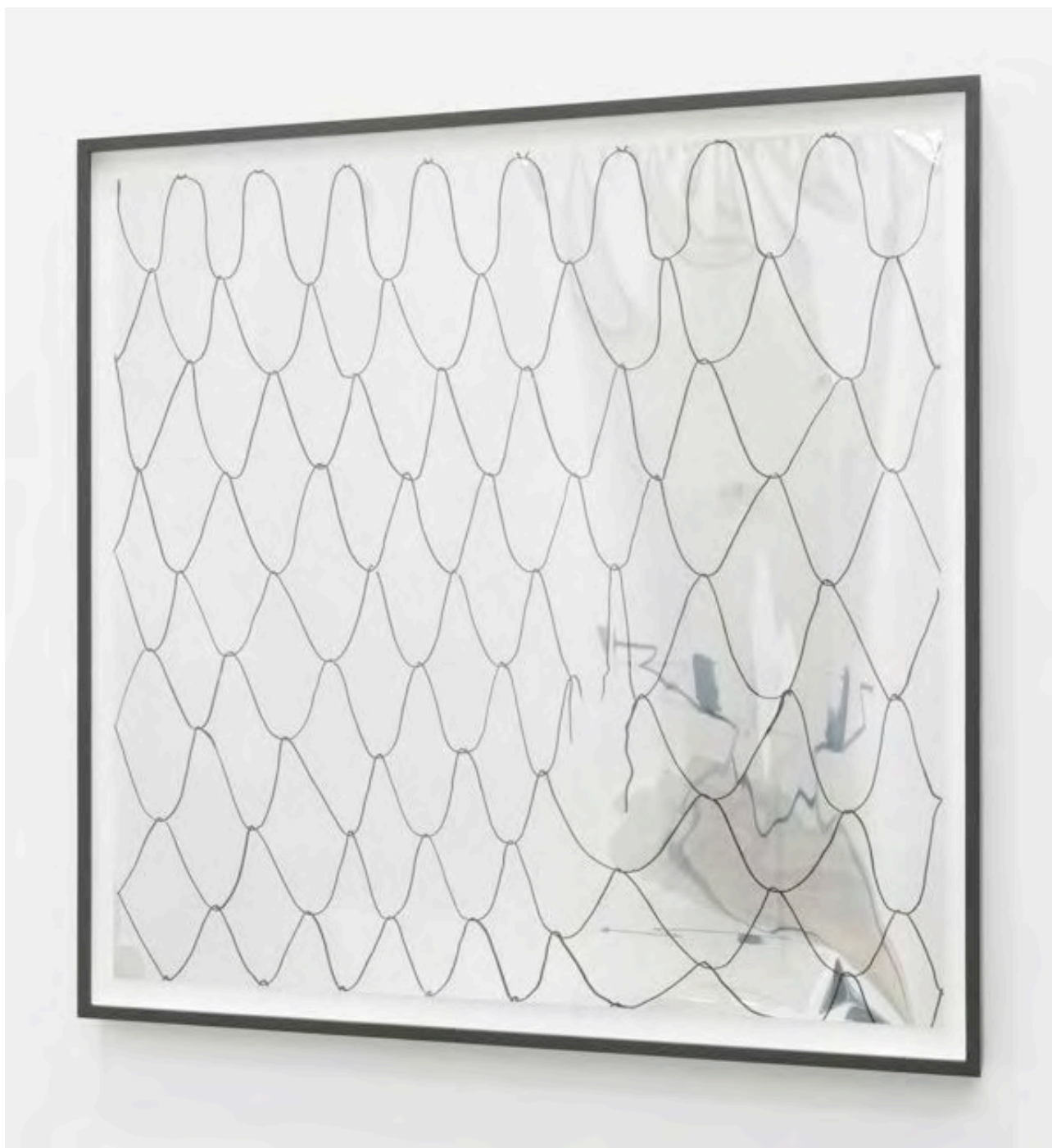
Judith Hopf No Title (Net on Mirror Foil 4) 2014 drawing on reflective paper cm 65 x 65 / in 25,2 x 25,2