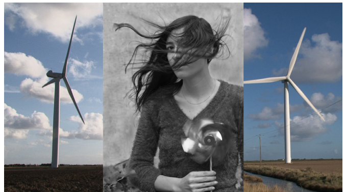
Marie dans le vent, 2014

Photograph and gelatin silver print on fiber-based warmtone paper, HD blu-ray video in loop 108 × 192 cm - 16/9 Format