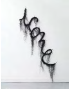
Icône , 2013 Metal wire, nets 235 x 120 cm Inv. # 15060