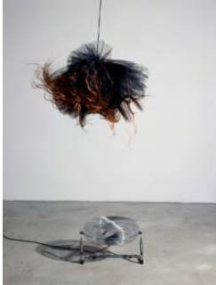
Le tutu échevelé , 2013 Tutu, fake hair, fan, fishing swivel, rope Variable dimension Inv. # 15058