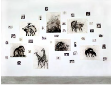
Pulsions , 2013 7 Indian ink drawings, 33 small printed drawings 237 x 386 cm Inv. # 15057