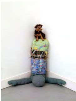
La colonne du petit chien , 2000-2012 Various fabric, taxidermized animal 75 x 80 x 35 cm Inv. # 15059