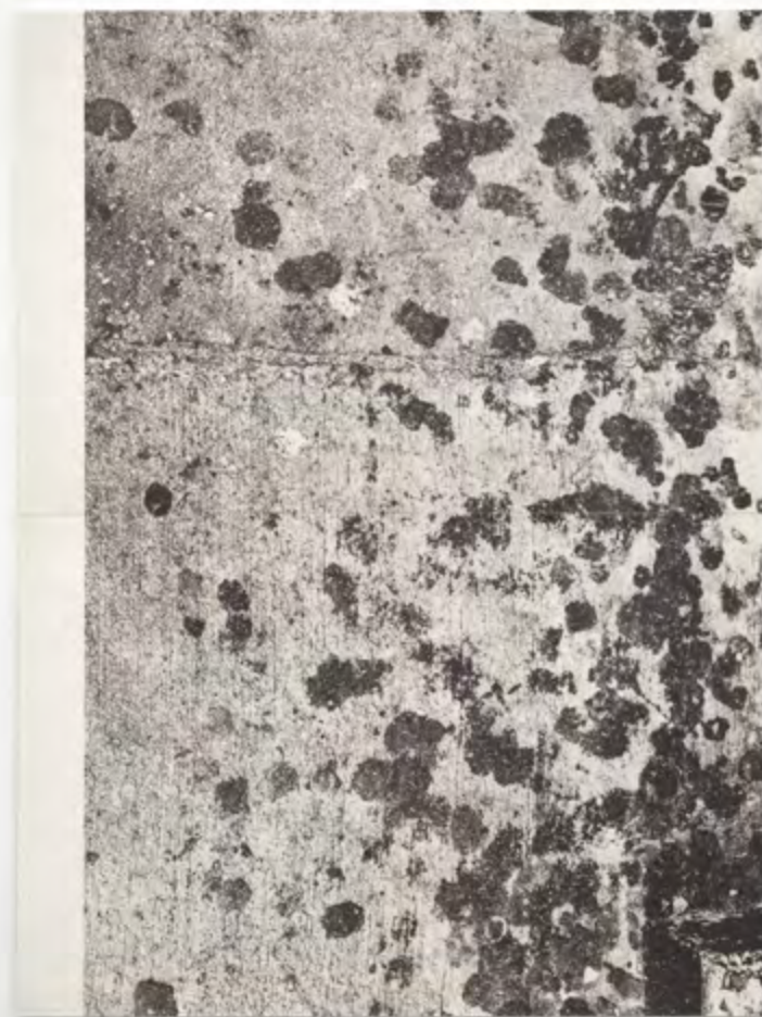
Adam McEwen Untitled, 2013 Inkjet print on cellulose sponge 200.34 x 149.86 cm 78 7/8 x 59 in