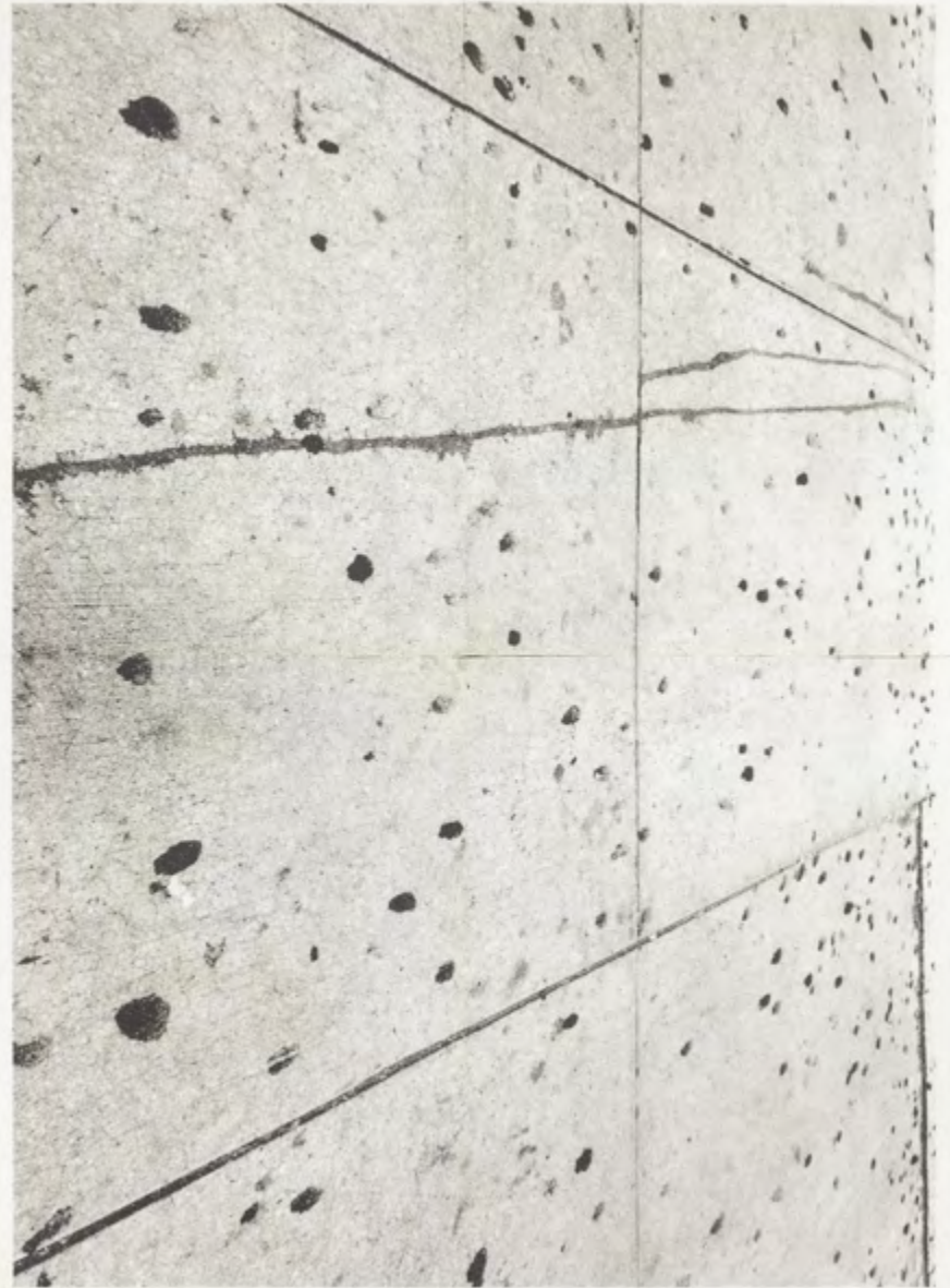
Adam McEwen Untitled, 2013 inkjet print on cellulose sponge 200 x 150 cm (78 3/4 x 59 in)