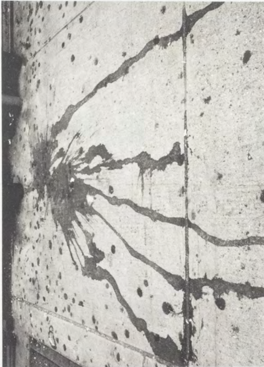
Adam McEwen Untitled, 2013 inkjet print on cellulose sponge 200 x 150 cm (78 3/4 x 59 in)