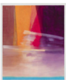
Miriam Cahn beschuss , 2009 Oil on Linen 94.49 x 78.74 inches 240 x 200 cm (EDG6824)