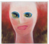
Miriam Cahn madonna , 2001-02 Oil on Linen 51 1/8 x 55 1/8 inches 130 x 140 cm (EDG6826)