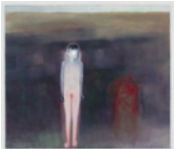
Miriam Cahn zornig betrachten , 2007 Oil on Linen 98.03 x 80.31 inches 249 x 204 cm (EDG6828)