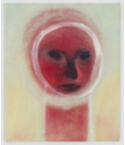
Miriam Cahn o.t. , 2006 Oil on Linen 18 1/8 x 15 inches 46 x 38 cm (EDG6835)