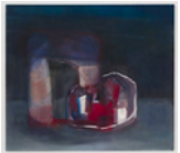
Miriam Cahn VERARBEITUNG , 1975/2004 Oil on Linen 25 5/8 x 29 1/8 inches 65 x 74 cm (EDG6899)