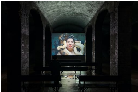
Seven Deaths Cisternerne, Frederiksborgmuseerne, Frederiksborg, Denmark Solo exhibition, through November 30, 2026