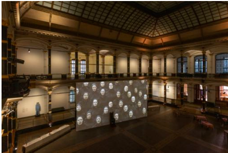
Balkan Erotic Epic. The Exhibition Gropius Bau, Berliner Festspiele, Berlin, Germany Solo exhibition, through August 23, 2026