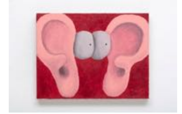
FELIPE BARSUGLIA Talk Less Red, 2025

Oil on linen 11 3/8 x 13 3/4 inches (29 x 35 cm.) (FBA26-002)