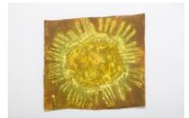
FLORA REBOLLO The Secret of the World , 2026

Oil on canvas 16 1/8 x 8 1/4 inches (41 x 21 cm.) (AG26-007)