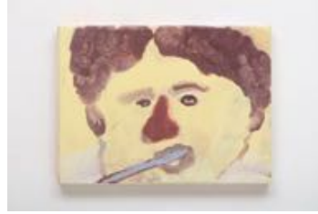
ALLAN GANDHI Brushing Teeth , 2025

Oil and oil sticks on linen 13 3/4 x 17 3/4 inches (35 x 45 cm.) (AG26-006)