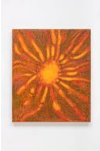
FLORA REBOLLO Crunchy, 2026

Oil paint and oil stick and dry pastel on linen 19 3/4 x 16 1/2 x 1 5/8 inches (50 x 42 x 4 cm.) (FR26-010)