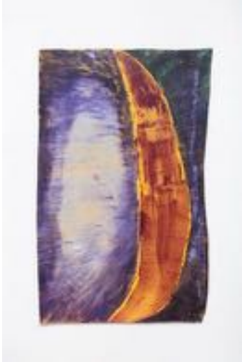
FLORA REBOLLO Echo , 2026

Oil paint and oil stick on canvas 26 3/8 x 16 1/2 inches (67 x 42 cm.) (FR26-003)