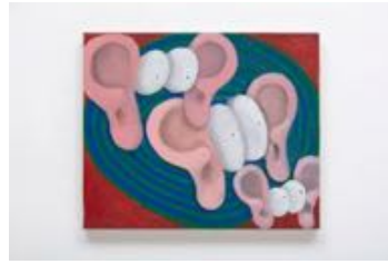
FELIPE BARSUGLIA Talk Less Animaniacs, 2025

Oil on linen 9 x 11 inches (23 x 28 cm.) (FBA26-006)