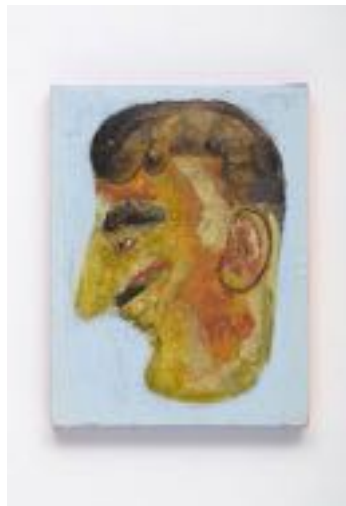
ALLAN GANDHI Floating Head , 2025

Oil paint on canvas 12 1/4 x 13 3/8 x 1 1/8 inches (31 x 34 x 3 cm.) (FR26-009)