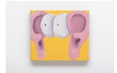
FELIPE BARSUGLIA Talk Less Yellow, 2025

Oil on linen 7 1/2 x 9 1/2 inches (19 x 24 cm.) (FBA26-004)