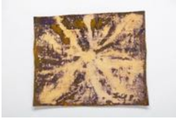
FLORA REBOLLO Norma , 2026

Oil paint on canvas 16 7/8 x 20 7/8 inches (43 x 53 cm.) (FR26-005)