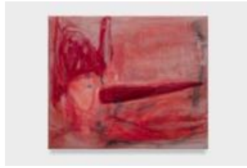
LUCIANA MAAS Deitado , 2026

Oil paint on bronze 16 1/4 x 16 1/4 x 2 1/4 inches (41.3 x 41.3 x 5.7 cm.) Edition of 3 plus 2 artist's proofs (EV22-011)