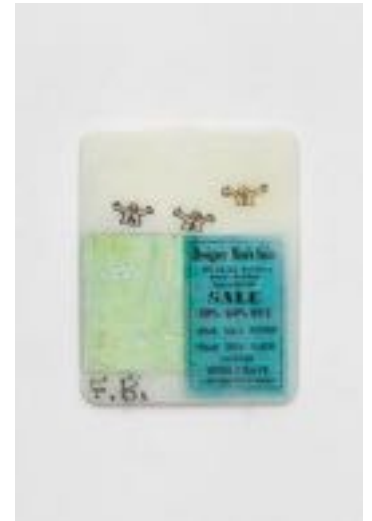
FELIPE BARSUGLIA Abs , 2025

Epoxy resin, oil paint, paper, acrylic, sticker, and hair 11 3/8 x 15 inches (29 x 38 cm.) (FBA26-010)