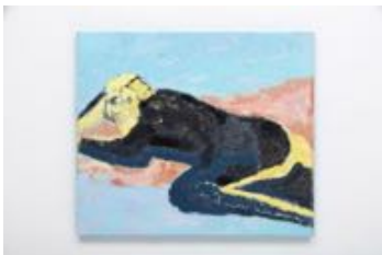
ALLAN GANDHI Beach House, 2025

Oil on wood panel and cold porcelain 83 1/2 x 29 1/2 x 12 5/8 inches (212 x 75 x 32 cm.) overall dimensions (GS26-004)