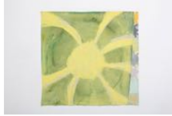
FLORA REBOLLO Mother's Milk, 2026

Oil paint and oil stick on canvas 40 1/2 x 42 1/8 inches (103 x 107 cm.) (FR26-001)