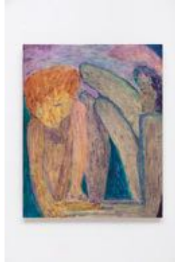
GOKULA STOFFEL Tent , 2025

Oil on canvas 11 3/4 x 15 3/4 inches (30 x 40 cm.) (AG26-004)