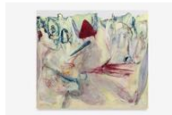
LUCIANA MAAS Cukoo Donkey, 2026

Oil paint on canvas 10 1/4 x 11 3/4 inches (26 x 30 cm.) (FR26-002)