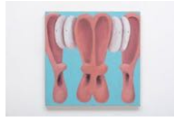
FELIPE BARSUGLIA Talk Less Tiffany, 2025

Oil on linen 11 3/8 x 13 3/4 inches (29 x 35 cm.) (FBA26-003)