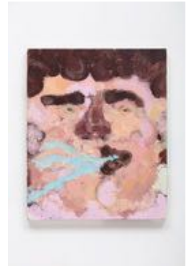
ALLAN GANDHI Pink Man Spitting Blue , 2026

Oil on linen 18 7/8 x 15 inches (48 x 38 cm.) (AG26-009)