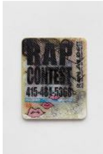
FELIPE BARSUGLIA Ronaldo , 2025

Oil paint on bronze 13 3/4 x 15 3/4 x 2 3/8 inches (35 x 40 x 6 cm.) Edition of 3 plus 2 artist's proofs (EV22-008)