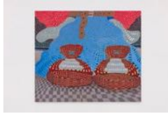
FELIPE BARSUGLIA Empty Pocket , 2024

Oil on linen 62 1/4 x 74 3/4 inches (158 x 190 cm.) (GS26-001)