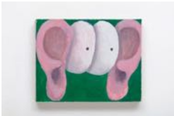
FELIPE BARSUGLIA Talks Less Green, 2025

Oil on linen 11 3/4 x 15 3/4 inches (30 x 40 cm.) (FBA26-009)