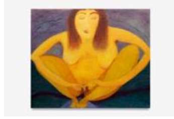
GOKULA STOFFEL Luau , 2026

Oil paint on canvas 16 7/8 x 20 7/8 inches (43 x 53 cm.) (FR26-005)