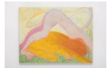
GOKULA STOFFEL Eclipse, 2026

Oil on canvas 59 7/8 x 67 3/4 inches (152 x 172 cm.) (LUM26-001)