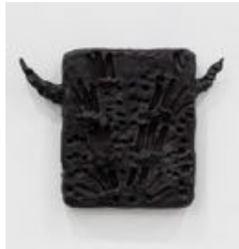
ERIKA VERZUTTI Demon, 2018

Oil on linen 7 7/8 x 9 7/8 inches (20 x 25 cm.) (FBA26-008)