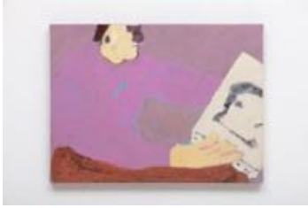
ALLAN GANDHI The Mastermind , 2025

Oil and oil sticks on linen 13 3/4 x 17 3/4 inches (35 x 45 cm.) (AG26-006)