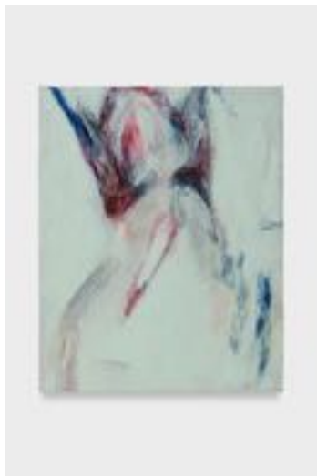
LUCIANA MAAS Sis , 2026

Oil on canvas 19 3/4 x 15 3/4 inches (50 x 40 cm.) (LUM26-006)