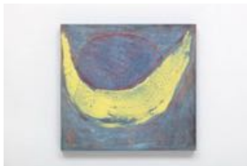
FLORA REBOLLO Juntinho (lap) , 2026

Oil on canvas 19 3/4 x 15 3/4 inches (50 x 40 cm.) (LUM26-007)