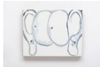
FELIPE BARSUGLIA Talk Less Simple, 2025

Bronze and oil 20 7/8 x 16 3/4 x 4 inches (53 x 42.5 x 10 cm) Edition of 3 (EV19-001)