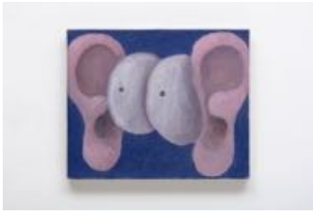
FELIPE BARSUGLIA Talk Less Blue, 2025

Oil on linen 9 x 11 inches (23 x 28 cm.) (FBA26-006)