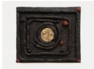
ERIKA VERZUTTI Picasso Labirinto , 2022

Oil on canvas 59 7/8 x 67 3/4 inches (152 x 172 cm.) (LUM26-002)