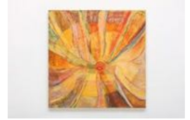
FLORA REBOLLO Fried , 2026

Acrylic and oil on linen mounted on wood panel 19 3/4 x 15 3/4 inches (50 x 40 cm.) (GS26-003)