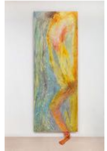
GOKULA STOFFEL Morning Glory, 2025

Oil on linen 13 3/4 x 13 3/4 inches (35 x 35 cm.) (FBA26-007)