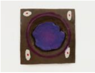
ERIKA VERZUTTI Tantra Roxo (Purple Tantra) , 2022

Oil paint on bronze 16 1/4 x 16 1/4 x 2 1/4 inches (41.3 x 41.3 x 5.7 cm.) Edition of 3 plus 2 artist's proofs (EV22-011)