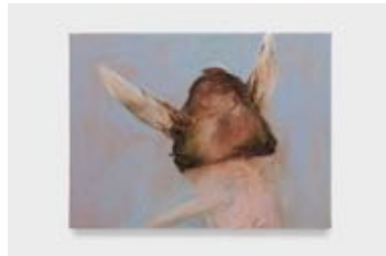
LUCIANA MAAS Capim , 2026

Oil on canvas 15 3/4 x 19 3/4 inches (40 x 50 cm.) (LUM26-003)