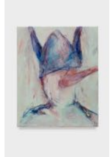
LUCIANA MAAS Bro , 2026

Oil on canvas 56 1/4 x 65 3/8 inches (143 x 166 cm.) (FBA26-012)