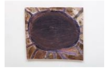
FLORA REBOLLO A body surrounded by vapors , 2026

Oil on canvas 23 5/8 x 19 3/4 inches (60 x 50 cm.) (LUM26-011)