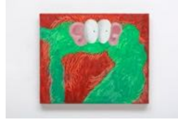
FELIPE BARSUGLIA Talk Less Muscle, 2025

Oil on linen 11 3/8 x 13 3/4 inches (29 x 35 cm.) (FBA26-002)