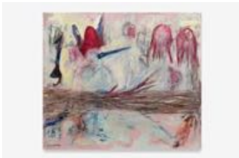
LUCIANA MAAS Trunk Donkey , 2026

Oil paint, oil stick and dry pastel on canvas 31 1/2 x 31 1/2 x 1 5/8 inches (80 x 80 x 4 cm.) (FR26-011)