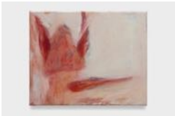
LUCIANA MAAS Carrot , 2026

Oil paint on canvas mounted on a wooden panel 14 5/8 x 16 1/8 x 3/4 inches (37 x 41 x 2 cm.) (FR26-008)