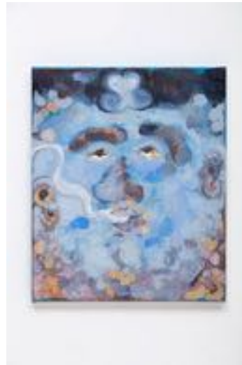
ALLAN GANDHI Slow Burn , 2026

Oil on canvas 11 3/4 x 15 3/4 inches (30 x 40 cm.) (LUM26-008)