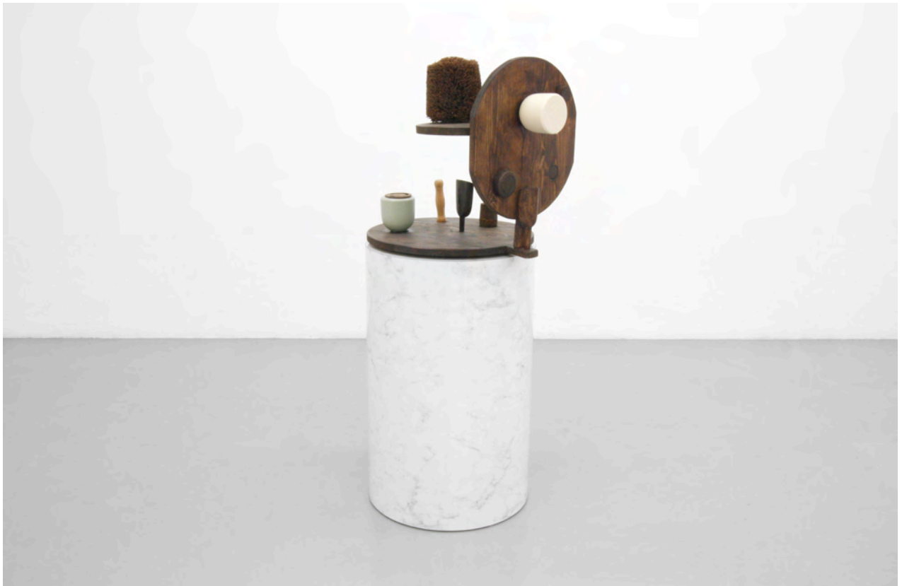
Neglected All Theoretical Aspects Considerably, 2012 133 x 64 x 50 cm varnish, lacquer and wood