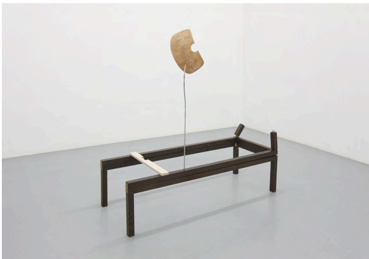
Dimension of the Segments , 2011 162 x 60 x 162 cm wood, metal