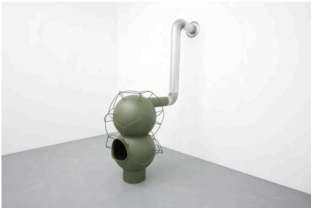
Thought Apart From Concrete Realities , 2010 80 x 80 x 130 cm silicone painted metal, stainless steel