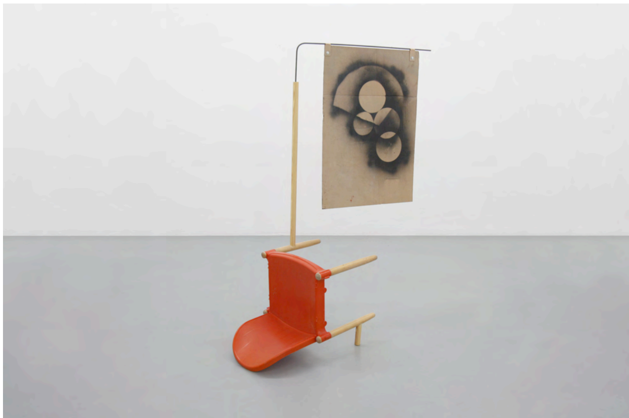
Simply a Logical Consequence , 2011 183 x 101 x 86 cm plastic, wood, metal, cardboard, spray paint