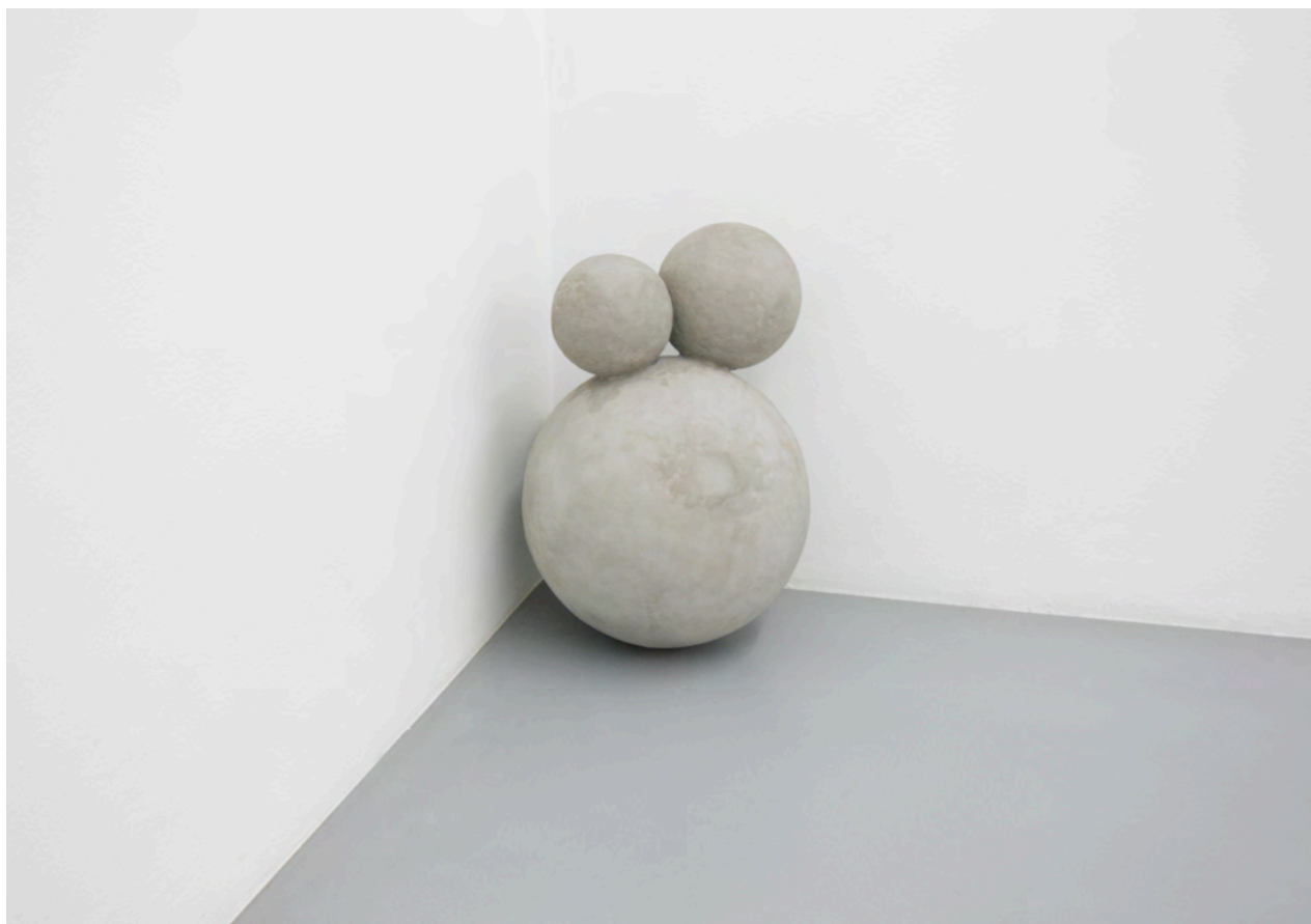
A Point in Space is a Place , 2011 70 x 55 x 60 cm painted plaster, styrofoam