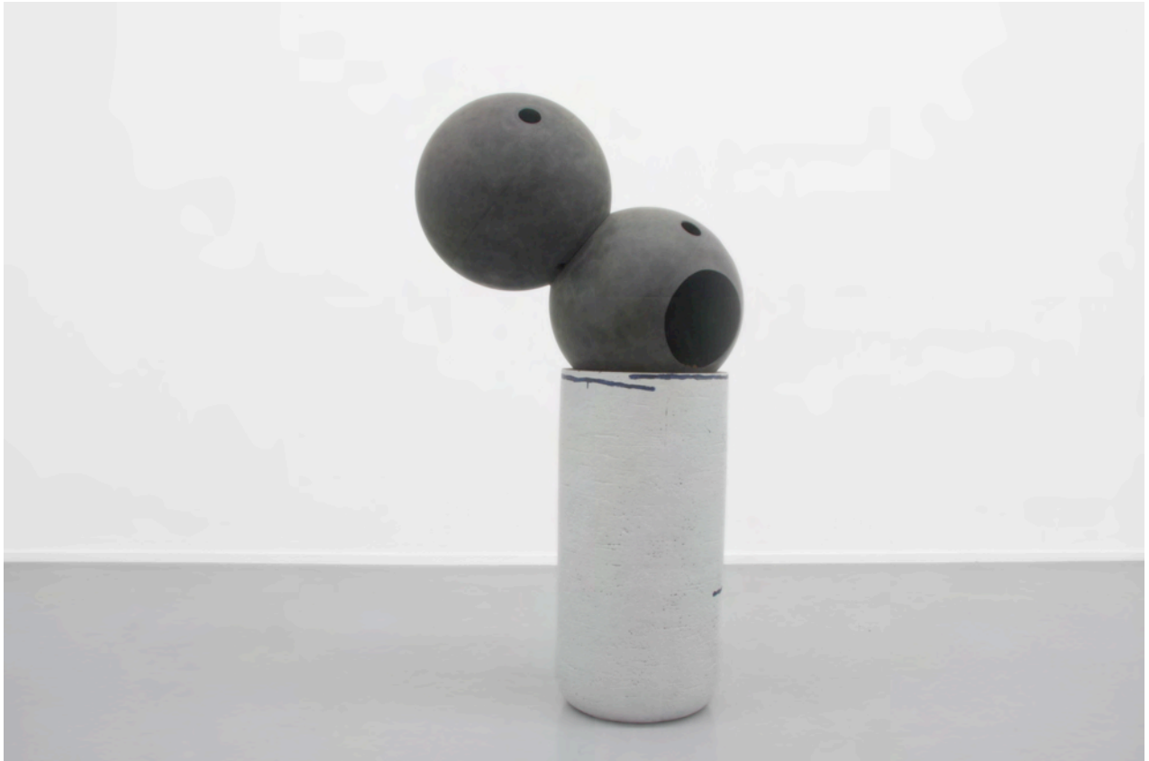
Old Sacrosand Academic, 2013 130 x 35 cm x 60 cm plastic, enamel, almonds, pistachios