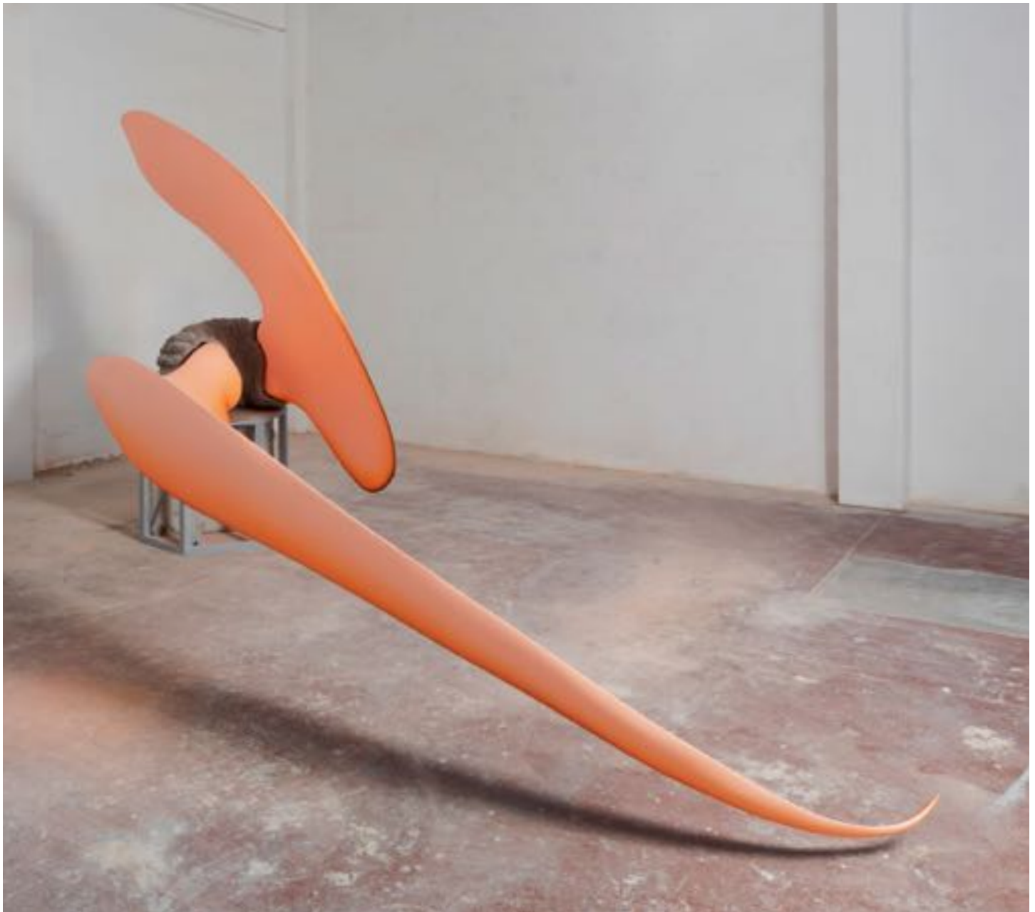
Teresa Solar Abboud, Tunnel Boring Machine , 2023

Opening reception with artist: March 5, 6:00-8:00pm