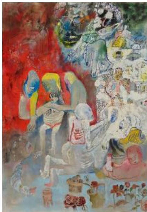
Qiu Xiaofei, 'The Ecstasy of Blood and the Cosmos,' 2025