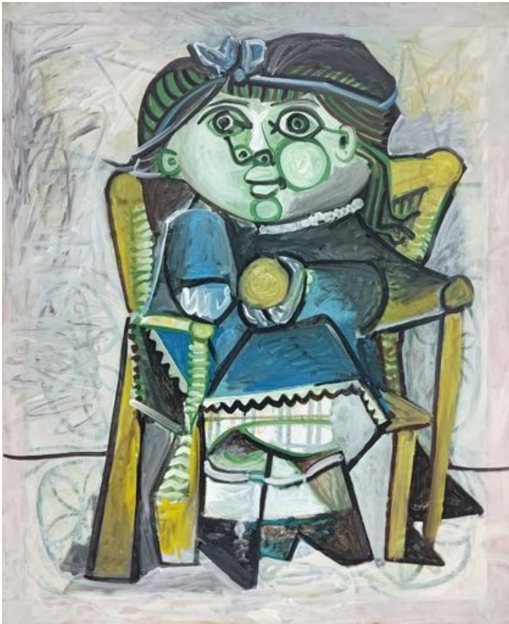
Pablo Picasso, 'L'enfant à l'orange (Child with an Orange),' 1951

Hauser & Wirth's booth at Art Basel Miami Beach presents a multigenerational, transhistorical array of works that embody the imagination and expressive genius of modern and contemporary masters both within the gallery's program and beyond.