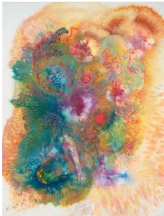
Firelei Báez, 'Let Love Be Your Guide,' 2025