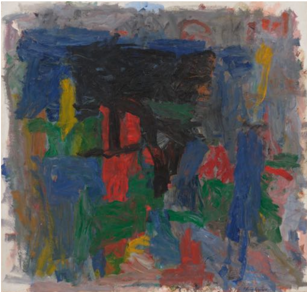
Philip Guston, 'Grove I,' 1959

An urgently physical masterpiece from the pivotal decade of Guston's career when his struggle to reconcile gestural and field painting with figuration and abstraction, coalesced into what would become a new language of art.