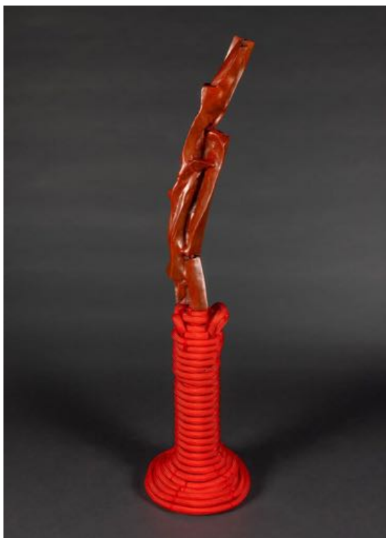
Barbara Chase-Riboud, 'La Musica Amnesia Red,' 2024