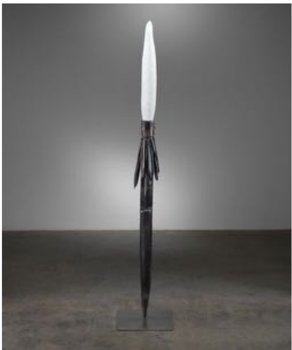
Louise Bourgeois, 'Persistent Antagonism,' 1946 –1948