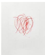
Katharina Hinsberg Gitter/Linien 2013 crayon on paper, Papercut 52 x 42 cm | 20 1/2 x 16 1/2 in