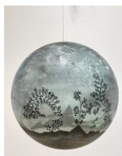
Katja Davar A Rare Place To Perch 2024 Oil-based colored pencils, Pitt Graphite Matt pencil, and watercolors on gesso on a fiberglass sphere Ø 60 cm | Ø 23 5/8 in