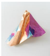
Myriam Holme Marsfund 2025 ink, lacquer, impact metal on Aluminium 140 x 160 x 42 cm | 55 1/8 x 63 x 16 1/2 in