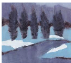
Robert Zandvliet Untitled 2024 Egg tempera on linen 63 x 72 cm | 24 3/4 x 28 3/8 in