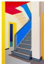
Daniel Rich Meisterhaus Klee, Dessau 2025 Acrylic on Dibond 152 x 101 cm | 59 7/8 x 39 3/4 in