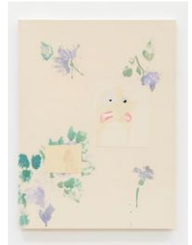
SOFIA SILVA Come stanno i miei segreti sottoterra (My Secrets Beneath the Ground) , 2025

Oil, acrylic, colored pencil and pH neutral PVA on canvas 43 1/4 x 31 1/2 inches (110 x 80 cm.) (SOS25-004)