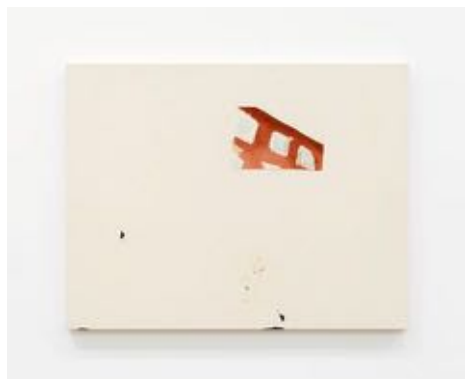
SOFIA SILVA My Father by the Shore of the Adriatic Sea, 2025

Acrylic, colored pencil and pH neutral PVA on canvas 31 1/2 x 39 3/8 inches (80 x 100 cm.) (SOS25-007)