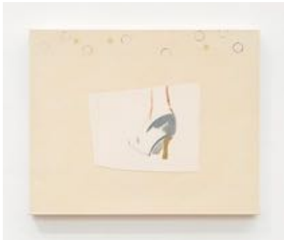
SOFIA SILVA To be Dora, Once , 2025

Acrylic, pencil and pH neutral PVA on canvas 23 5/8 x 29 1/2 inches (60 x 75 cm.) (SOS25-002)