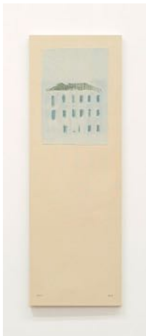
SOFIA SILVA Disegno d'infanzia, 2025

Acrylic, oil, watercolor and pH neutral PVA on canvas 17 3/4 x 13 3/4 inches (45 x 35 cm.) (SOS25-008)