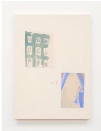
SOFIA SILVA Cocca , 2025

Acrylic, pencil and pH neutral PVA on canvas 23 5/8 x 29 1/2 inches (60 x 75 cm.) (SOS25-002)