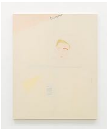
SOFIA SILVA Commentario Italiano Featur- ing a Portrait of Aligi Sassu,, 2025

Acrylic, colored pencil and pH neutral PVA on canvas 31 1/2 x 39 3/8 inches (80 x 100 cm.) (SOS25-007)