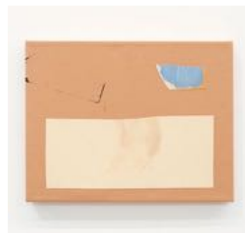
SOFIA SILVA Il corridoio, 2025

Oil, acrylic, enamel, colored pencil and pH neutral PVA on canvas 60 1/4 x 50 inches (153 x 127 cm.) (SOS25-001)