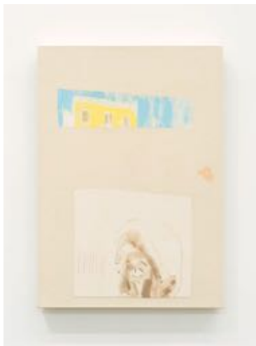
SOFIA SILVA Il cantiere , 2025

Acrylic, colored pencil and pH neutral PVA on canvas 57 1/8 x 43 1/4 inches (145 x 110 cm.) (SOS25-009)