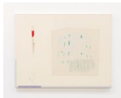
SOFIA SILVA Strada statale della Riviera del Brenta, 2025

Acrylic, gesso, colored pencil and pH neutral PVA on canvas 57 1/8 x 23 5/8 inches (145 x 60 cm.) (SOS25-006)