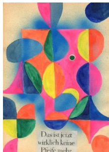
Myriam Holme 02/2024 „Das ist jetzt wirklich keine Pfeife mehr“ Collage on paper 29,7 x 21 cm | 11 3/4 x 8 1/4 in