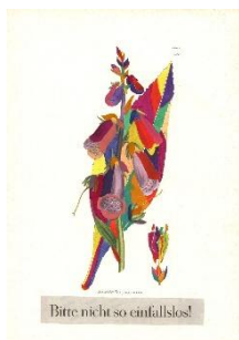
Myriam Holme 32/2022 „Bitte nicht so einfallslos!“ Collage on paper 29,7 x 21 cm | 11 3/4 x 8 1/4 in