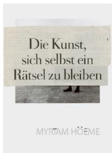
Myriam Holme 10/2022 „Die Kunst, sich selbst ein Rätsel zu bleiben“ Collage on paper 42 x 29,5 cm | 16 1/2 x 11 5/8 in