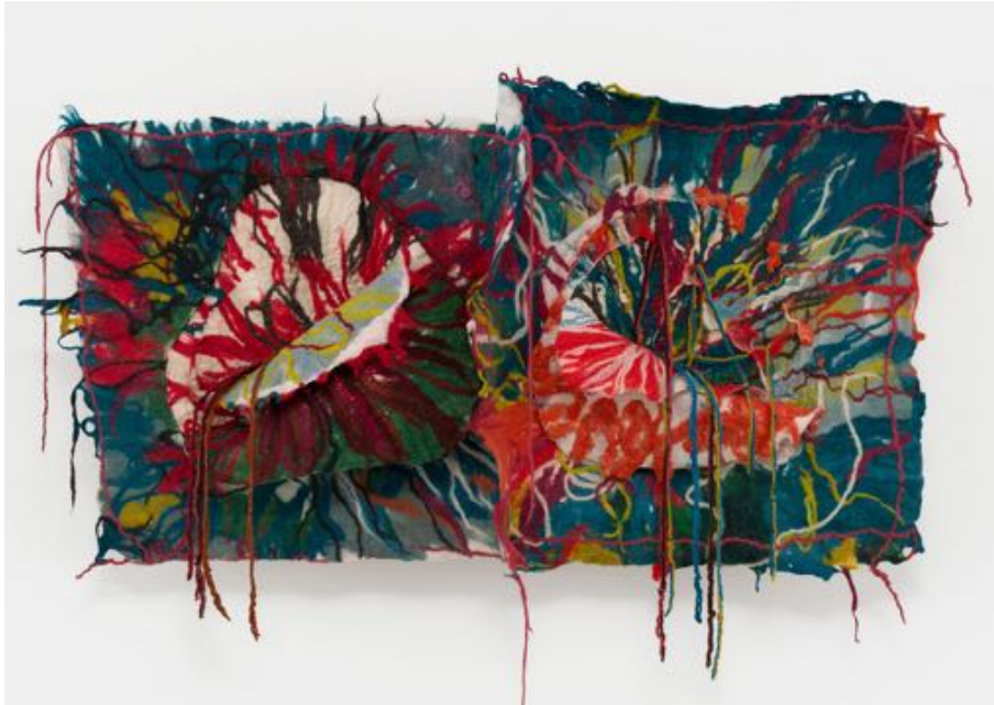
Sagarika Sundaram, Mirror , 2025

Alison Jacques presents 'Release', the first UK exhibition of Sagarika Sundaram (b.1986, Kolkata, India; lives and works in New York). Working primarily with raw natural fibres, Sundaram's practice of 'painterly sculpture' or 'textile painting' defies material, spatial, and linguistic boundaries. This exhibition anticipates Sundaram's forthcoming solo show, curated by Laurence Sillars, at the Henry Moore Institute, Leeds, in 2026.