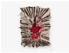
Star , 2025 Hand-dyed wool 158 x 113 cm (62 ¼ x 44 ½ in) (AJG-SAS-00042)