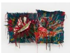
Mirror, 2025 Hand-dyed wool 94 x 154 cm (37 x 60 5 / 8 in) (AJG-SAS-00049)