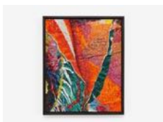
In and Within, 2025 Italian glass mosaic Framed: 98 x 80.5 cm (38 5 / 8 x 31 3 / 4 in) (AJG-SAS-00035)