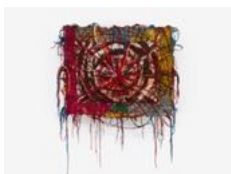
Veil, 2025 Hand-dyed wool 101.5 x 122 cm (40 x 48 in) (AJG-SAS-00045)