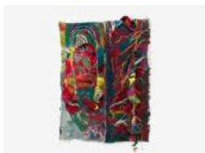
Undercurrent, 2025 Hand-dyed wool, bamboo viscose 223 x 172 cm (87 3 / 4 x 67 3 / 4 in) (AJG-SAS-00041)