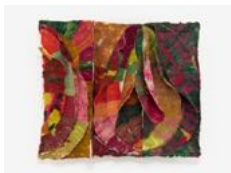
Rose , 2025 Hand-dyed wool, bamboo viscose 167 x 203 cm (65 ¾ x 79 ⅞ in) (AJG-SAS-00038)