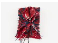
Tigress, 2025 Hand-dyed wool 64 x 44 cm (25 1 / 4 x 17 3 / 8 in) (AJG-SAS-00047)