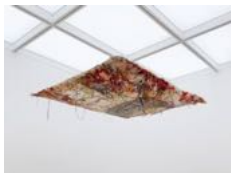
Point of View , 2024 Hand-dyed wool 269 x 348 cm (106 x 137 in) (AJG-SAS-00004)