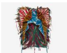
Release, 2025 Hand-dyed wool 132 x 106 cm (52 x 41 3 / 4 in) (AJG-SAS-00046)