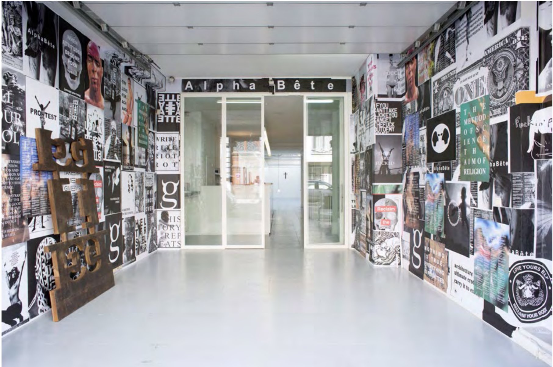
Kendell Geers, AlphaBête , exhibition view @ Galerie Rodolphe Janssen, Brussels