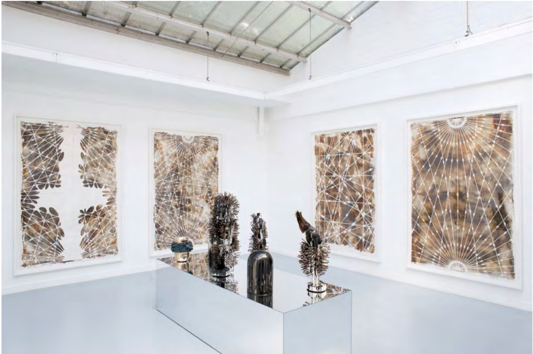
Kendell Geers, AlphaBête , exhibition view @ Galerie Rodolphe Janssen, Brussels