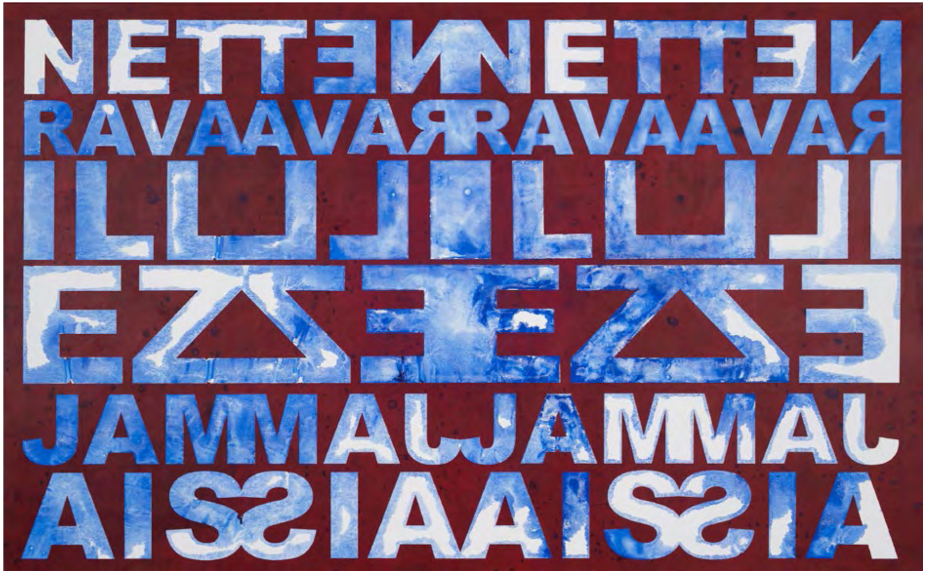
The Devils Verse XVI, 2013 Acrylic on canvas 133.2 x 213.2 cm 52 1/2 x 84 in