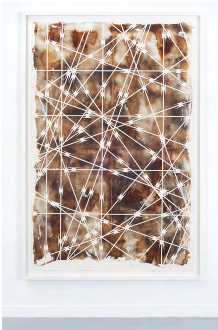
Age of Iron L , 2012 Signed by the artist Rust on paper 217,5 x 145 cm (framed) 85 3/8 x 57 1/8 in 200 x 130 cm (unframed) 78 3/4 x 51 1/8 in