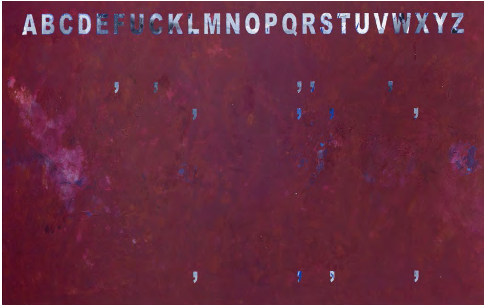
Immaginando Tutto IX , 2013 Acrylic on canvas 72.5 x 157.5 cm 28 1/2 x 62 1/8 in