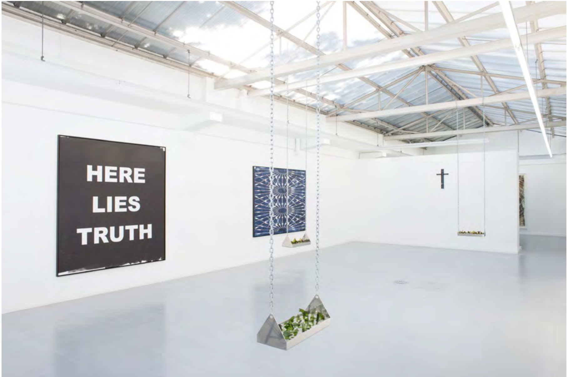
Kendell Geers, AlphaBête , exhibition view @ Galerie Rodolphe Janssen, Brussels