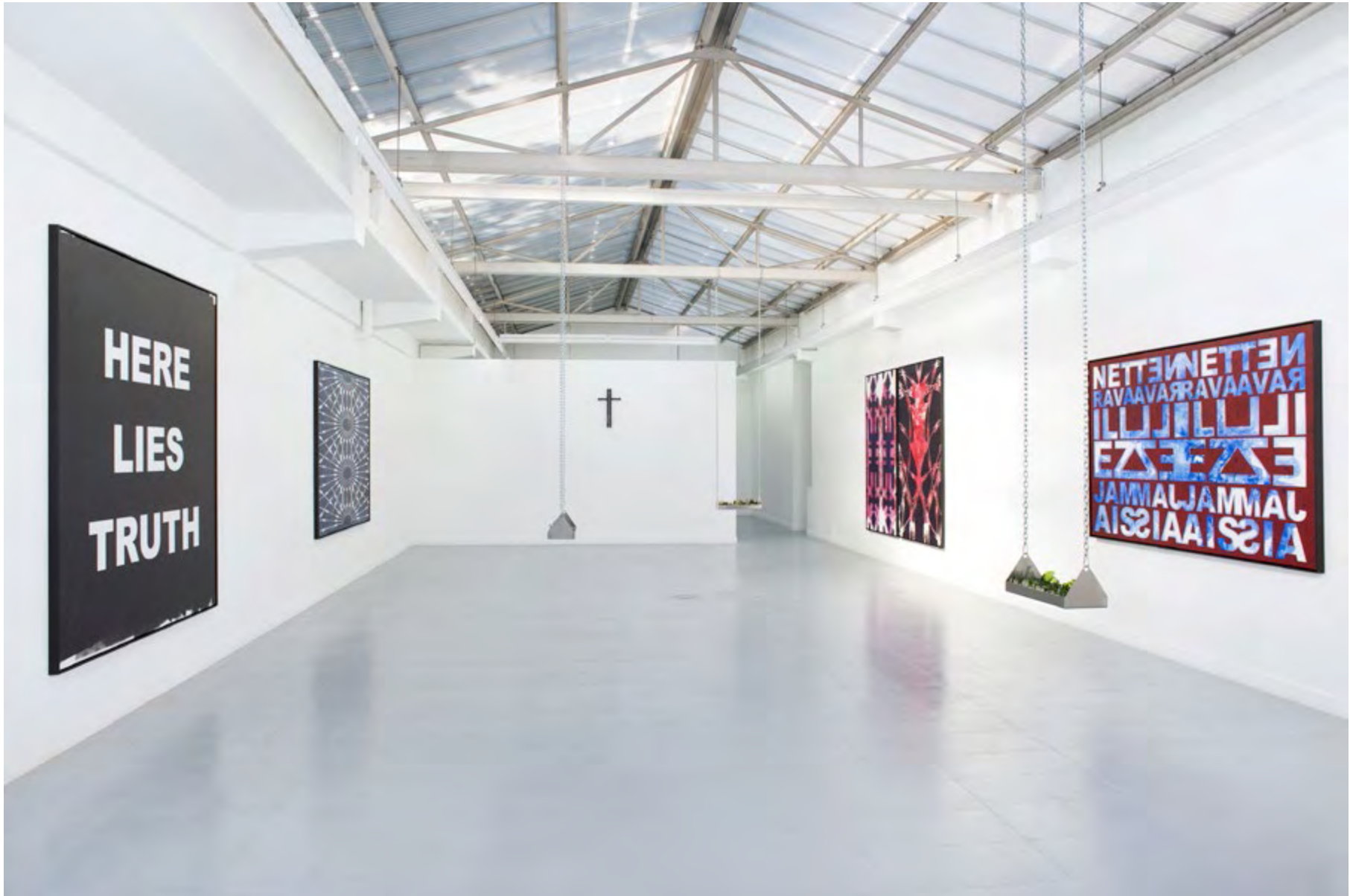
Kendell Geers, AlphaBête , exhibition view @ Galerie Rodolphe Janssen, Brussels