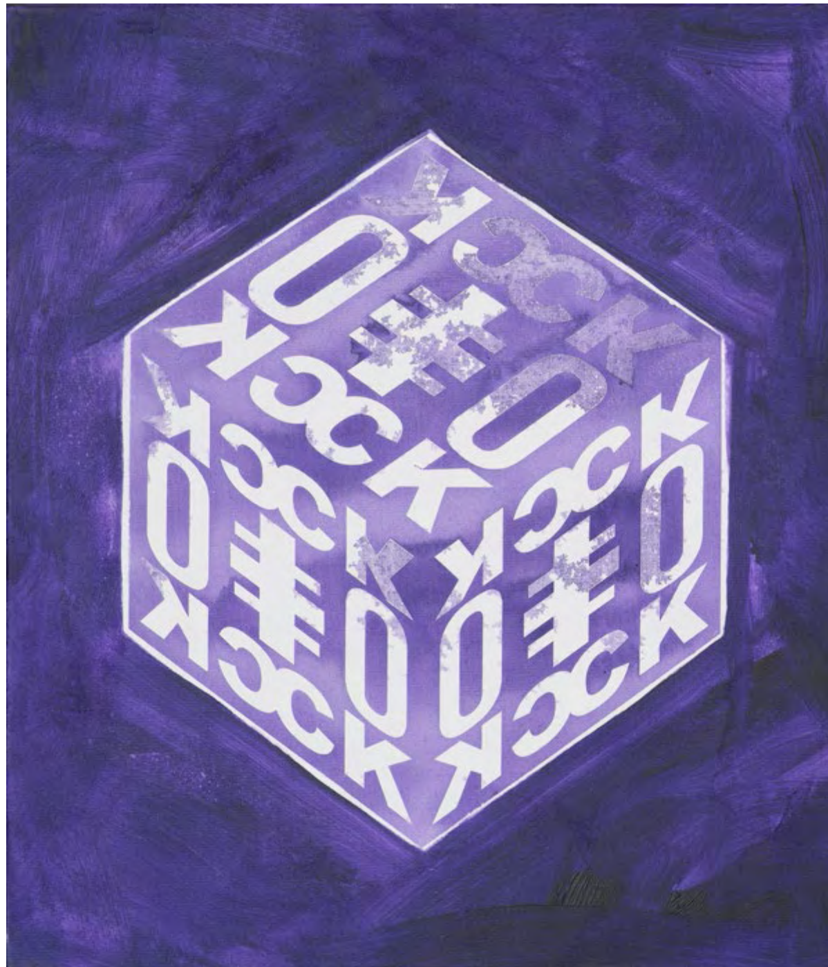
PostPopPanegyrik 135, 2013 Acrylic on canvas 72.6 x 62.6 cm 28 5/8 x 24 5/8 in