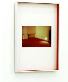
Dominique Gonzalez-Foerster RGB (Print) R 139, 2013 Digital pigment print on archival paper, custom made frames 47,5 x 32 x 4 cm Unique (DGF 226)