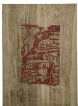
Liam Gillick Pourquoi Travailler? 7/15, 2012 Wooden Board 59 x 39,5 cm edition of 4 (LG 600)