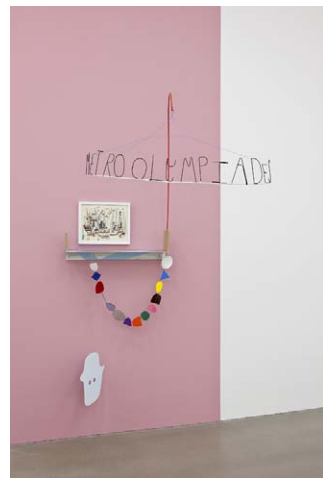
Nathan Carter Metro Olympiades (Light Blue Shelf) , 2013 Aluminum, steel, wood, enamel paint, wire and plastic 63,5 x 15,5 x 101 cm Unique (NC 096)