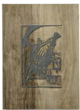
Liam Gillick Pourquoi Travailler? 6/15, 2012 Wooden Board 59 x 39,5 cm edition of 4 (LG 599)