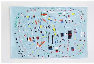
Nathan Carter Brooklyn Street Treasures All City All Lines And All Scheduled Bus Routes , 2012 Paint, paper 116,84 x 175,26 cm (NC 091)