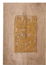
Liam Gillick Pourquoi Travailler? 1/15 , 2012 Wooden Board 59 x 39,5 cm edition of 4 (LG 594)