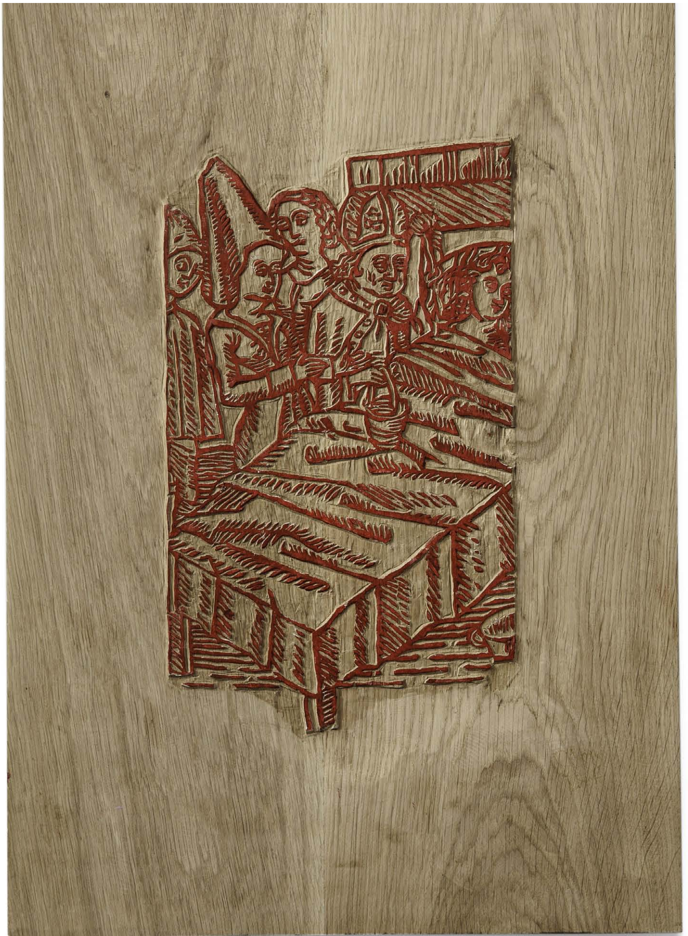
Liam Gillick Pourquoi Travailler? 4/15, 2012 Wooden Board 59 x 39,5 cm edition of 4 (LG 597)