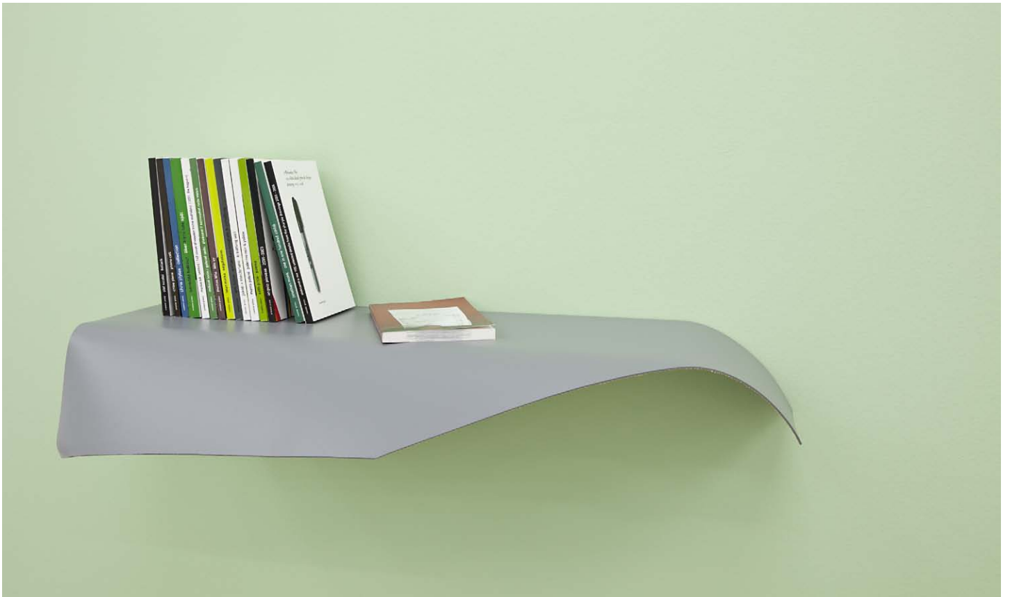
Gabriel Kuri Soft Wave Bookshelf (Grey 2) , 2012 Plywood, linoleum, and steel Shelf surface: 80 x 25 cm Unique (GK 094)