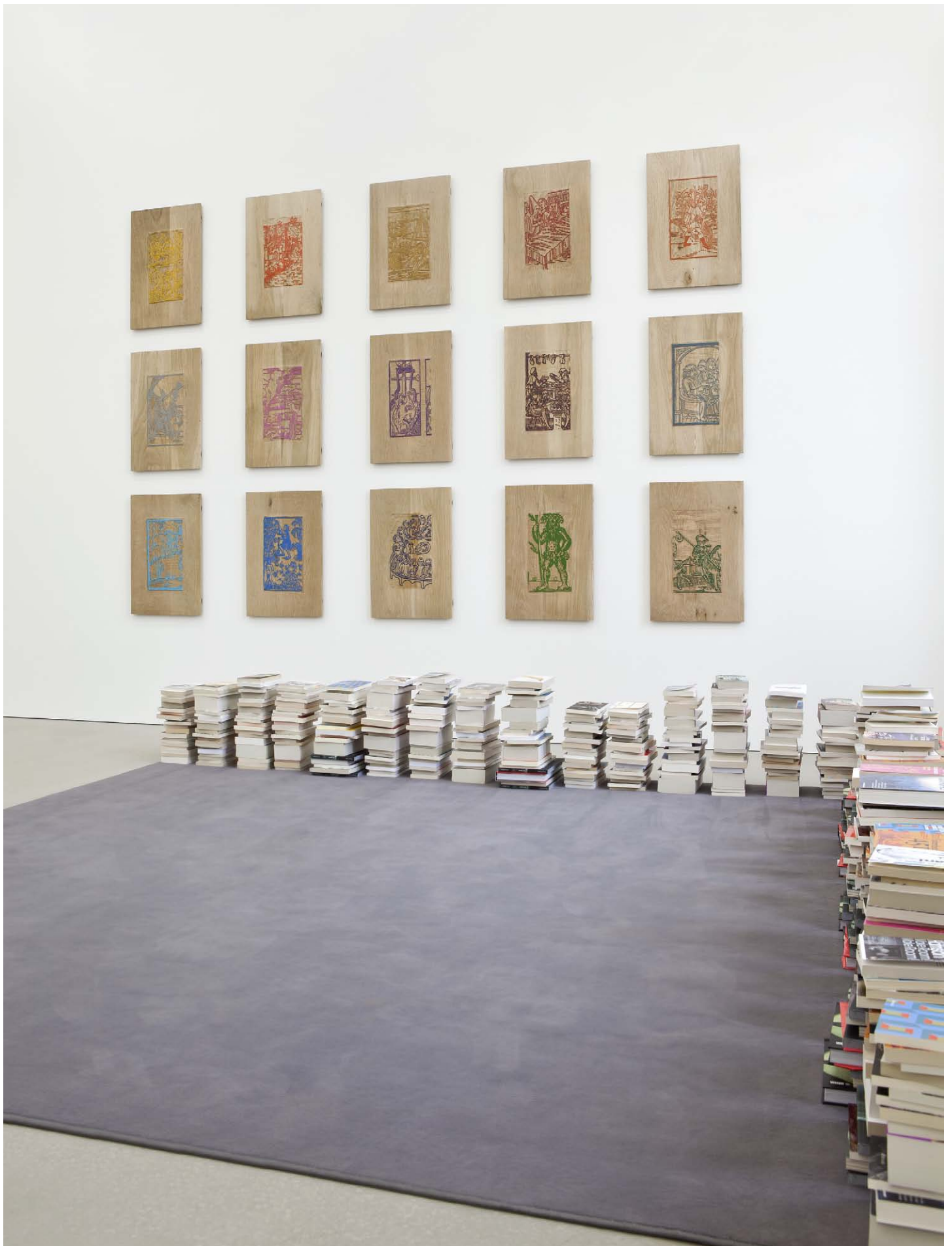
Liam Gillick Pourquoi Travailler? , 2012 Wooden Board 59 x 39,5 cm edition of 4 #1/4 (LG 594-608 )