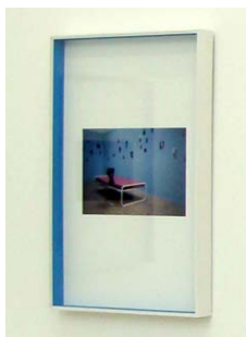
Dominique Gonzalez-Foerster RGB (Print) B 169, 2013 Digital pigment print on archival paper, custom made frames 47,5 x 32 x 4 cm (DGF 227)