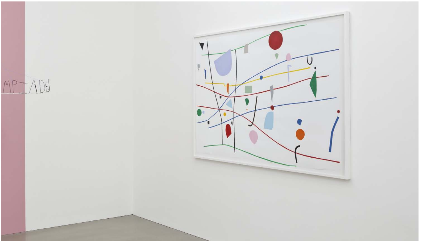
Nathan Carter Brooklyn Street Treasures DeKalb Avenue On The D Train To Coney Island Vacation, 2012 Acrylic paint, paper 121,92 x 180,34 cm Unique (NC 092)