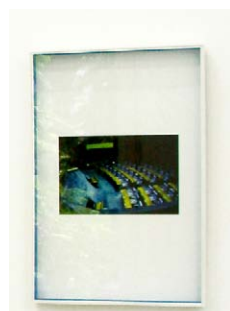
Dominique Gonzalez-Foerster RGB (Print) B 272, 2013 Digital pigment print on archival paper, custom made frames 47,5 x 32 x 4 cm Unique (DGF 225)