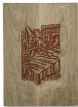
Liam Gillick Pourquoi Travailler? 4/15, 2012 Wooden Board 59 x 39,5 cm edition of 4 (LG 597)