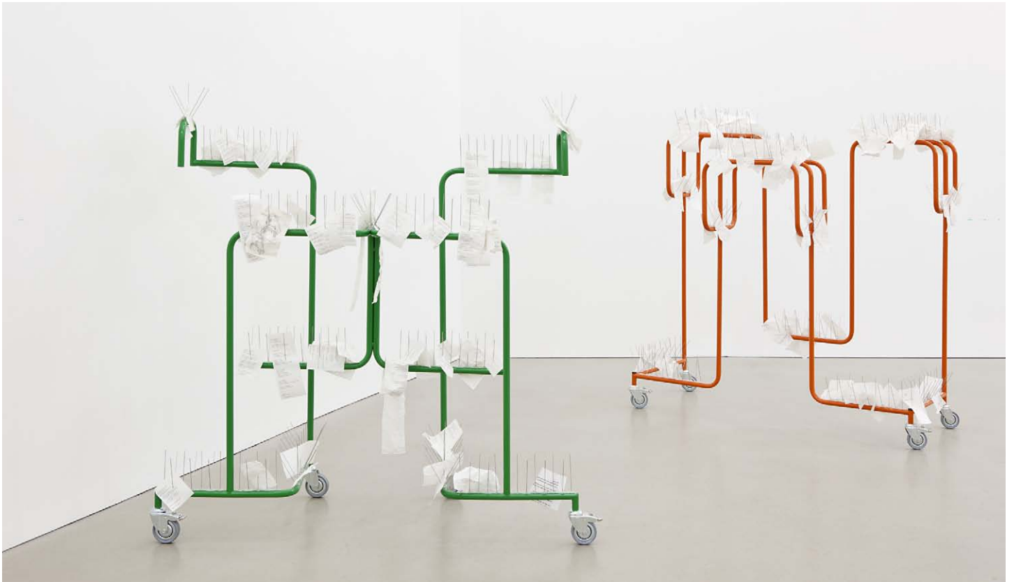
Gabriel Kuri Element A.1, A.2 ; 2012 Element A.1, A.2: Powder coated metal pipe structure w/ wheels, Pigeon spikes, receipts; Element A.1, A.2: 120 x 60 x 110 cm; (GK 082)