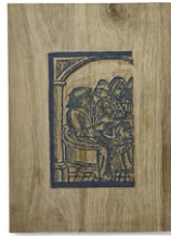
Liam Gillick Pourquoi Travailler? 10/15, 2012 Wooden Board 59 x 39,5 cm edition of 4 (LG 603)