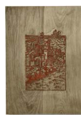
Liam Gillick Pourquoi Travailler? 2/15 , 2012 Wooden Board 59 x 39,5 cm edition of 4 (LG 595)