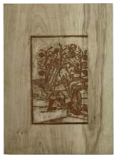
Liam Gillick Pourquoi Travailler? 5/15, 2012 Wooden Board 59 x 39,5 cm edition of 4 (LG 598)