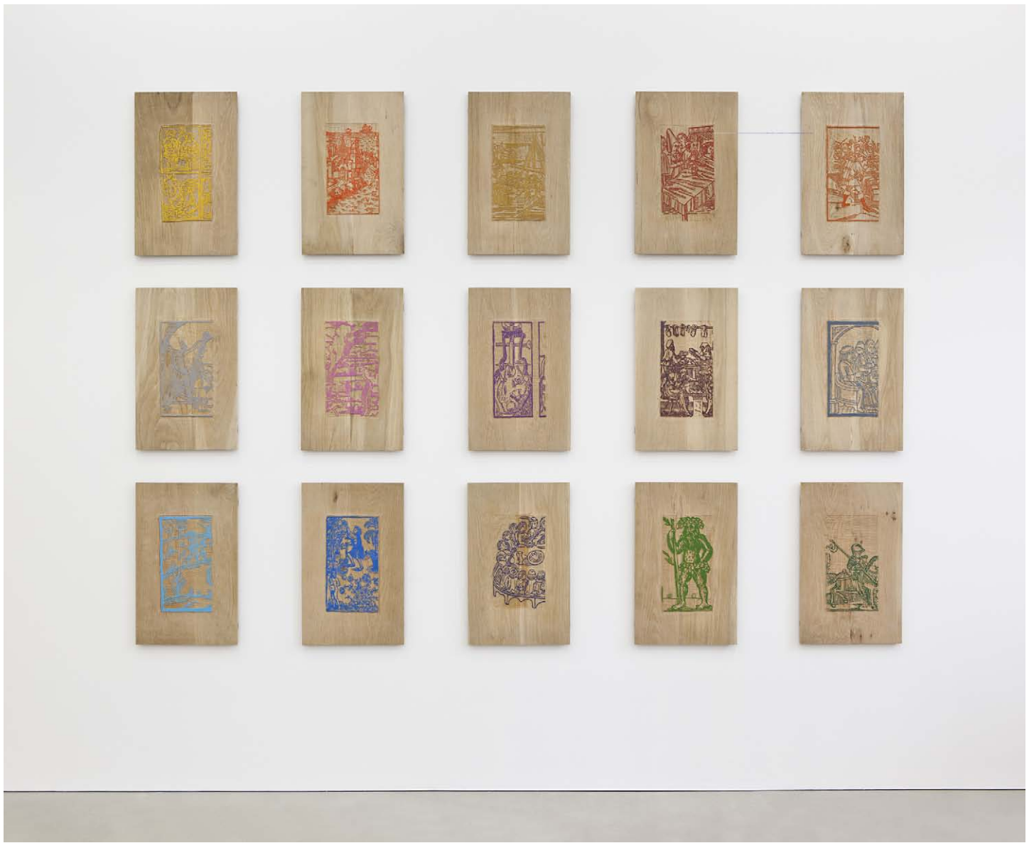
Liam Gillick Pourquoi Travailler? , 2012 Wooden Board 59 x 39,5 cm edition of 4 #1/4 (LG 594-608 )