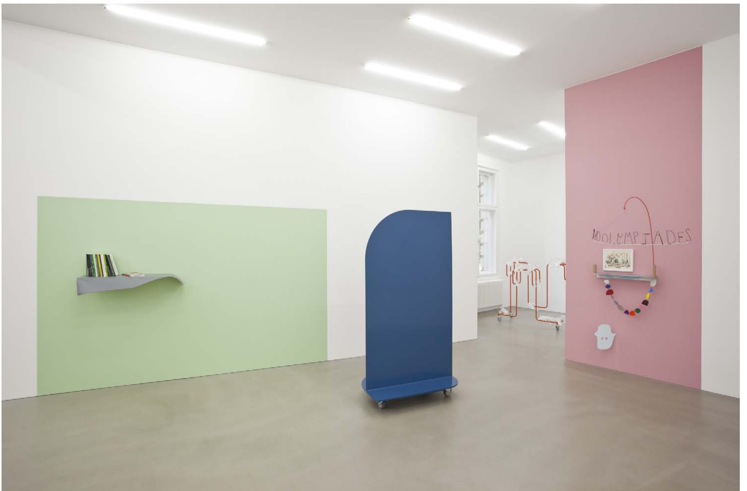
Sommeraustellung, installation view, 2013