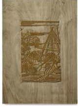
Liam Gillick Pourquoi Travailler? 3/15, 2012 Wooden Board 59 x 39,5 cm edition of 4 (LG 596)