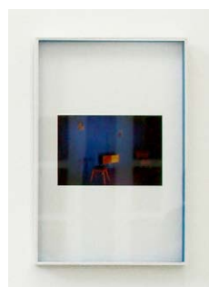
Dominique Gonzalez-Foerster RGB (Print) B 340, 2013 Digital pigment print on archival paper, custom made frames 47,5 x 32 x 4 cm Unique (DGF 224)