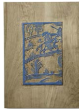
Liam Gillick Pourquoi Travailler? 11/15, 2012 Wooden Board 59 x 39,5 cm edition of 4 (LG 604)