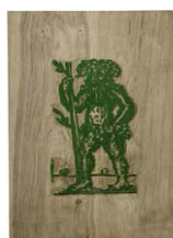
Liam Gillick Pourquoi Travailler? 14/15, 2012 Wooden Board 59 x 39,5 cm edition of 4 (LG 607)