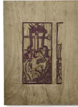
Liam Gillick Pourquoi Travailler? 8/15, 2012 Wooden Board 59 x 39,5 cm edition of 4 (LG 601)