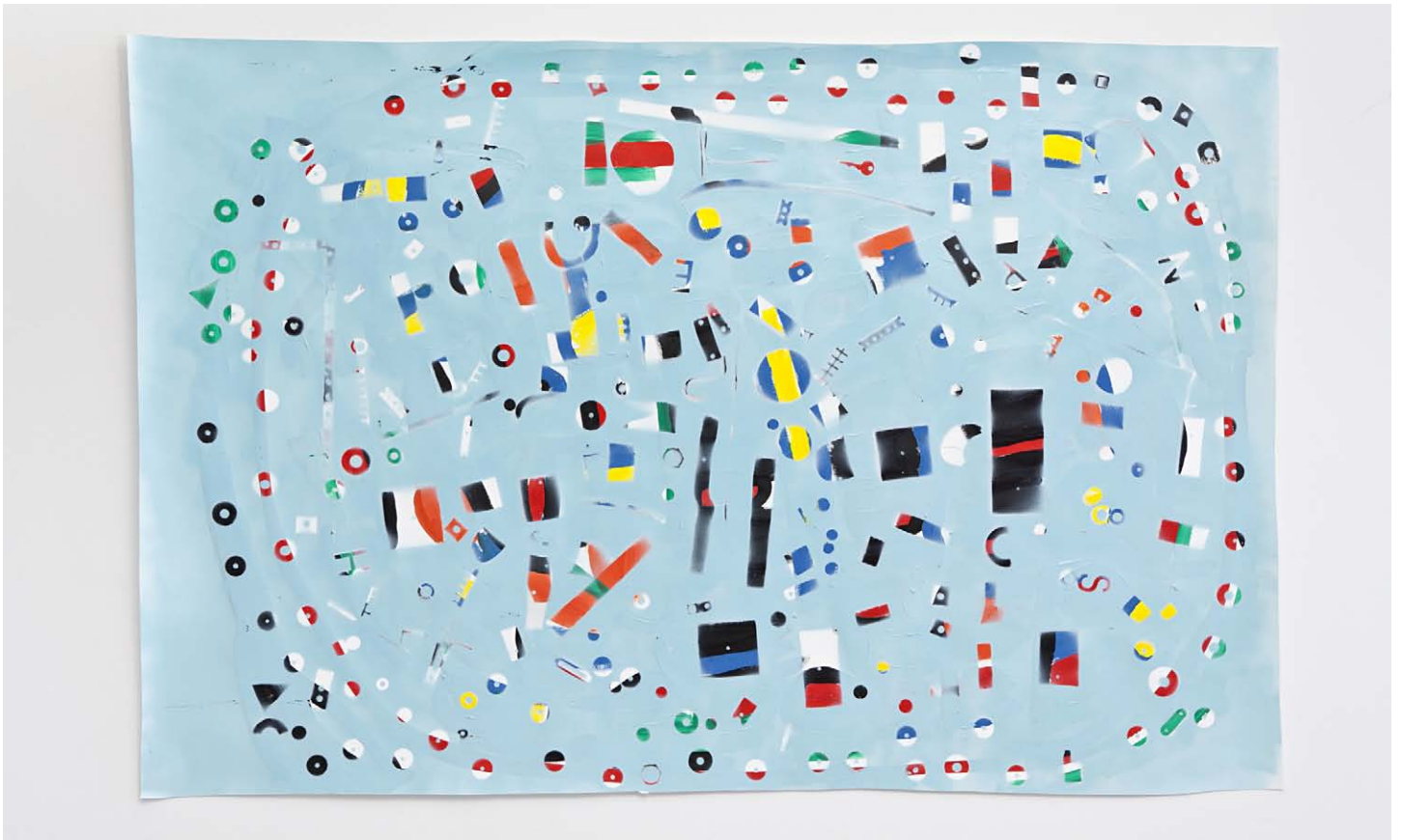
Nathan Carter Brooklyn Street Treasures All City All Lines And All Scheduled Bus Routes, 2012 Paint, paper 116,84 x 175,26 cm Unique (NC 091)