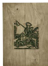
Liam Gillick Pourquoi Travailler? 15/15, 2012 Wooden Board 59 x 39,5 cm edition of 4 (#1/4) (LG 608)