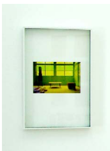
Dominique Gonzalez-Foerster RGB (Print) G 085, 2013 Digital pigment print on archival paper, custom made frames 47,5 x 32 x 4 cm Unique (DGF 228)