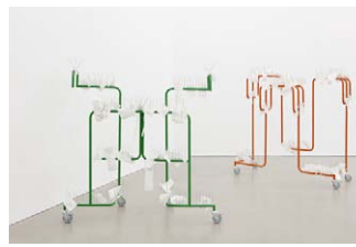
Gabriel Kuri Element A.1, A.2; Element B.1, B.2; Element C.1, C.2; Element D.1, D.2, 2012 Element A.1, A.2: Powder coated metal pipe structure w/ wheels, Pigeon spikes, receipts; Element B.1, B.2: Powder coated metal w/ wheels; Element C.1, C.2: Veneered plywood structure w/ wheels, lined plastic waste bins; Element D.1, D.2: Plexiglas and steel structure w/ wheels, potted plant, newspapers, rock Element A.1, A.2: 120 x 60 x 110 cm; Element B.1, B.2: 190 x 75 x 100 cm; Element C.1, C.2: 180 x 61 x 55 cm; Element D.1, D.2: 165 x 50 x 100 cm (GK 082)