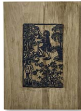
Liam Gillick Pourquoi Travailler? 12/15, 2012 Wooden Board 59 x 39,5 cm edition of 4 (LG 605)