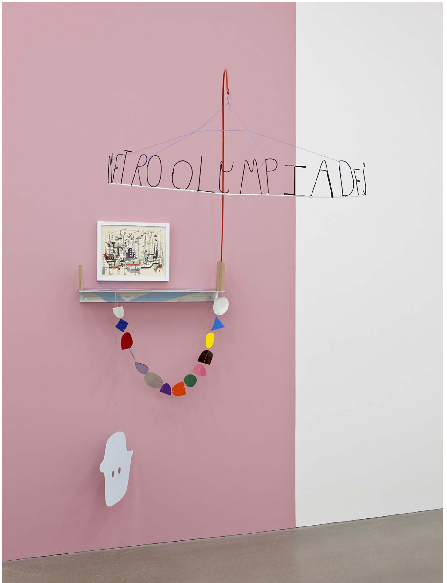
Nathan Carter Metro Olympiades (Light Blue Shelf) , 2013 Aluminum, steel, wood, enamel paint, wire and plastic 63,5 x 15,5 x 101 cm Unique (NC 096)