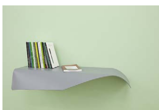
Gabriel Kuri Soft Wave Bookshelf (Grey 2) , 2012 Plywood, linoleum, and steel Shelf surface: 80 x 25 cm Unique (GK 094)