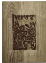
Liam Gillick Pourquoi Travailler? 9/15, 2012 Wooden Board 59 x 39,5 cm edition of 4 (LG 602)