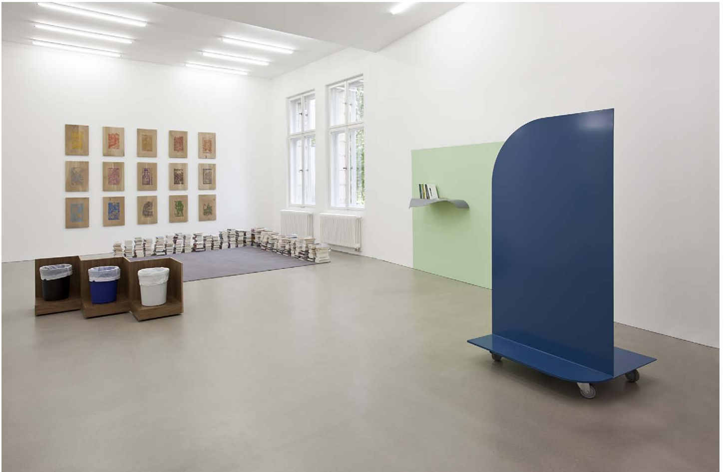
Sommeraustellung , installation view, 2013