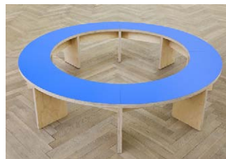
Liam Gillick Prototype Seating For A Revised Production Centre , 2005 Plywood 200 x 200 x 50 cm (LG 291)