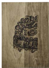
Liam Gillick Pourquoi Travailler? 13/15, 2012 Wooden Board 59 x 39,5 cm edition of 4 (LG 606)