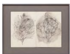
Untitled , 1977 Indian ink on paper 50 x 72 cm (19 3/4 x 28 3/8 in) (unframed) 71,5 x 93,5 x 4,2 cm (28 1/8 x 36 3/4 x 1 5/8 in) (framed) (STB 119)