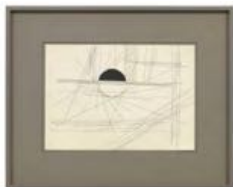
Untitled , not dated Indian ink on paper 30 x 43 cm (11 3/4 x 16 7/8 in) (unframed) 51,5 x 63,5 x 4,2 cm (20 1/4 x 25 x 1 5/8 in) (framed) (STB 024)

For press inquiries please contact David Ulrichs. Tel: +49 (0) 176 50 33 01 35 or david@davidulrichs.com