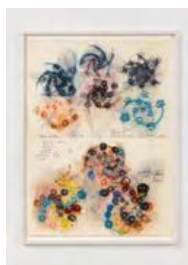
Untitled , 1976 Felt-tip pen, pencil and ball pen on paper 65 x 46 cm (25 5/8 x 18 1/8 in) (unframed) 70 x 51 x 4 cm (27 1/2 x 20 1/8 x 1 5/8 in) (framed) (STB 041)