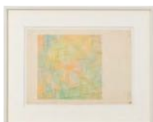
Network , 1973-1974 Colored pencil on paper 34,7 x 48,9 cm (13 5/8 x 19 1/4 in) (unframed) 55,3 x 69,5 x 4,2 cm (21 3/4 x 27 3/8 x 1 5/8 in) (framed) (STB 2694)