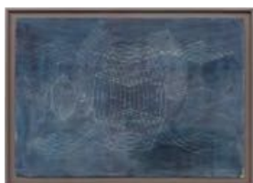
Untitled , 1967-1970 White ink on watercolor primed paper 70 x 100,2 cm (27 1/2 x 39 1/2 in) (unframed) 79 x 109,2 cm (31 1/8 x 43 in) (framed) (STB 117)