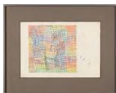
Untitled (Network, coloured) , 1975 Felt-tip pen on paper 35 x 50 cm (13 3/4 x 19 3/4 in) (unframed) 51,7 x 63,7 x 4,2 cm (20 3/8 x 28 1/4 x 1 5/8 in) (framed) (STB 012)