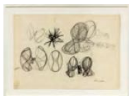
Untitled (zborul) / Untitled (the flight) , 1972 Pencil on paper 35 x 50 cm (13 3/4 x 19 3/4 in) (unframed) 44,5 x 59,5 x 3,5 cm (17 3/8 x 23 1/4 x 1 1/8 in) (framed) (STB 149)