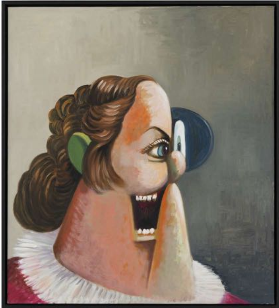
George Condo The Aristocrat , 2008-2009 Oil on linen 101.6 x 91.4 cm 40 x 36 in