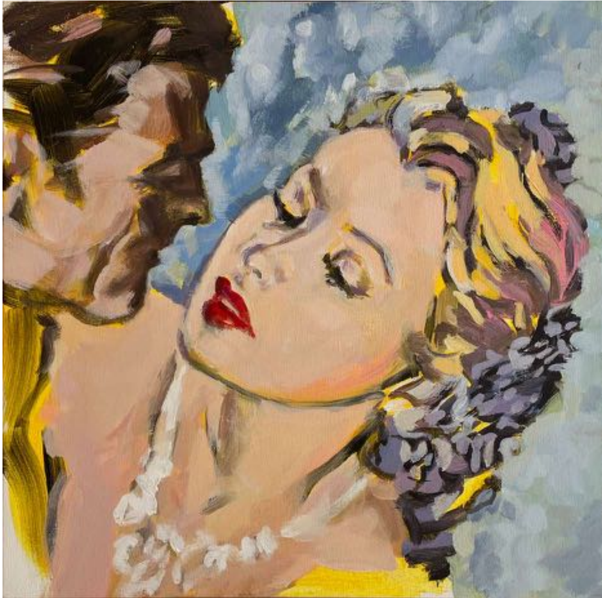
Walter Robinson Gypsy Sixpence , 2016 Acrylic on canvas 45,7 x 45,7 cm 18 x 18 in