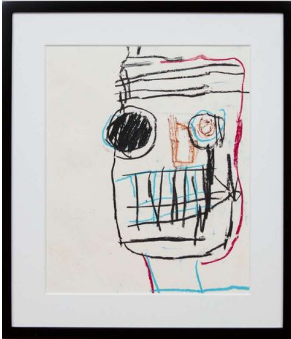
Jean-Michel Basquiat Untitled (Self Portrait), 1982 Oilstick on paper 31.5 x 26.5 cm 12 3/8 x 10 3/8 in