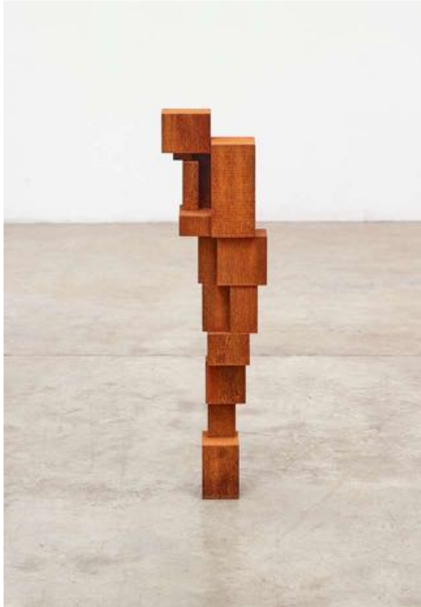
Antony Gormley SMALL SLEW IV , 2015 Cast iron 97.5 x 26 x 18.2 cm 38 3/8 x 10 1/4 x 7 3/16 in