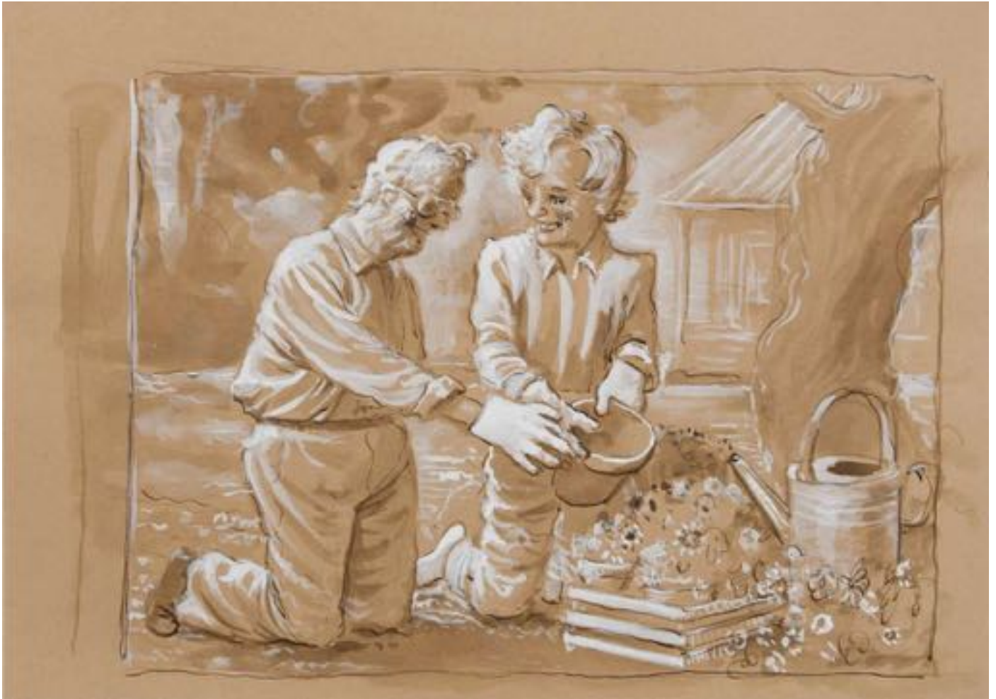
John Currin Untitled, 2001 Gouache and ink on paper 27.3 x 35.6 cm 10 3/4 x 14 in