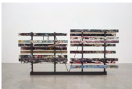
Nick van Woert Rack , 2013 Steel, plastic, garbage 163.5 x 357 x 38.5 cm (64.37 x 140.55 x 15.16 in)