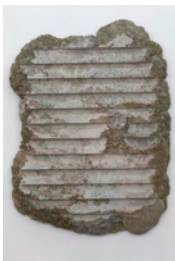
Nick van Woert Fresh Step , 2013 cat litter, steel 177.8 x 121.9 x 10.2 cm (70 x 48 x 4 in)