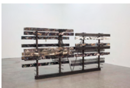
Nick van Woert Rack , 2013 Steel, plastic, garbage 163.5 x 357 x 38.5 cm (64.37 x 140.55 x 15.16 in)