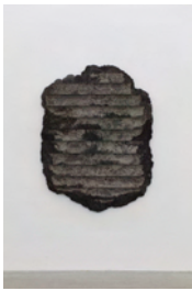
Nick van Woert Black Siding , 2013 cat litter, steel 139.7 x 203.2 x 15.2 cm (55 x 80 x 6 in) 45 kg