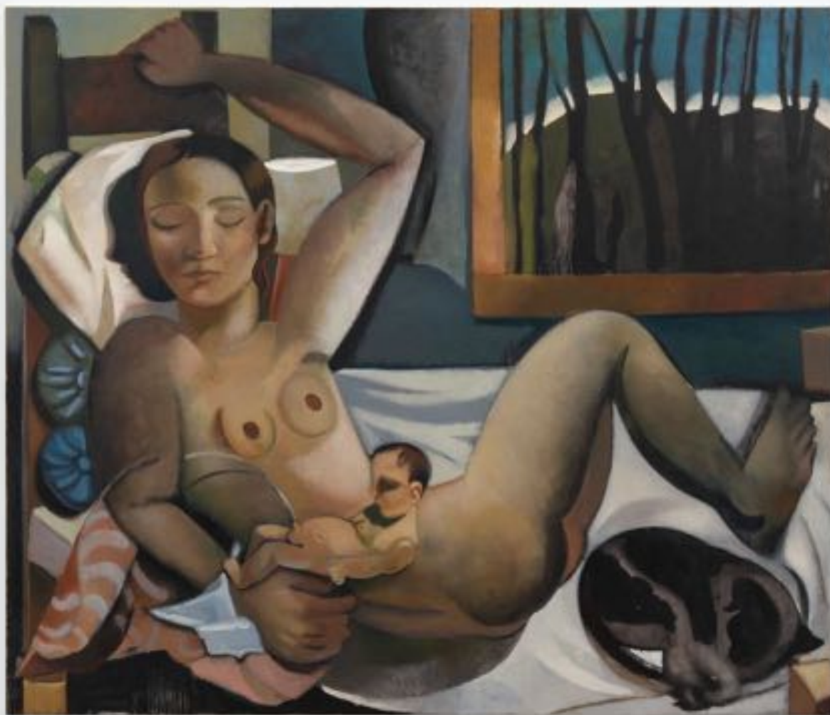
Danielle Orchard, Morning Dew , 2024. Oil on canvas. 174 x 204 cm.