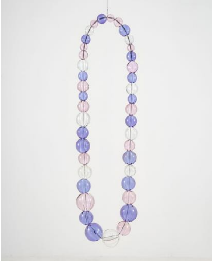
Jean-Michel Othoniel. Collier cristal, rose et alessandrita , 2024. Crystal, pink and alessandrita Murano glass, stainless steel. 190 x 60 x 15 cm.