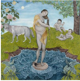
Marina Iglesias La Loba , 2024 Oil on linen 47 1 / 4 x 47 1 / 4 inches (120 x 120 cm) m.iglesias013896