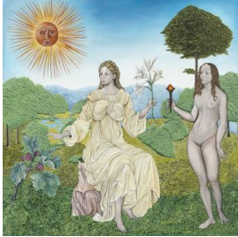
Marina Iglesias El Sol , 2024 Oil on linen 47 1 / 4 x 47 1 / 4 inches (120 x 120 cm) m.iglesias013898