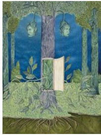
Marina Iglesias Las Raíces , 2024 Oil on linen 31 1 / 2 x 23 5 / 8 inches (80 x 60 cm) m.iglesias013897