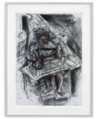
DENZIL FORRESTER The Stitch , 2015

Compressed charcoal on paper 33 1/8 x 23 3/8 inches (84.1 x 59.4 cm.); 40 1/2 x 31 inches (102.9 x 78.7 cm.) framed (DZF24-038)