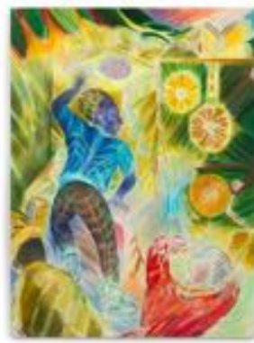
DENZIL FORRESTER DJ Mix , c. 1998

Oil on canvas 72 x 60 1/4 inches (183 x 153 cm.) (DZF24-001)