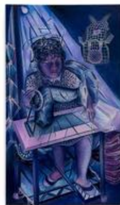
DENZIL FORRESTER Night Shift , 2017

Oil on canvas 79 7/8 x 107 7/8 inches (203 x 274 cm.) (DZF24-021)