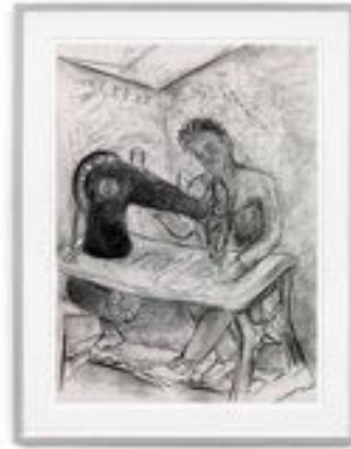
DENZIL FORRESTER Reminiscing , 2015

Oil on board 36 3/4 x 48 5/8 inches (93.3 x 123.6 cm.) (DZF24-007)