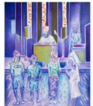
DENZIL FORRESTER Mad Professor , 2024

Oil on canvas 65 3/4 x 38 inches (167 x 96.5 cm.) (DZF24-013)