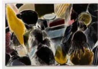
DENZIL FORRESTER In the Fire of Dub , 1985

Oil on board 48 7/8 x 72 1/2 inches (124 x 184 cm.) (DZF24-057)