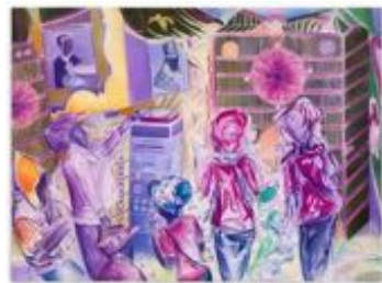
DENZIL FORRESTER Tribute to Shaka , 2024

Charcoal and pastel on paper 23 1/4 x 33 1/8 inches (59.1 x 84.1 cm.); 30 5/8 x 40 1/2 inches (77.8 x 102.9 cm.) framed (DZF24-054)