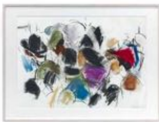
DENZIL FORRESTER Moving Heads , 1986

Oil on canvas 47 5/8 x 72 inches (121 x 183 cm.) (DZF24-014)