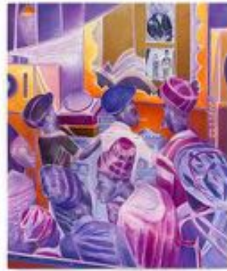
DENZIL FORRESTER Jah Guide Shaka , 2023

Oil on canvas 79 7/8 x 107 7/8 inches (203 x 274 cm.) (DZF24-020)