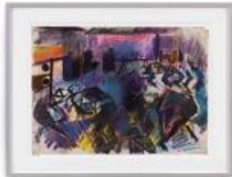
DENZIL FORRESTER Song Clash , 1981

Pastel and charcoal on paper 19 3/4 x 27 1/2 inches (50.2 x 69.8 cm.); 27 3/8 x 34 3/4 inches (69.5 x 88.3 cm.) framed (DZF24-049)