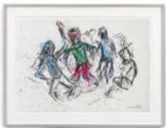
DENZIL FORRESTER Untitled , 2019

Pencil and charcoal on paper 32 1/4 x 23 1/8 inches (81.9 x 58.7 cm.); 40 3/8 x 30 7/8 inches (102.6 x 78.4 cm.) framed (DZF24-048)