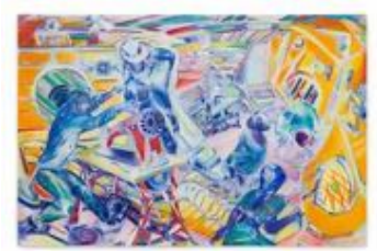
DENZIL FORRESTER Sewing Machine , 2000

Oil on board 48 1/8 x 36 1/4 inches (122.2 x 92 cm.) (DZF24-011)