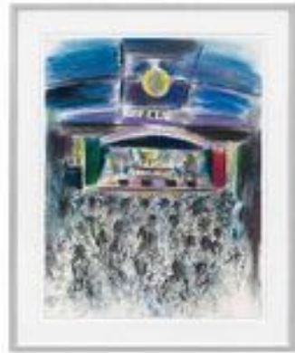
DENZIL FORRESTER Tutti-Frutti Tu, 2024

Oil on canvas 107 7/8 x 79 7/8 inches (274 x 203 cm.) (DZF24-022)