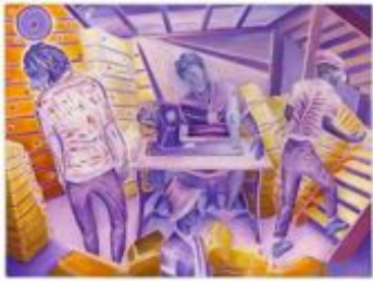
DENZIL FORRESTER Eula & Sons , 2024

Oil on canvas 79 7/8 x 107 7/8 inches (203 x 274 cm.) (DZF24-020)