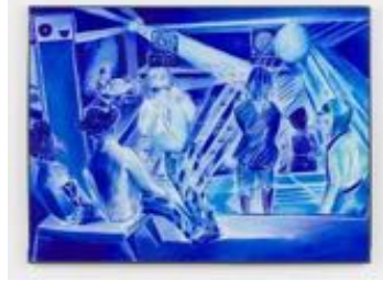
DENZIL FORRESTER Spice , c. 1997

Oil on canvas 72 x 54 1/8 inches (182.9 x 137.5 cm.) (DZF24-037)