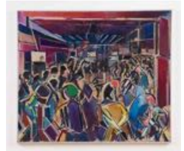
DENZIL FORRESTER The Cave , 1978

Oil on canvas 57 1/2 x 67 inches (146.1 x 170.2 cm.) (DZF24-002)