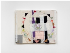
Let's Stay High Forever , 2024 nails, acrylic paint, cotton wool, polyester, silk, metal, glass, linen, paper, felt, ribbon 64.8 x 81.3 x 8.3 cm 25 1/2 x 32 x 3 1/4 in