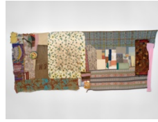
Run Home and Old Sicilian Table Cover Combined , 2019 cloth, thread, paper 180 x 425 cm 70 7/8 x 167 3/8 in