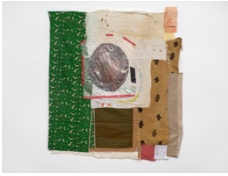
Spirit Guide , 2019 cloth, thread, plastic, safety pin, vinegar skin, linen 188 x 162.5 cm 74 x 64 in