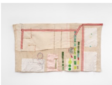
This is the New Earth , 2024 canvas, acrylic paint, ribbon, twine, cotton, silk 55.9 x 101.6 cm 22 x 40 in