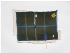
Night sky recording , 2022 cotton batting, silk, cotton, thread, safety pin, polyester 133.3 x 153.7 cm 52 1/2 x 60 1/2 in