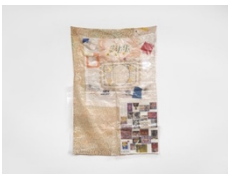
Pray without ceasing, all day, everyday , 2023 cotton, felt, acrylic, plastic, paper, thread, aluminium, crochet yarn, safety pin, staples, flower printing 138.4 x 99.1 cm 54 1/2 x 39 in