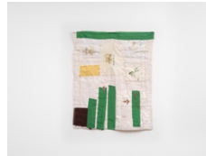
The Trees and The Lake , 2024 linen, silk, cotton, ribbon, wool, thread, paper clip, acrylic, flower printing, dried flower 82 x 60 cm 32 1/4 x 50 1/4 in