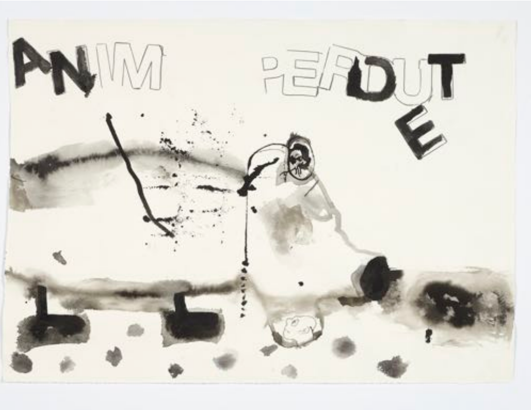
Joe Bradley & Tobias Pils Untitled 2024 Ink on paper 65,5 x 74 cm