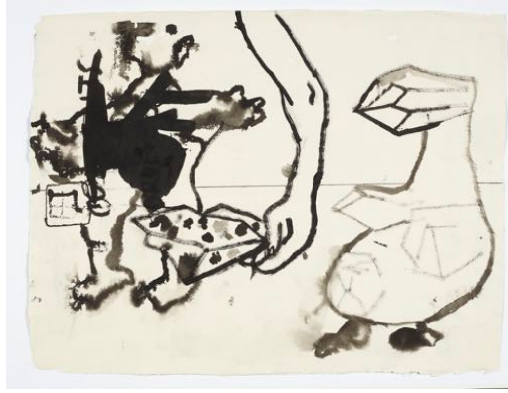
Joe Bradley & Tobias Pils Untitled 2024 Ink on paper 56,5 x 73,8 cm