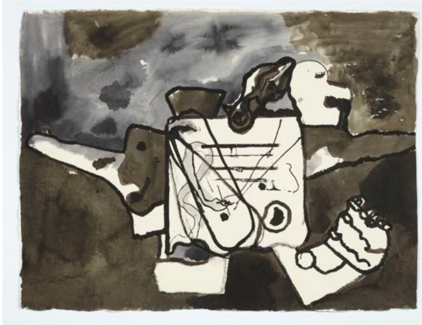
Joe Bradley & Tobias Pils Untitled 2024 Ink on paper 56 x 74,5 cm