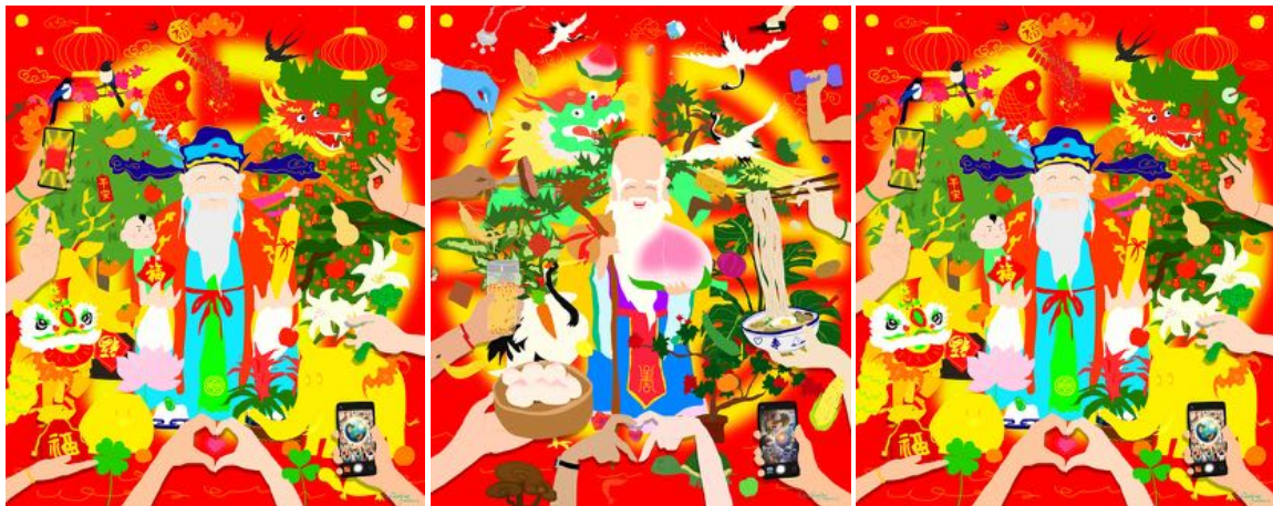
Blessing Set, Longevity Set, Fortune Set, 2023-24, Mouse painting on computer, Unique, Archival inkjet print, 180 x 150cm