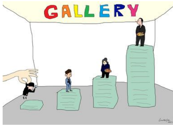
I am the Last One , 2024, mouse painting on computer, unique, archival inkjet print mounted on aluminium, 60 x 80cm

The Chinese title “人间” roughly translates to ‘the world of mortals’, highlighting the observations of the human society from a broader perspective. However instead of positioning himself as a superior viewpoint, Lin humorously inserts himself across his works. These paintings reference various settings such as the life of an artist and the art gallery system, to the geopolitical situation, as well as the unspoken rules and power dynamics in a society.