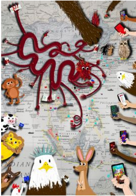
My Global South, 2024 , iPad painting, unique, archival inkjet print mounted on aluminium, 100 x 70cm

Singapore, August 2024 – ShanghART Singapore is delighted to present Lin Aojie's solo exhibition "Playing it Safe in 2023, Praying for Wealth in 2024", opening 7 September 2024 at 4pm. The exhibition brings together recent works by the artist, showcasing witty insights gathered from his observations of the art industry, the society, and the world at large.