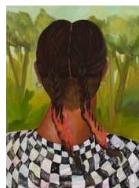
Florine Imo Talk To Me , 2024 Acrylic and oil on canvas 43 1 / 4 x 31 1 / 2 inches (110 x 80 cm) f.imo013736