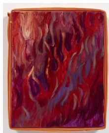
Florine Imo Counting To 10 , 2024 Acrylic and oil on canvas 9 7 / 8 x 7 7 / 8 inches (25 x 20 cm) f.imo013733