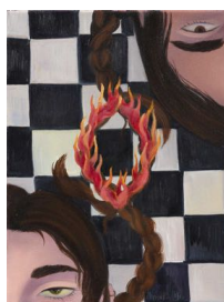
Florine Imo Twin Flames , 2024 Acrylic and oil on canvas 15 3 / 4 x 11 3 / 4 inches (40 x 30 cm) f.imo013732