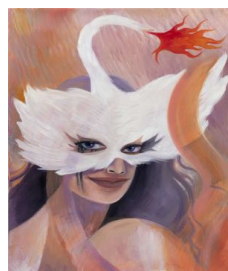
Florine Imo I'll Come Find You , 2024 Acrylic and oil on canvas 23 5 / 8 x 19 5 / 8 inches (60 x 50 cm) f.imo013731