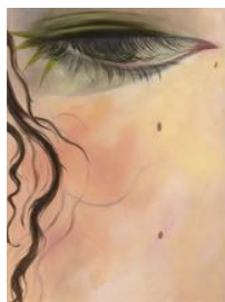
Florine Imo Frozen , 2024 Acrylic and oil on canvas 43 1 / 4 x 31 1 / 2 inches (110 x 80 cm) f.imo013730