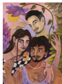
Florine Imo Same Source , 2024 Acrylic and oil on canvas 43 1 / 4 x 31 1 / 2 inches (110 x 80 cm) f.imo013735