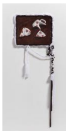
Florine Imo Healing , 2024 Acrylic and oil on canvas 11 3 / 4 x 15 3 / 4 inches (30 x 40 cm) f.imo013737