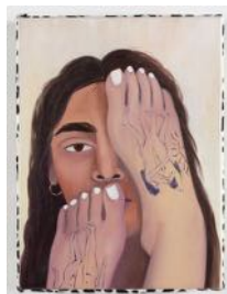
Florine Imo Just Tell Me , 2024 Acrylic and oil on canvas 15 3 / 4 x 11 3 / 4 inches (40 x 30 cm) f.imo013739