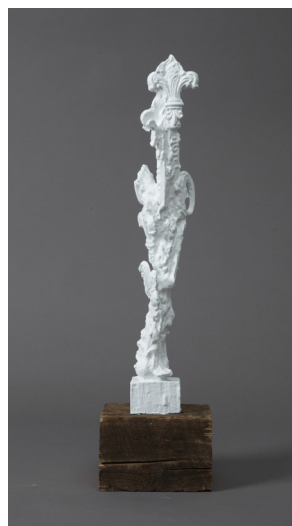
ENOC PEREZ. PARIS. FOTELSANJUAN, 2013 - BRONZE - 71,12 X 112,7 X 13,4 CM - 28,0 X 44,3 X 5,3 IN.

Enoc Perez was born in 1967 in San Juan, Puerto Rico, where he lived until the end of his teen years. In 1986, he moved to New York, where he has lived and worked ever since. Enoc Perez graduated from the Pratt Institute in New York in 1990, earning his MA at Hunter College in New York in 1992. Since the mid-1990s, he has shown in a number of institutions, with exhibitions including 'Skyscraper: Art and Architecture Against Gravity' in 2012 at MOCA (Museum of Contemporary Art) in Chicago, as well as at the prestigious Corcoran Gallery museum in Washington, with his solo show, 'Utopia', in 2012.