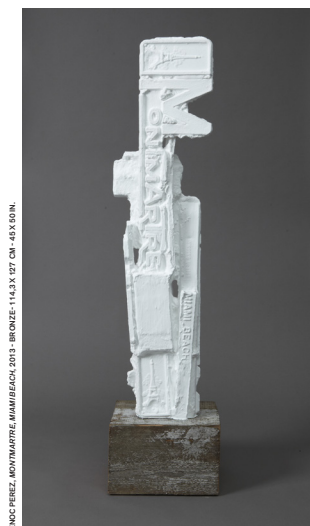
ENOC PEREZ. MONTMARTRE. MAM/RBCCI, 2013 - BRONZE - 114,3 X 127 CM - 45,3 X 50 IN.